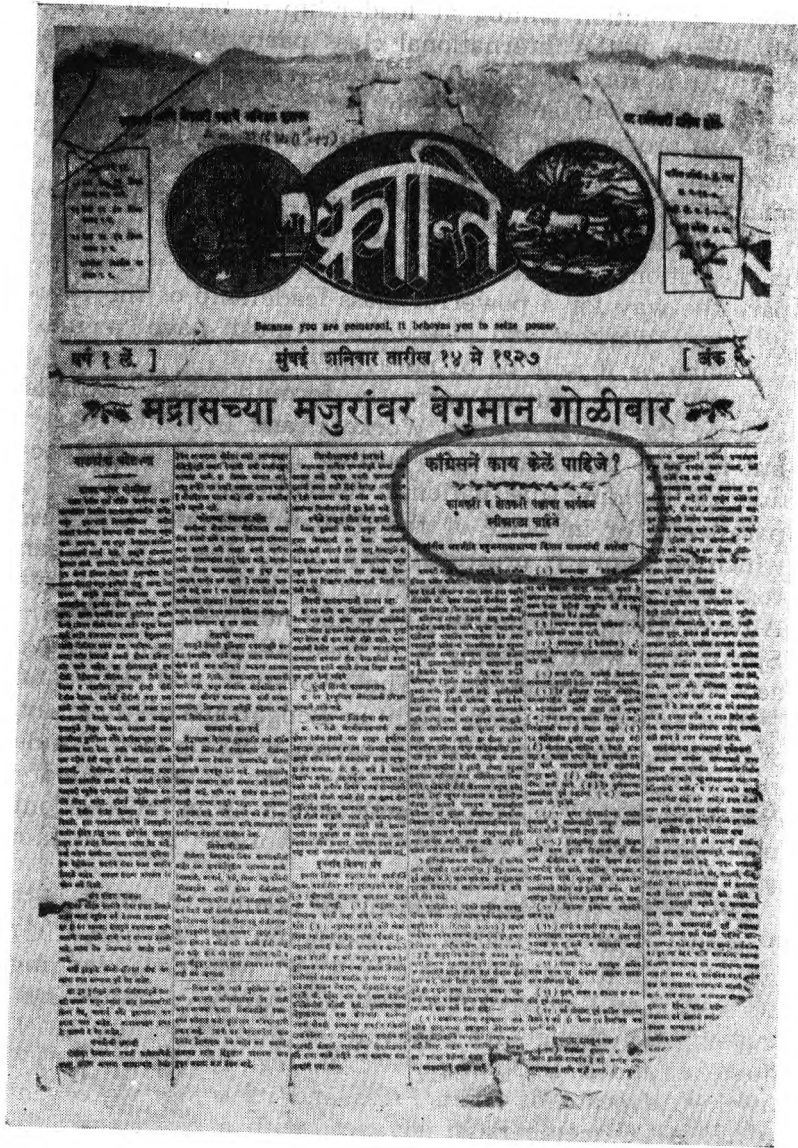
Kranti, 14 May 1927, which published the program of the WPP for the National Congress.

The Masses from abroad, dealt with the program in its issue of June 1927 in the article headed "The National Congress Program". This article mentions that the program was taken note of by the premier nationalist daily of Bombay, the Bombay Chronicle . The paper commented: "The only method of pushing the congress movement ahead is to reconstruct its program on the broad lines of uniting all national forces for joint action in the legislatures and of enlisting the active cooperation of the peasants' and workers' organisations for work outside them. In so far as the new party seeks the reorientation of the Congress on these lines, we ungrudgingly accord our support."