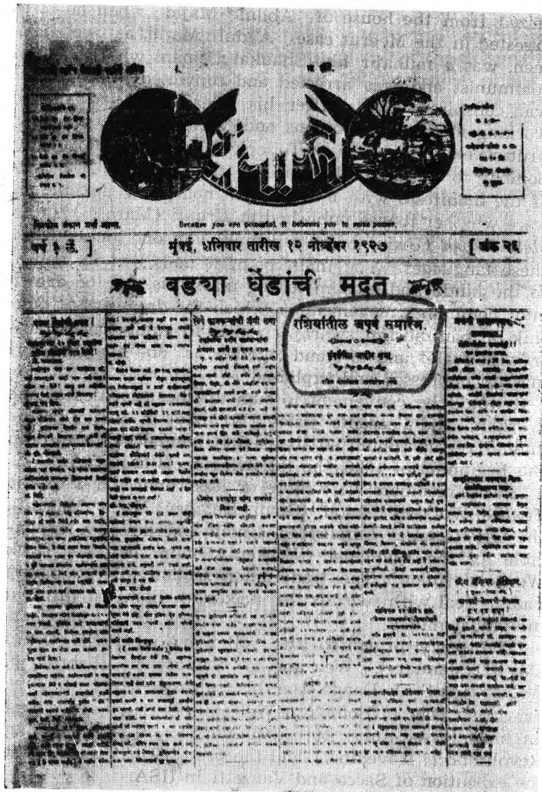
Kranti , 12 November 1927, gives a report of the public meeting in Bombay to celebrate the 10th anniversary of October Revolution.