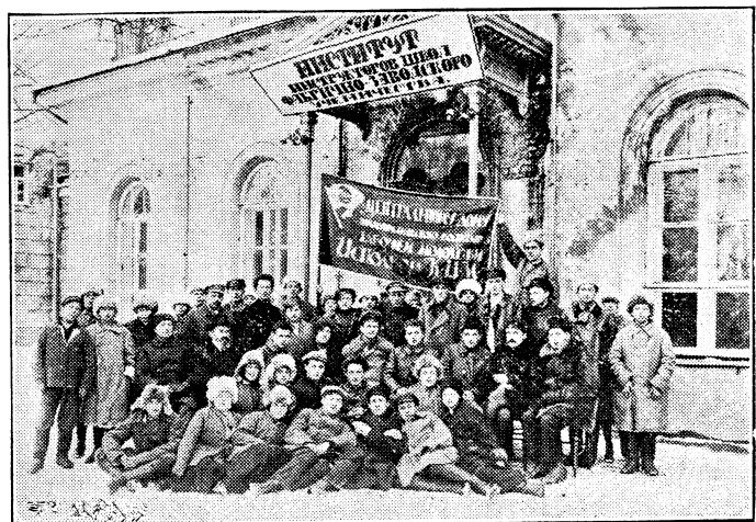
A Group of Young Russian Technical Students