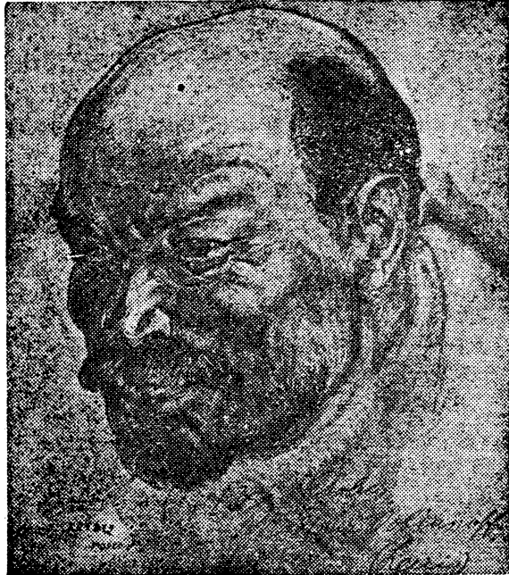
—Cesare in N. Y. Times Lenin, Premier of the Soviet Republic, has bought two shares in this Industrial Corporation founded by American Organized Labor.

Russia, mighty Russia, ruled by the workers and peasants, is in RAGS. But how is it possible to supply enough clothing for 135,000,000 people? Send them money for