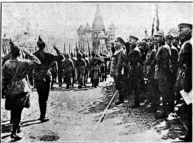
Trotsky Reviewing the Red Army

The spirit shown by the delegates to the Second Annual Convention of the Workers Party seemed as if it was borrowed from one of our own conventions—it