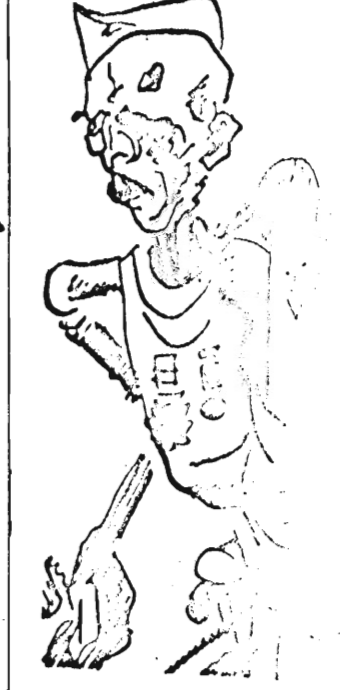
After Fighting for...

"I ask for a sentence that will ring thruout the army and teach a lesson to the reds," said the assistant judge advocate at my court martial. The result was more than the agent of Wall Street could have desired. The sentence rang thruout the army, telling the soldiers that they have no right to think—that they are valuable only for cannon fodder. But of even greater importance, its echo was