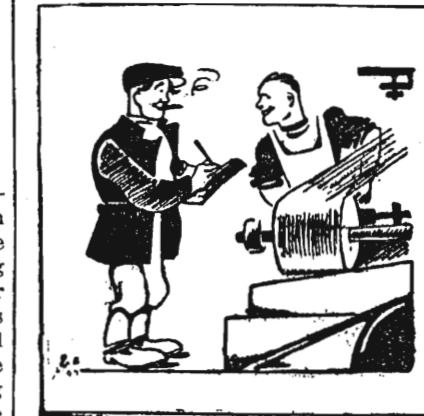
Young Worker Correspondent