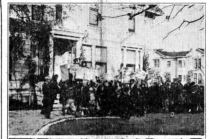
Only Police were on hand at Governor Rolph's House to greet the delegation of 110 Children to demand Relief.