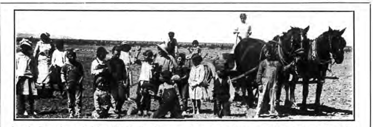
Lots of willing workers at the Industrial School. Note the teamster, showing equality of sexes as well as equal suffrage at Llano. They will have lots to do with harvesting the garden produce this summer.

Death-new births-death-birth. The cycle goes ever round so far as individuals are concerned. The individual