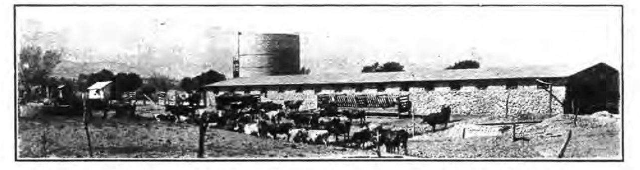
In addition to the Llano dairy herd, many more will be brought in from the ranges within a short time.

This is but a portion of the history of Llano recited especially for this Anniversary Number. As much more could be written and then scarcely touch the subject. Llano's history is already a complex fabric, and it is known in its entirety to no man. But its development is now the thing of prime importance and the foregoing sketch should prove convincingly that Llano has progressed more rapidly and substantially than even the most optimistic had a right to hope or expect.