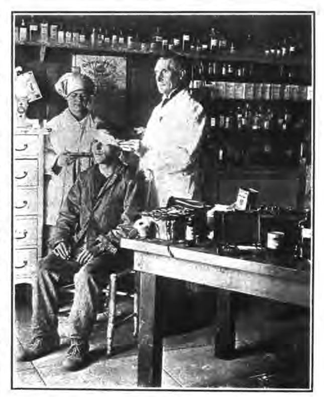
MEDICAL ATTENTION at Llano is a social service and is free to Llano residents. Eventually this department will take in every school of healing.

In the evolution of industry from capital-ownership to cooperative ownership by the workers (from individualism to Socialism), the lessons of service for the common good, of the necessity for free access to land by the workers, of the power and economy of co-operation, of the ethics of mutual exchange of labor values, of industrial justice, of educational freedom—all these will find a place in the curriculum of the public school in time. But industrial education in trades schools operated for profit is practically only the training of wage slaves for capitalism to exploit. The ideals of industrial life (freedom and justice to the workers) are not set forth in their claims for patronage and are impossible of realization;