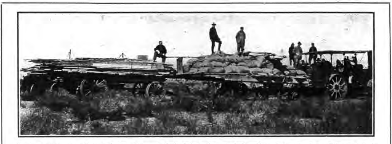
One of the new tractors bringing in lumber and cement. Both of the trailers were built at Llano. The engine is now being used on the trailers are built to the timber in the mountains south of the Colony.

dies; the species is perpetuated through the ages. Acons see the species disappear; life continues. The single organization exists only to advance the ever-upward movement of society.