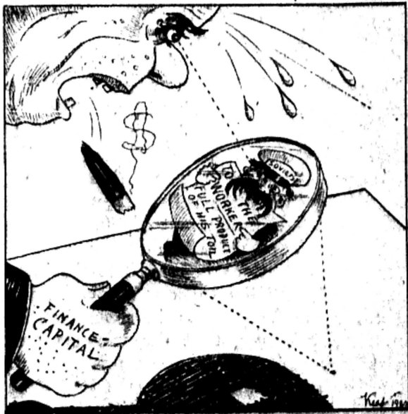
Looking At The Bolshevik Germ.