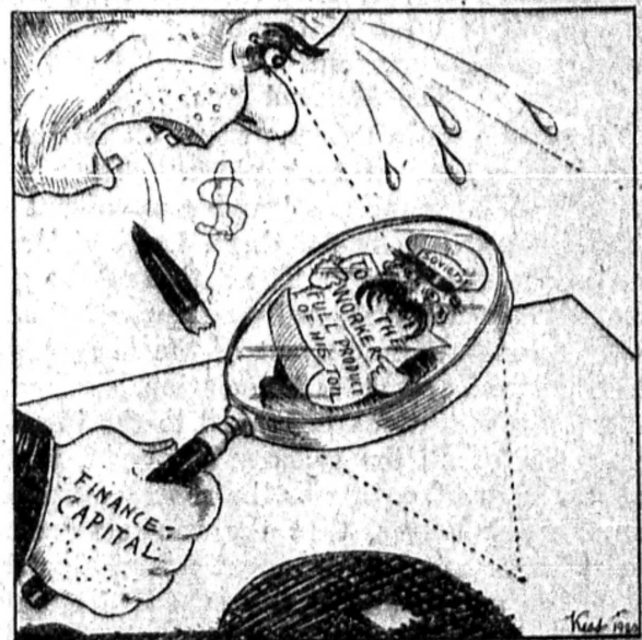
Looking At The Bolshevik Germ.