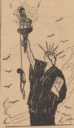
DO YOU GET A BUNDLE?

TRION, Ga.—The Trion Textile plant here, one of the most-terrible exploiters of labor, is opening a glove factory. Several hundred workers are being herded into a small space and work for two to three dollars a week. Most of them never heard of organization until they got in here, so it is not easy to build a branch of the National Textile Workers' Union, but we are trying.