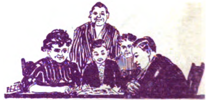
"The Whole Family Can Play It."