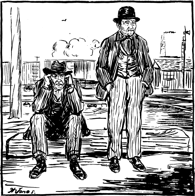
“DOWN AND OUT.”

face of the people and they continue to do it day on day! The police maintain there is no such thing as innocence or virtue, except it is fortified by plenty of money in the banks. Under the present system, they are pretty near right about it. And as I have outlined before, the police hate an innocent man or woman a thousand times worse than they hate the most degraded criminal. Should the prisoner not