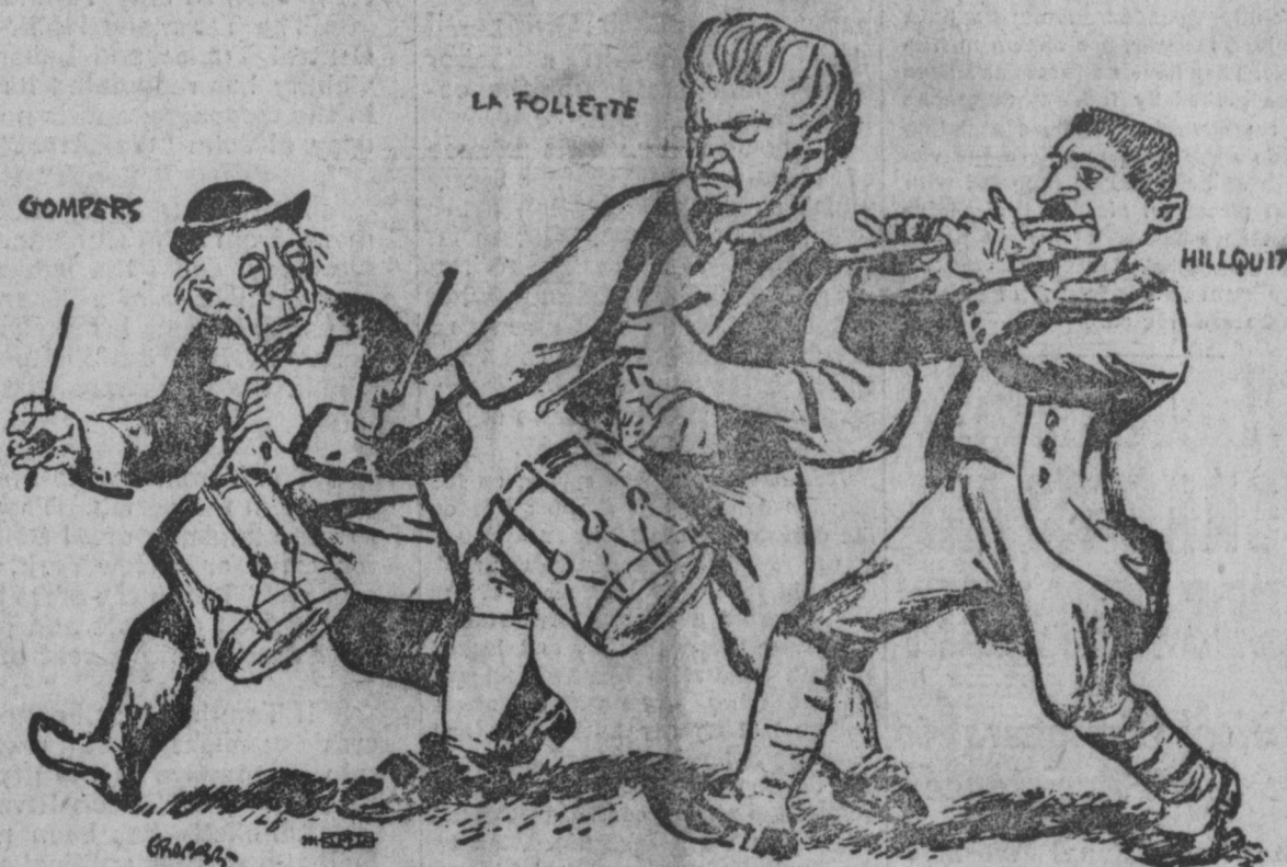
The Left Wing of Capitalism On the March—Backward

to win their return to Washington in the November elections.