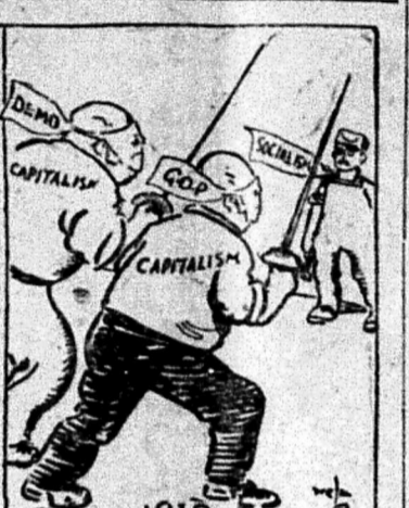
The Sham Battle. The Twins—"Oh, this is glorious. It amuses the people and it doesn't hurt us!"