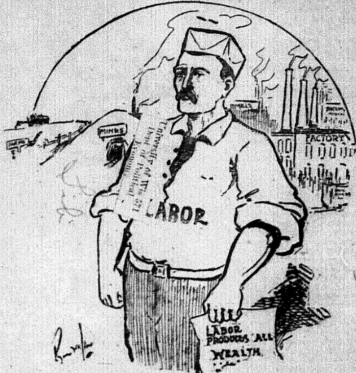
The Santa Claus of the World. And like the mythical Santa of our childhood, he fills the stockings of the rich and neglects his own.

"THE country is prosperous," says the president. Thirteen pages of the Salt Lake Daily Telegram is required to print the property for sale because the owners can't get money enough to pay the taxes. You bet the country is prosperous—for the grafters and profit-mongers of the upper circle. Who said it wasn't?