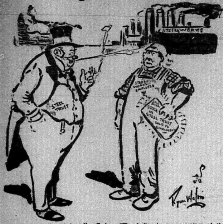
Says a press dispatch from New York: 'The decline in gross earnings of the United States Steel corporation is expected to seriously affect the profit-sharing plan for employees in 1902. There will not be enough surplus to permit the payment of the lowest percentage, but officials say that the plan will be resumed when earnings are better.'