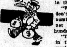
ONE IN A HUNDRED.

"How many working people get rich in this country, pa?" "Well, er-er-er, I don't know the exact number but I suppose not over one in a hundred."