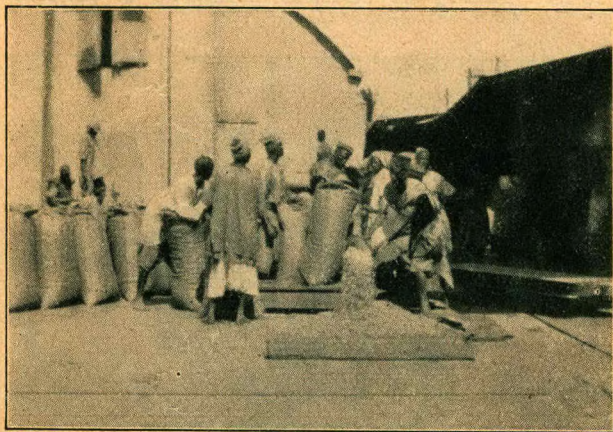
Loading cocoa in the Cameroons at nine pence (18 cents) per day.

The situation today is appalling. The majority of the peasants are ruined and thousands of workers are jobless. Since the unemployed do not get social insurance they are forced to starve. Added to this, the entire native population is forced to pay high taxes in order to enable the imperialists to maintain their oppressive governmental system.