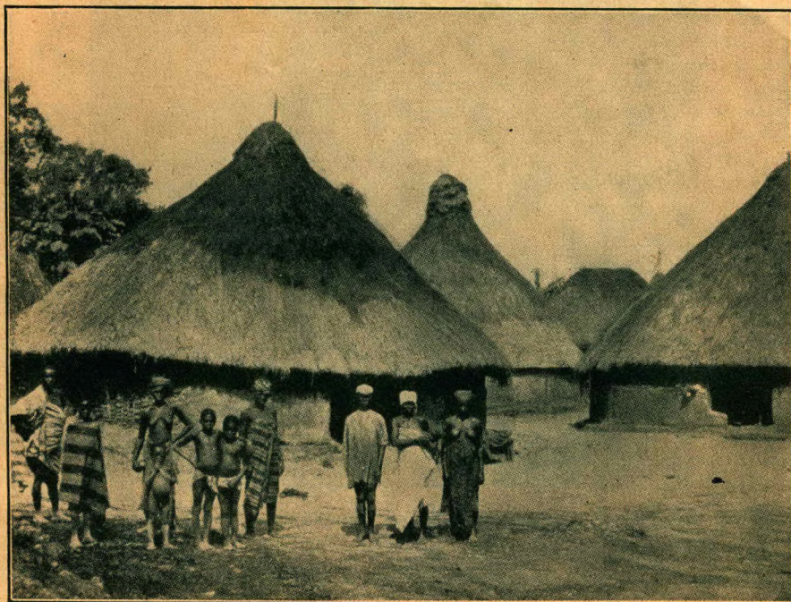
A Congo Village.