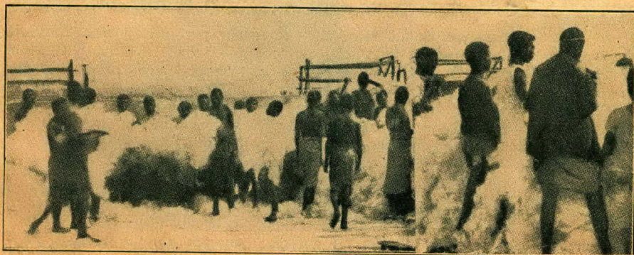
Natives gathering cotton in Uganda, East Africa, to supply Lancashire mills.