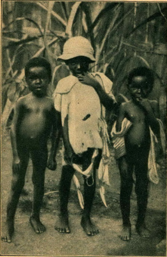
West Indian Children. "Their tattered garments actually falling to pieces from their poor emaciated bodies."

The Negro masses of the West Indies must not forget the bitter lesson of disillusionment they experienced at the hands of the arch-misleader, Garvey.