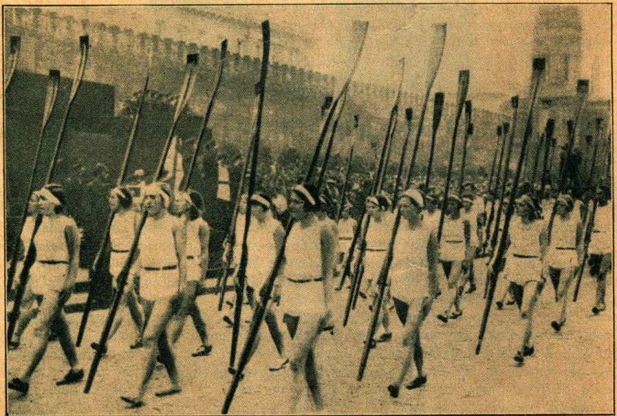
Working girls in Russia marching at a Sports Meet.

The country I represent is in a less favourable position as regards security than other countries. Only 14 years ago, it was the object of armed attack on all its frontiers, of blockade and of political and economic boycott. For 14 years it has been the object of indescribable slander and hostile campaigns. Even now many States, including one of the strongest naval powers, do not conceal their hostility to it, even to the extent of refusing to establish normal peaceful relations, and many States maintaining normal relations with it have refused to conclude or confirm pacts of non-aggression. The present events in the Far East, which have evoked universal alarm, cannot but cause special anxiety in the Soviet Union, owing to its geographical nearness to the theatre of these events, where huge armies are operating, and where anti-Soviet Russian émigrés are mobilizing their forces. Despite all this I am empowered to declare here the readiness of the Soviet Union to disarm to the same extent and at the same rate to which the other powers, first and foremost those actually at its borders, may agree.