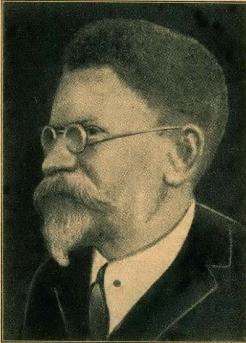
Kalinin, President of the Soviet Union

Nor do we underrate the importance of international treaties and undertakings for peace. My government adhered to the 1928 Paris Treaty at the time and even put it into force with neighbouring States earlier than it was done by the Treaty's own initiators. My government itself makes a practice of concluding mutual non-