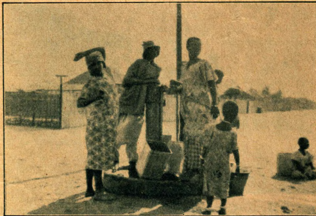
Children carrying water in Duala in order to help their over worked parents.

The workers are terrorised to an unheard of extent. Whenever they endeavour to organize they are simply hanged as rebels. Whenever they complain against their bosses or against the foremen they are mercilessly whipped. The officials of the concession companies are, according to law, considered to be civil servants and, as such are entitled to mete out punishment: even if they kill a native they are not called to account as they acted in the interests of humanity and in defence of European culture. Among the 1,800,000 inhabitants of Cameroon only about