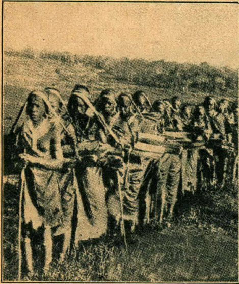
Women Doing Forced Labour in Kwango After the Uprising.

But in the communiqués and in the Belgian capitalist newspapers one can read that "peace" is ruling everywhere, even in the burnt down villages and among those thousands that were killed. Such are the "blessings" of white imperialist rule in the lands of the blacks.