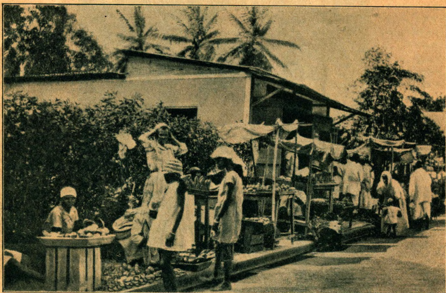
A peasant market along the roadside in Trinidad.

As a necessary pre-requisite toward the dispelling of all illusions in their struggles, the Negro masses of the West Indies must first of all understand their