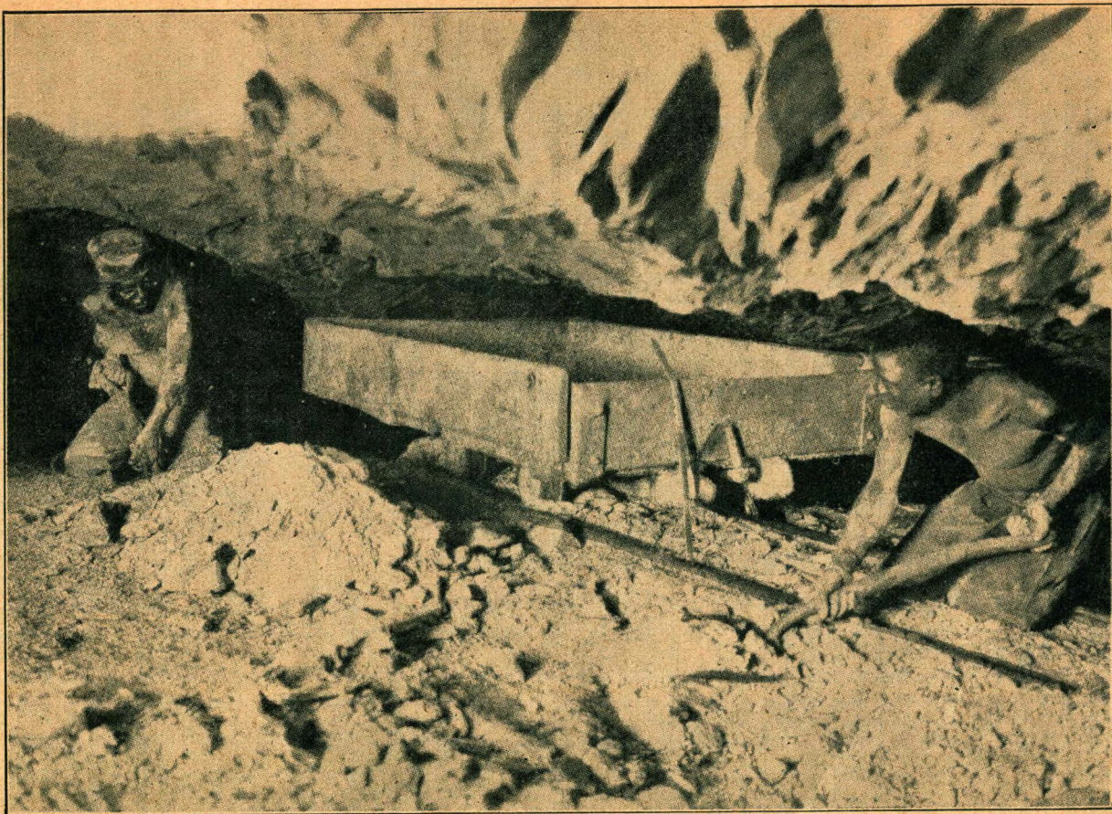
Natives in the gold mines of South Africa working for two shillings per day. This is how the capitalists make their super-profits.