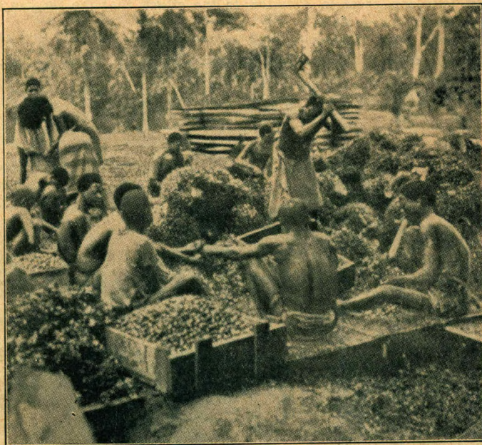
Forced Labour on Palm oil plantation in the Congo.

When the company which owns the sugar plantations of Moabeke wanted to