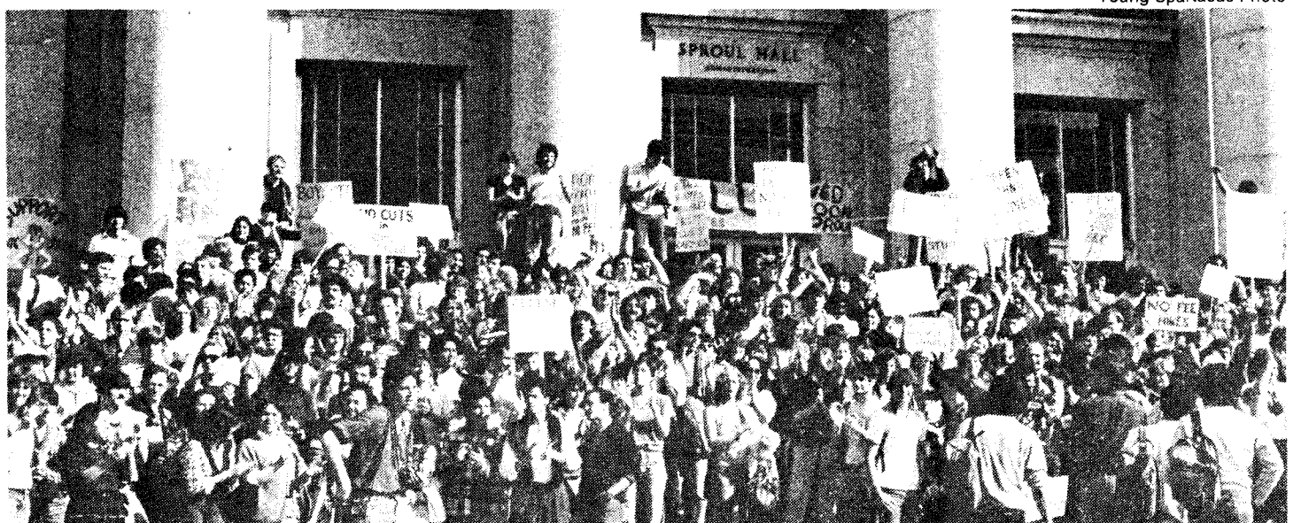
4,000 Berkeley students rally against fee hikes, February 16.

League (SYL), caused Kirkpatrick to cancel a second scheduled appearance on campus February 16 while the administration railed against the "Children" (!) who had dared to run the imperialist operator off campus with her tail between her legs.