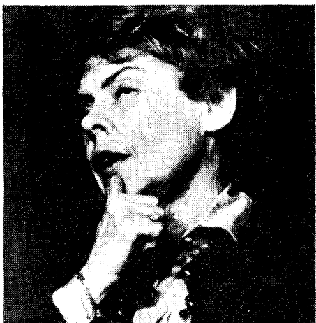
Imperialist running dog Jeane Kirkpatrick was run off Berkeley February 15. Next she cancelled an appearance at her alma mater, Smith College. The administration couldn't "assure her security."