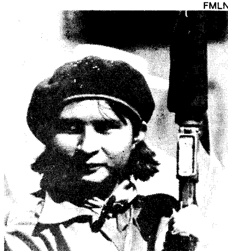
Salvadoran guerrilla fighter

"roll back Communism"—a war drive aimed at El Salvador, Nicaragua and Cuba and ultimately at the Soviet Union. Thus in January the State Department "certified" that the Salvadoran government has made a "concerted and significant" effort to stop indiscriminately murdering the populace. Also last month, U.S. and Honduran troops conducted "war games" along the Nicaraguan border, a clear provocation against the petty-bourgeois radical Sandinista regime. In this connection, the counterrevolutionary pope Wojtyla is scheduled to visit Central America in March. The pope's visit will certainly be the occasion for a mobilization of the domestic bourgeoisie in Nicaragua,