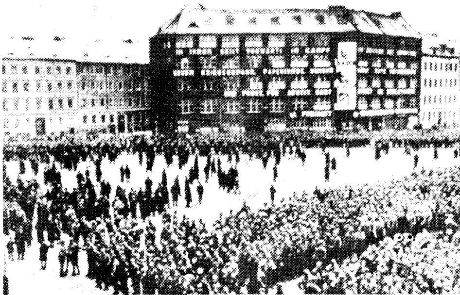
Nazi stormtroopers marching on German Communist Party headquarters.

Social Democratic organizations. With such progressive elements it is obviously necessary to establish the closest possible contact. At the present time, however, they are not great in number. The German worker has been raised in the spirit of organization and of discipline. This has its strong as well as its weak sides. The overwhelming majority of the Social Democratic workers will fight against the fascists, but—for the present at least—only together with their organizations. This stage cannot be skipped. We must help the Social Democratic workers in action—in this new and extraordinary situation—to test the value of their organizations and leaders at this time, when it is a matter of life and death for the working class.