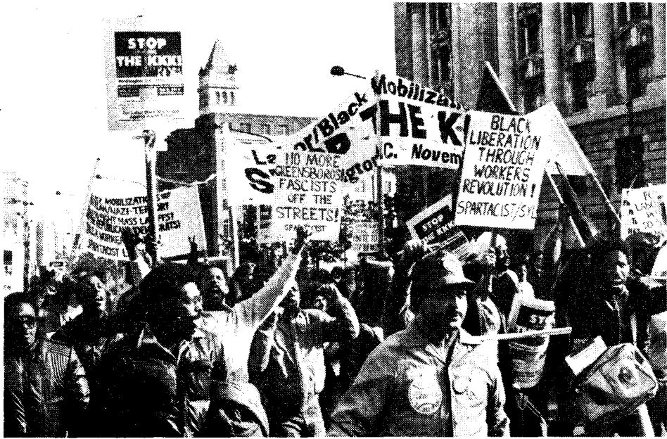
November 27 Labor/Black Mobilization to Stop the KKK was a united-front action of trade unions, black militants and socialists.

Democratic leaders to act against Hitler and his stormtroopers or stand exposed before their ranks as passive capitulators to the fascist menace.