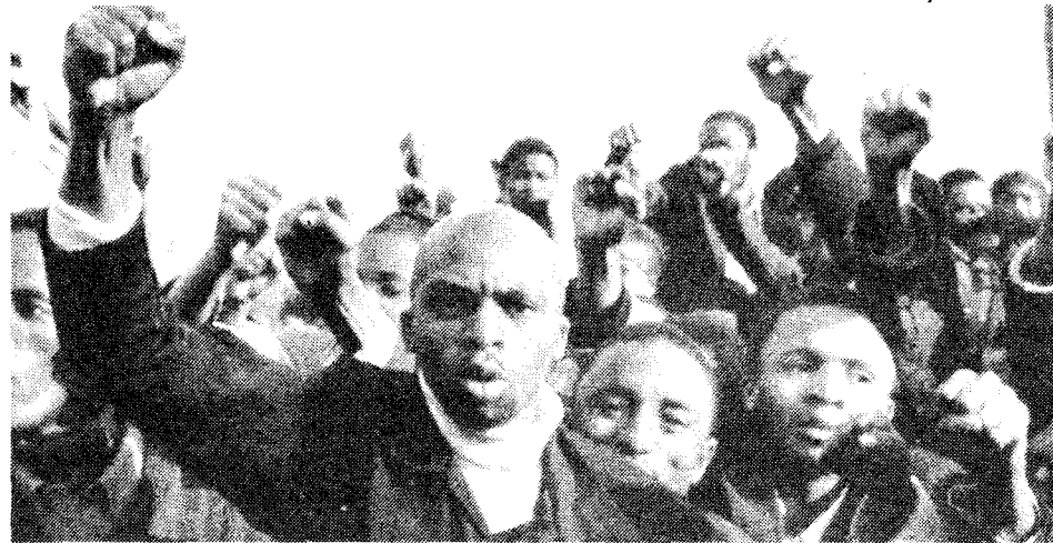
1977: Defiant black youth at funeral of Steven Biko, leader of "black consciousness" movement assassinated by South African police.

leading proponent of the liberal campaign for university and corporate divestment of holdings in South Africa—a moralistic movement which appeals to U.S. imperialism to exercise economic "pressure" on its apartheid ally. To appeal to the racist U.S. ruling class—which metes out its "justice" for blacks with dum-dum bullets, chokeholds and jail cell lynchings—to "act morally" is suicidal. As the world's foremost imperialist power, the U.S. does not and will not act in the interests of social progress anywhere . The reformist advocates of divestment are some of the same people who supported the sending of the "peacekeeping" U.S. Marines to Lebanon, where the "progressive" role of U.S. imperialism was hideously demonstrated in the disarming of the PLO and resulting slaughter of defenseless Palestinian refugees at Shatila and Sabra. It is the multi-millioned black proletariat of South Africa, the key to socialist revolution throughout the continent, which has the power to smash apartheid!