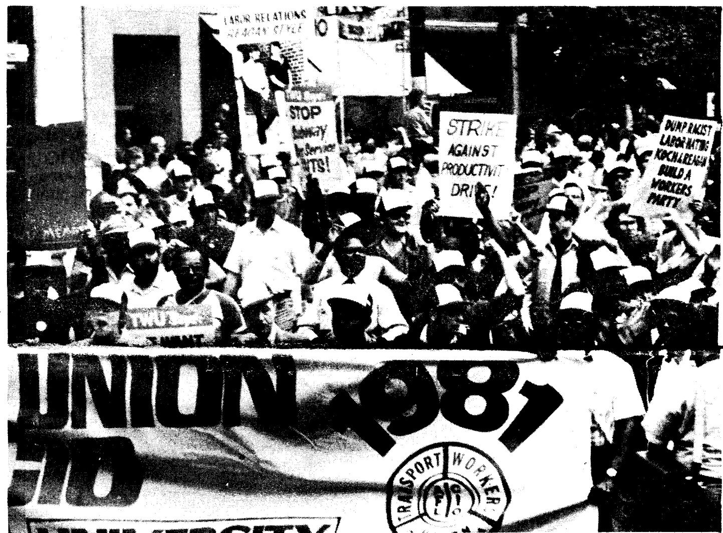
Labor Day 1981: Anger at the base against strikebreakers Reagan/Koch.

The labor movement has the power to turn back Reagan's attacks, but not by installing the old set of capitalist