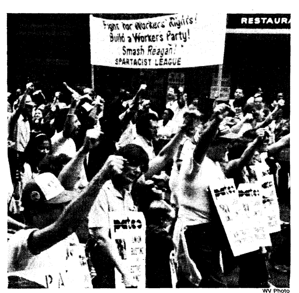
NYC Labor Day march, September 7: SL called on labor to shut down the airports.

Recently there has been a flurry of "labor party" talk from some union tops as they found it difficult to sell the unappetizing bourgeois "alternatives," Reagan and Carter. In California, state