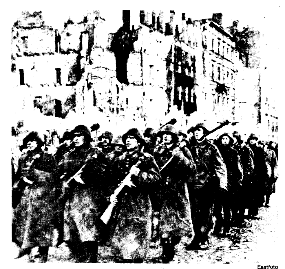
Soviet-sponsored Polish army reaches devastated Warsaw, 1945.

In the next weeks, 50,000 Polish combatants fought alone in desperate conditions. The Soviet army was thrown back from Praga by the German counteroffensive "nearly 100 kilometers" (65 miles) according to the Soviet