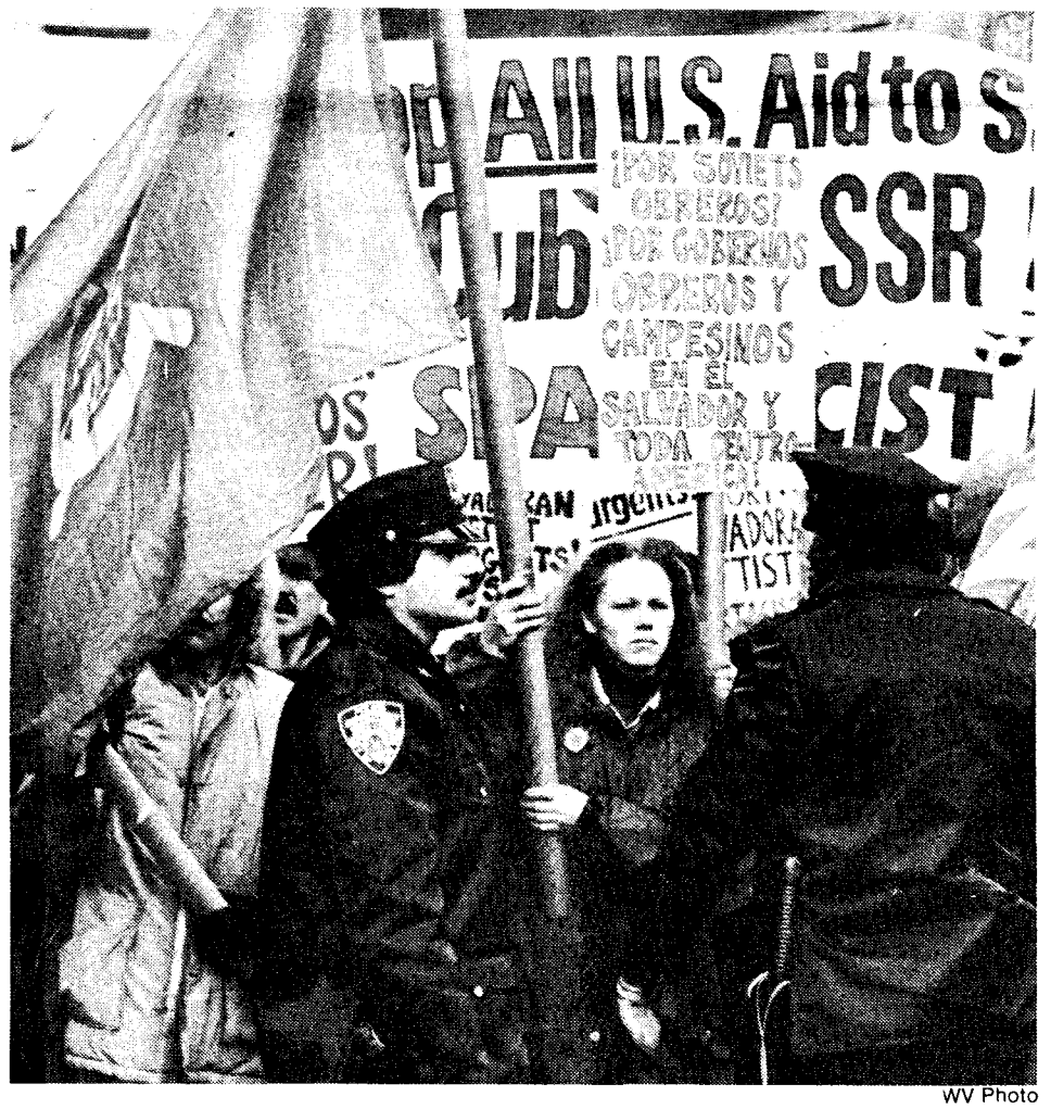
November 12, NYC: Reformists use cops to exclude SL contingent, which called for defense of Cuba, USSR against imperialist war threats.

Thus in New York the organizers of the "Emergency Campaign Against U.S. Intervention in Central America and the Caribbean" called in the police to keep the Trotskyist politics of the SL out of their liberal peace crawl. As the Spartacist contingent arrived at the Times Square assembly point, CP/SWP goons ineffectually tried to block us and force the SL to the other side of the street. When this didn't work representatives of the Antonio Maceo Brigade asked us to take down our banner. "Defense of Cuba and USSR Begins in El Salvador," but backed away when met with a flat refusal. Thereupon "Emergency Campaign" spokesmen called the cops to keep out the commu-