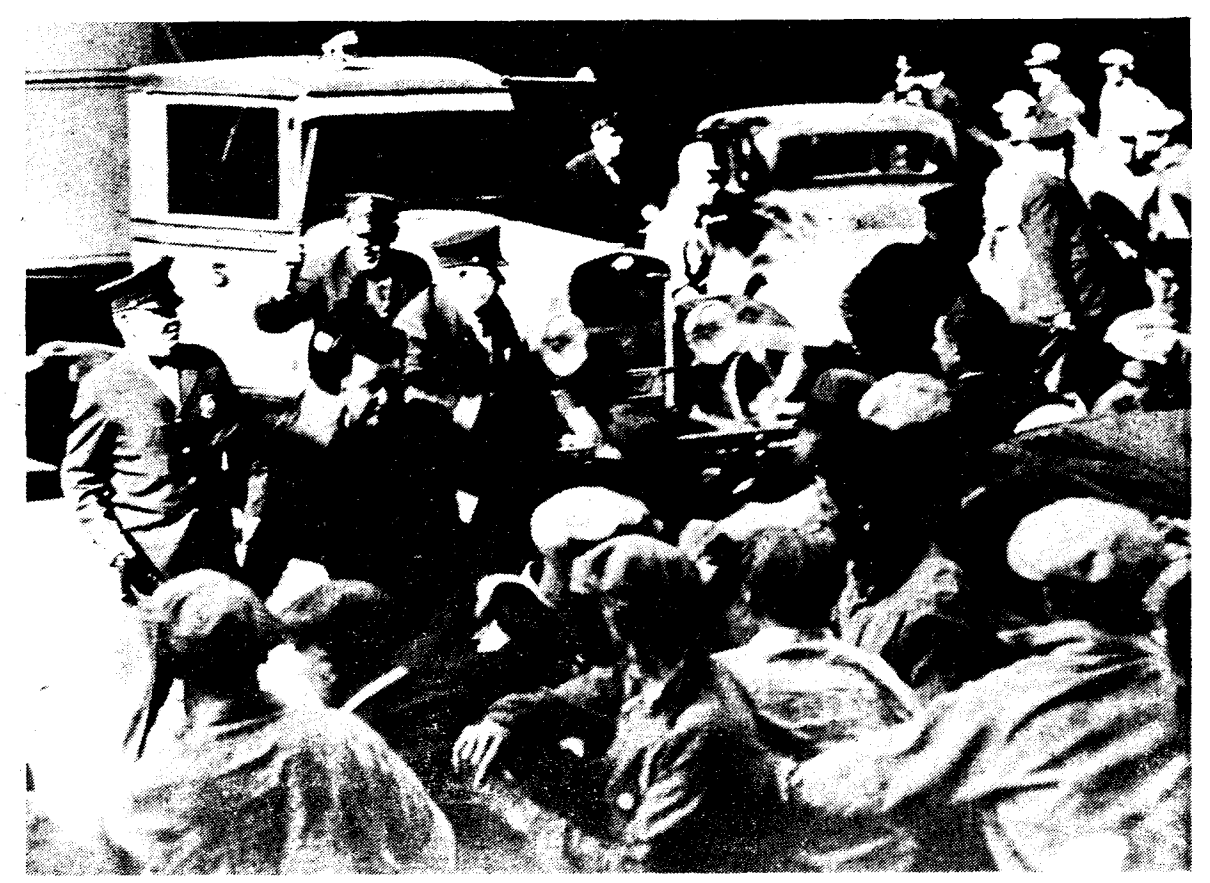
Trotskyists lead Minneapolis General Strike, 1934.

I left open the question of the outcome, of the character of the labor party in the third case. In the Bay Area somebody said, "Ah, but how can there be a revolutionary labor party? Obviously by definition it's reformist." And immediately there came to mind the examples of the transformations of the Italian and French mass Socialist parties into Communist parties and, more engagingly, because of the similarity in name and origins, the Russian Social Democratic Labor Party (Majority) is commonly taken to be a revolutionary labor party. But that depends on continued on page 8