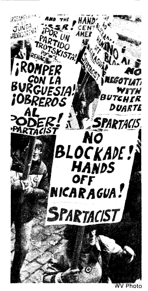
SL demands "Break with the bourgeoisie! Workers to power!"

It is crystal clear that the threats against Nicaragua are aimed at Cuba and the Soviet Union, falsely labeled the "source" of arms for Salvadoran leftist rebels. Reagan/Haig are trying to bring down the petty-bourgeois Sandinista regime installed after the overthrow of the hated U.S.-backed Somoza dictatorship. In the latest episode of this campaign of "destabilization" by starvation, Washington just this month canceled a $30 million loan from the Inter-American Development Bank. The problem for Yankee imperialism is that the more it tries to "punish" the Sandinistas, the more they are forced to seek help from Cuba and the Soviet Union. Thus, with El Salvador in flames and Nicaragua under the Pentagon's guns, Central continued on page 11