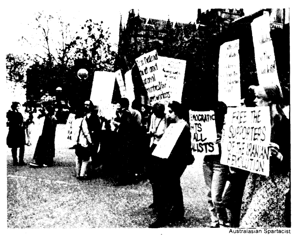
Australian SWP and SL/ANZ contingents before the SWP abandoned the HKS comrades' defense and went home.

"We're Going to Arrest You All" Ahwaz had been har assed and brutal-