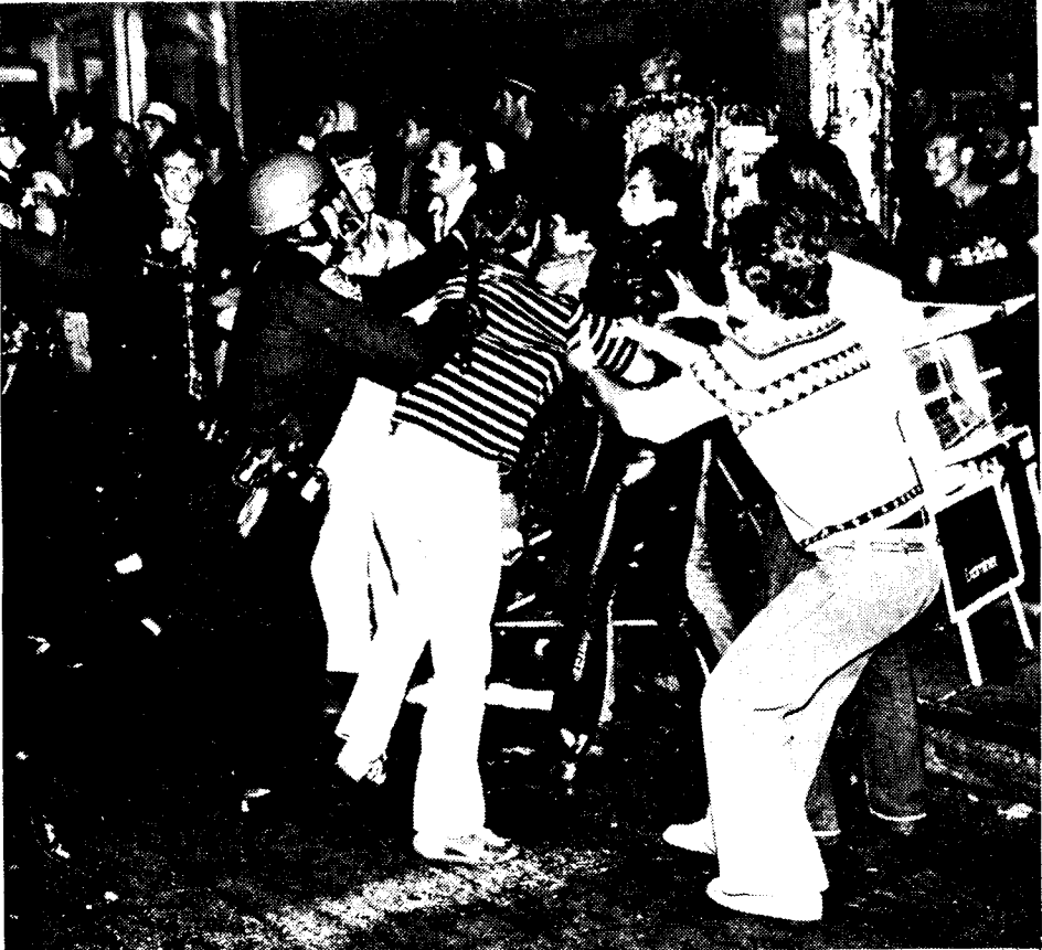
Riot cops invaded Castro Street in brutal revenge for City Hall "defeat."

Thursday, June 28, 7:30 p.m. New York University, Meyer Hall of Physics, Room 102 4 Washington Place (two blocks east of Washington Square Park, between Broadway and Mercer) NEW YORK CITY