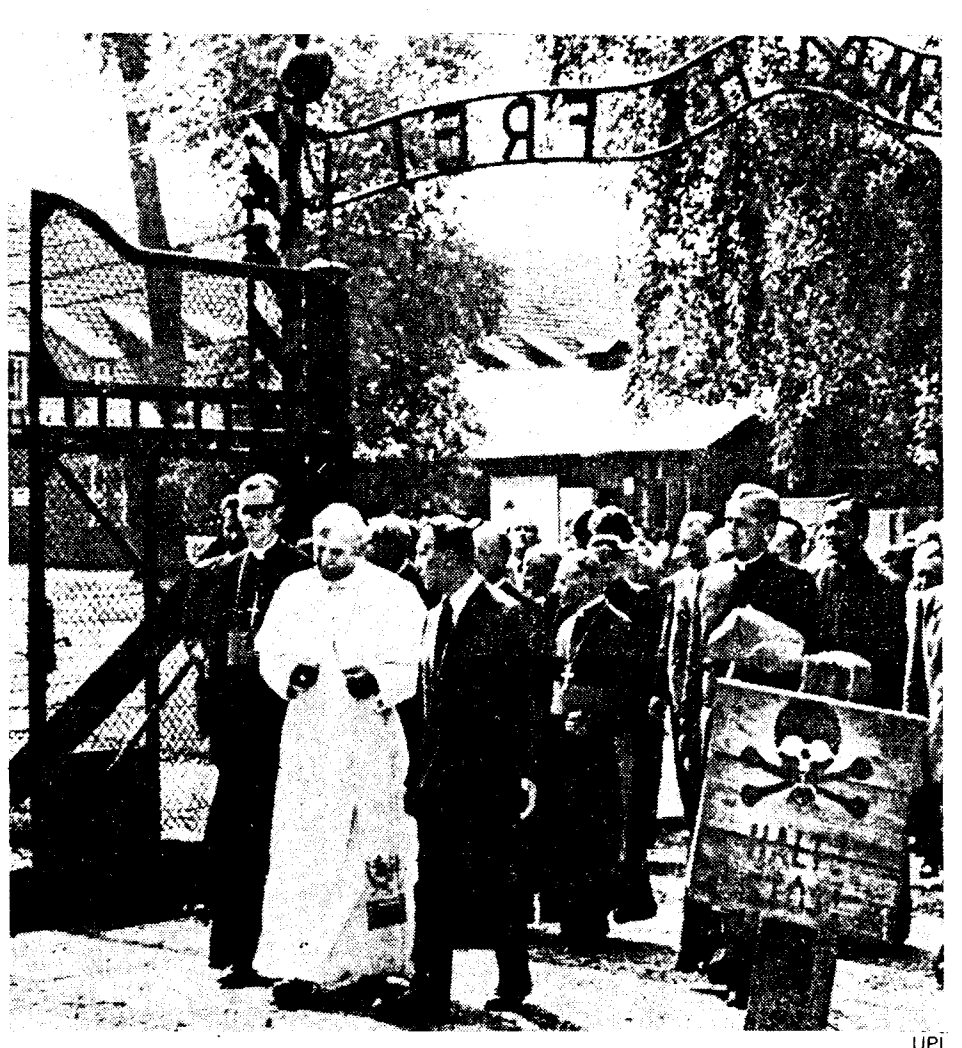
Pope's Auschwitz visit can't hide Holy See's silence as four million were slaughtered!

pope's aggressive anti-Communist challenge comes at the "precise moment" that Western imperialism has stepped up its ideological offensive against the Stalinist regimes of Eastern Europe, the expression of its counterrevolutionary appetite to reconquer the Soviet bloc for capitalist exploitation. As we pointed out when Cardinal Wojtyla was elected pope, "Jimmy Carter may figure he has a pope in his pocket, which can only increase the intensity of his bellicose anti-Soviet 'human rights' crusade" ("The President's Pope?" WV No. 217, 20 October 1978). For the Polish Stalinist regime the visit was highly embarrassing, sharply contrasting the spontaneous enthusiasm shown the pope with the sullen hostility and cynicism of large sections of the Polish people toward the bureaucracy. Party secretary Edward Gierek's nervous attempt to claim the