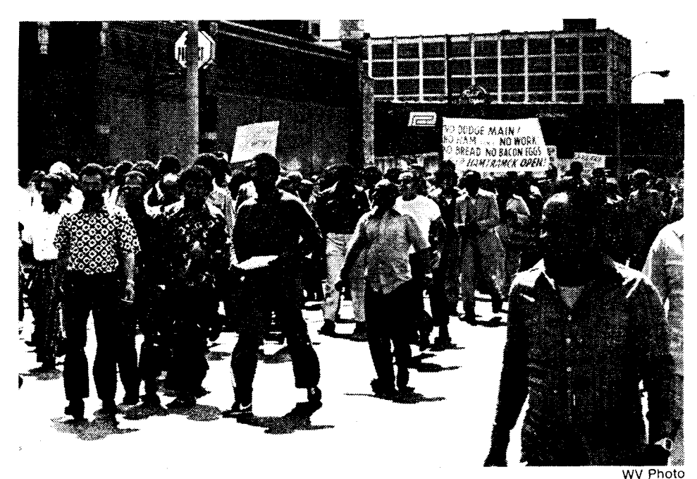
Hamtramck workers rally: "Save Dodge Main!"

One half the entire 7,000-man work force at Dodge Truck is scheduled to be first under the ax as Chrysler plans to shut down the second shift indefinitely at the end of June. And if the company has its way, in early July another 1,000 workers at Hamtramck Assembly will walk out of the antiquated eight-story factory for the last time. The remaining 4.000 workers there will be fired a year later when the plant is scrapped. The impact of the massive layoffs on Detroit will be devastating at Chrysler, the city's largest employer, and with auto/truck sales plummeting GM and Ford workers are already wondering "who's next?"