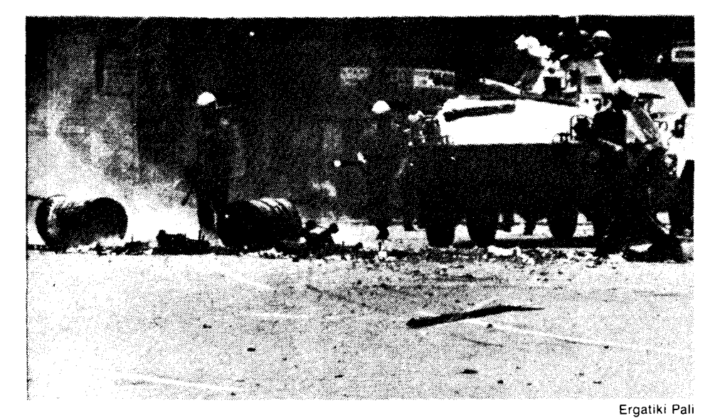
Riot police with armored car at barricade set up by striking workers in Athens May 25.