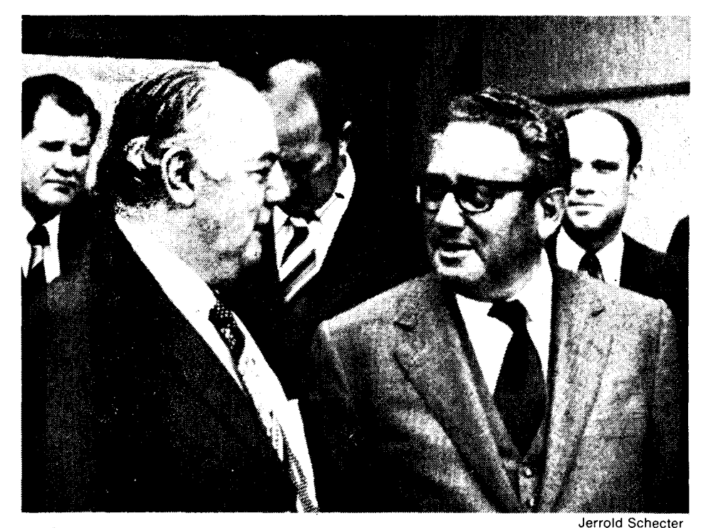
Vorster and Kissinger at Zurich summit.