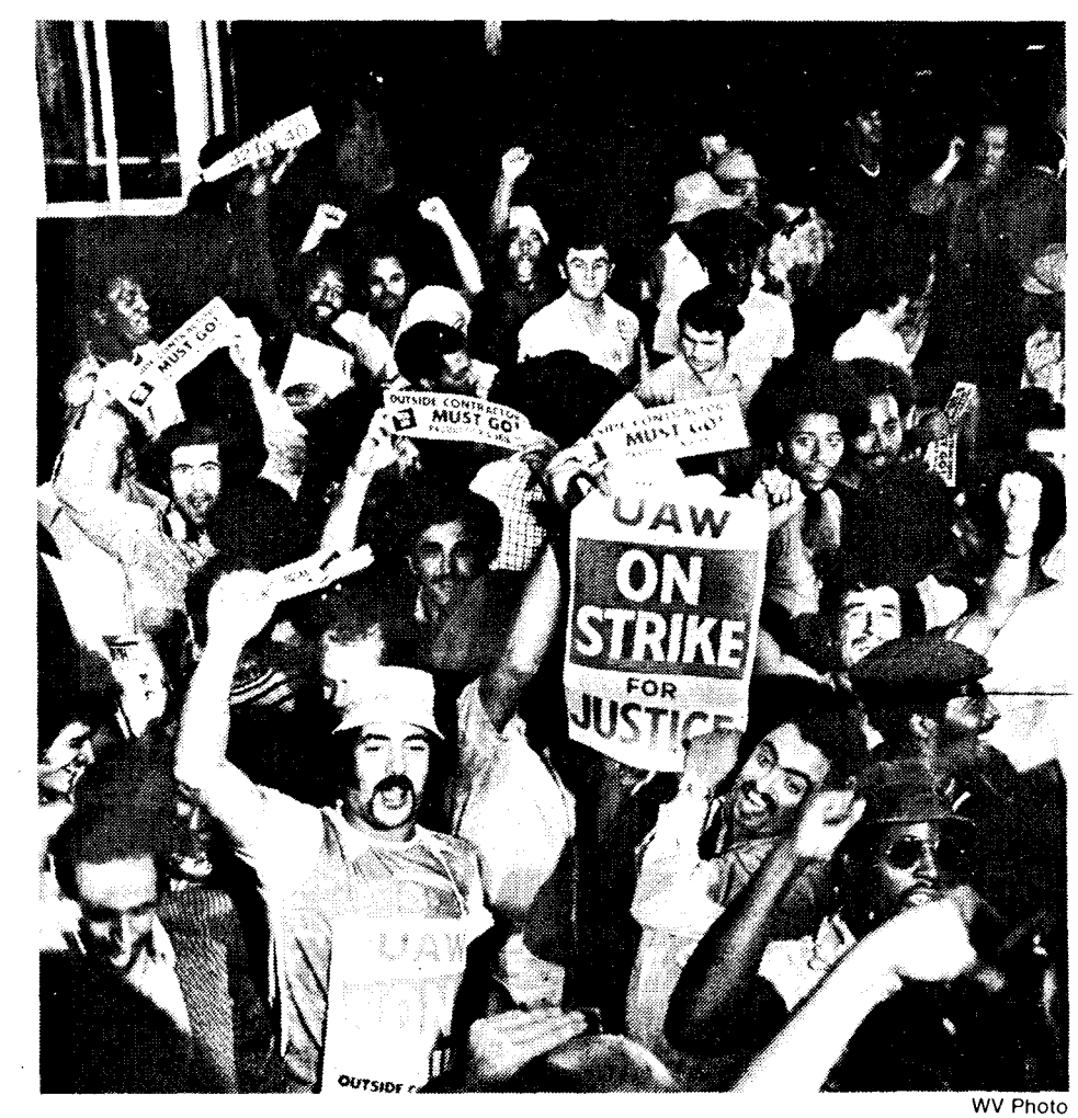
Autoworkers at Ford's Rouge walking out at midnight September 14.

A union committeeman reported that workers behind the lines are being pushed to the limit by management. When one worker protested about harassment, the foreman told him, "You haven't got any union representation, you're on strike." One striking skilled tradesman complained, "You just can't have people crossing the picket lines and call it a serious strike." The only way to win, he said, "is to actually lock the place up tight."