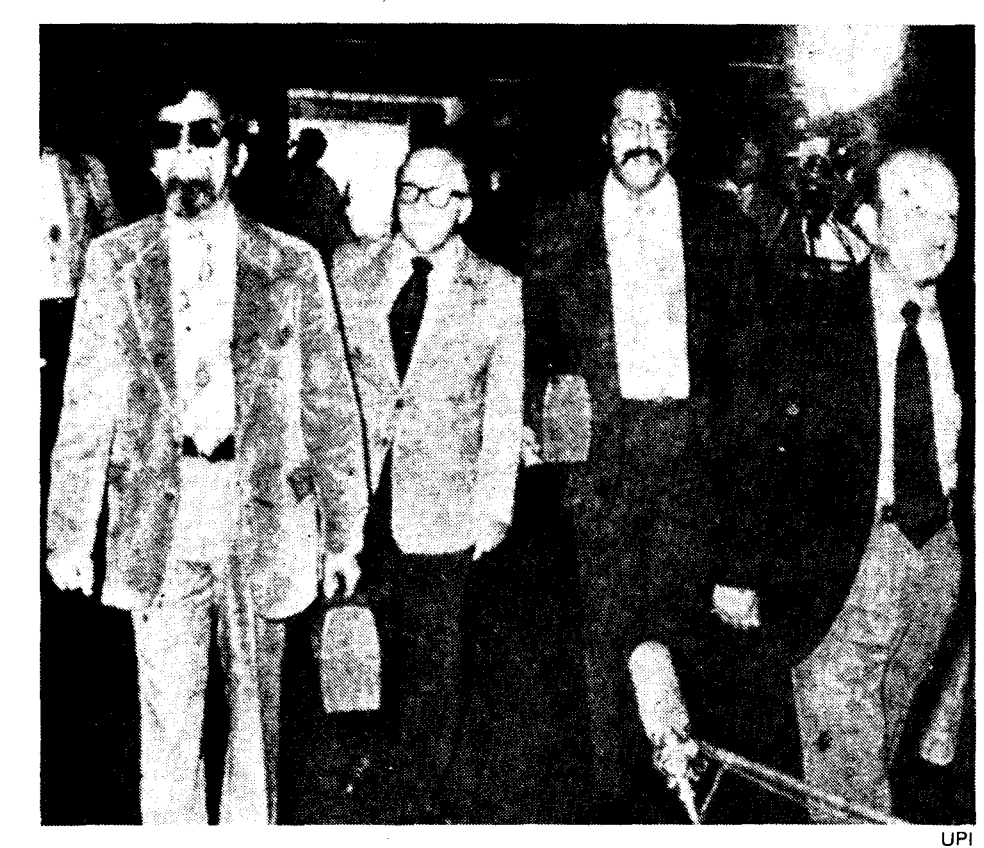
Four newsmen jailed for two weeks in Fresno for refusing to reveal source of grand jury leak were released September 17.

In the ensuing wave of support for Schorr in the liberal press, it is fortunate