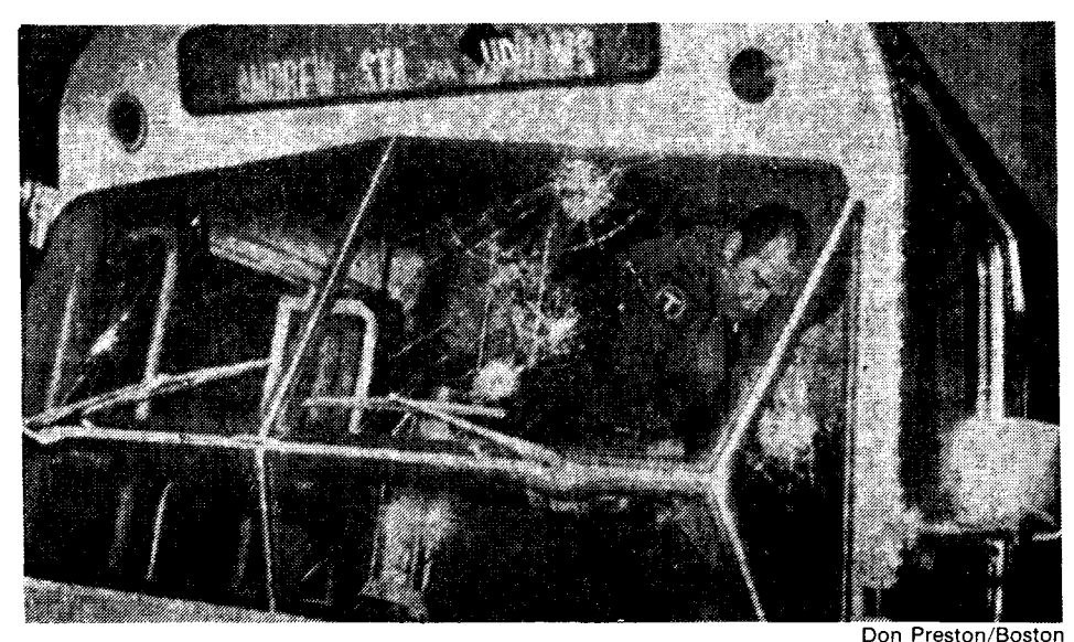
Black driver's bus demolished by racist attack in South Boston.

Despite liberal compromising on the busing plan, Boston remains a powder keg threatening to explode at any moment in a new wave of terror attacks on black people. On September 7, a 150car anti-busing motorcade wound through the streets of South Boston. At Andrew Square, the racists encountered an empty MBTA bus with a black driver. A barrage of bricks, rocks and bottles damaged the vehicle so badly that it had to be abandoned, and the driver and a policeman who came to his aid were hospitalized with injuries inflicted by the screaming mob. Although the racist mobilization has not scuttled the (watered-down) busing plan, it has succeeded in significantly increasing residential segregation in Boston through violent assaults on black and Latin families living in predominantly white neighborhoods. In 1973, 55 Puerto Rican families were stoned and firebombed out of the D Street housing project in South Boston. During the height of lynch mob frenzy in the fall of 1974, the remaining nonwhites were evacuated from other public housing projects in the Irish enclaves of "Southie" and Charlestown. The same pattern was repeated in East Boston during the past year. After prolonged and determined resistance to white gang