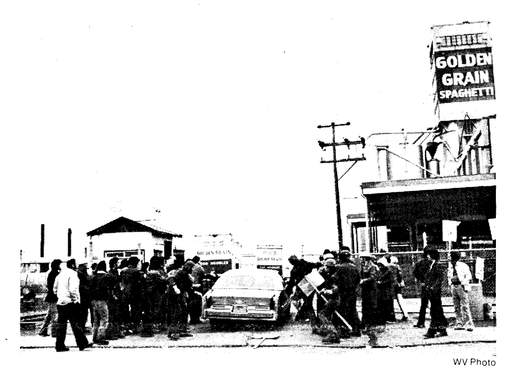
Golden Grain plant manager crashing through ILWU picket line at 20 mph in his Cadillac, almost running down a striker.

Also last week 40 state Highway Patrol and local police in Hayward smashed through a line of 50 pickets