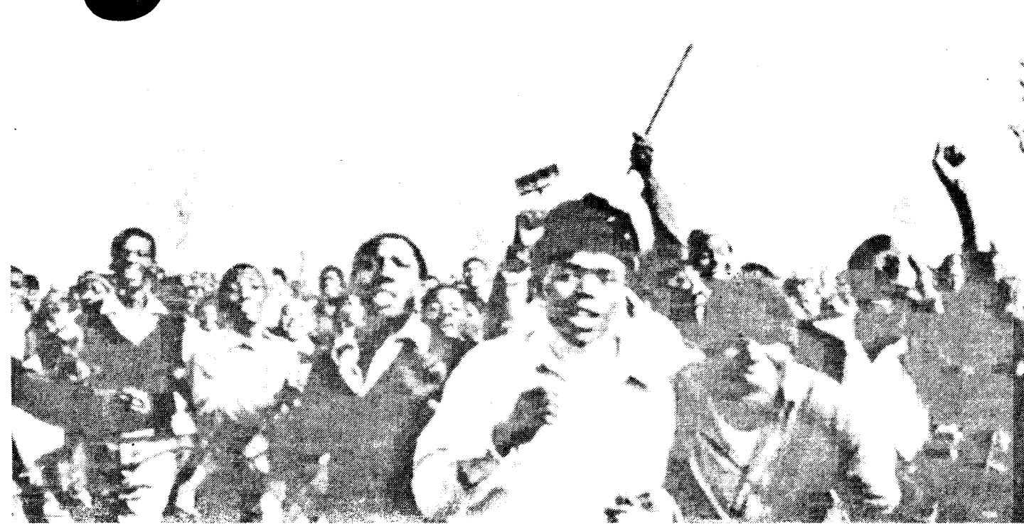
South African students protesting minority rule were brutally attacked by police in Soweto last week.

While the official body count of slain blacks in the Witwatersrand climbs over 109 dead and 1,100 wounded (the actual figures are far higher), Kissinger will have to strain even harder to overcome the pariah image of the Pretoria regime. As indicated by his junket to Santiago last month, the top foreign policy maker's expressions of concern for human rights are nothing but balm for bourgeois consciences, rhetorical perfume sprinkled over the moldering corpses heaped up by American imperialism's staunchest allies.