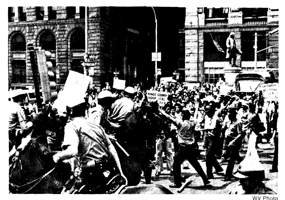
NYC hospital workers demonstrating against threatened hospital closures last summer.

In addition to the struggles of hospital workers, contracts covering firefighters, sanitationmen and D.C. 37 city administration employees expire June 30. Only a class-struggle labor leadership determined to launch militant strikes