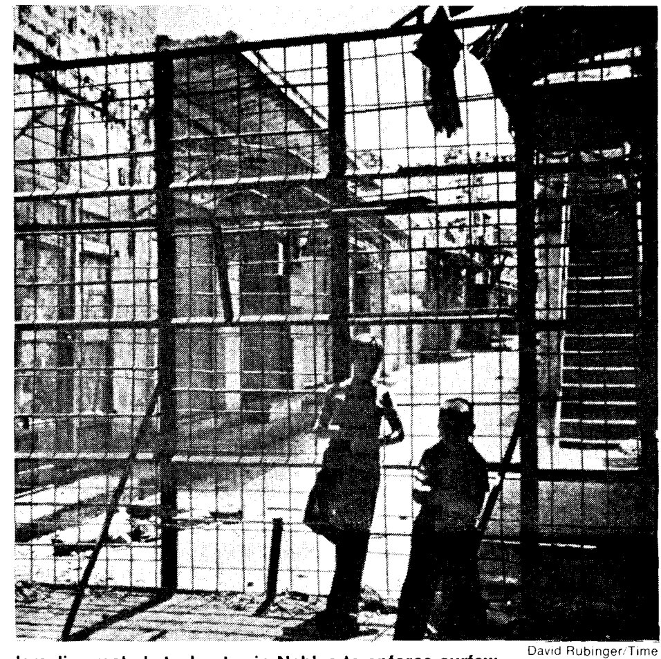
Israelis erected steel gates in Nablus to enforce curfew.

However Gush Emunim—supported by the "Labour" Party's governmental coalition partner, the National Religious Party (NRP) of orthodox rabbis and religious fanatics, and by the rightwing opposition bloc, Likud, led by Manachim Begin, perpetrator of the infamous Deir Yassin massacre wants settlements in Samaria precisely in order to thwart any possibility that