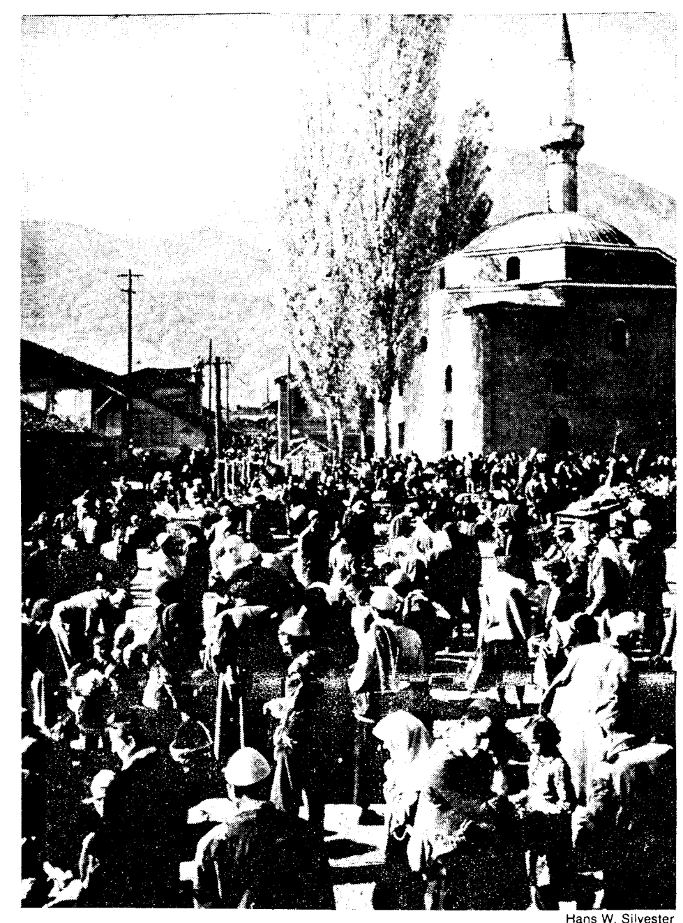
Market day in Péc, Kosovo-Metohija autonomous province, a predominantly Albanian area.

bureaucratic split with the Kremlin m 1948: