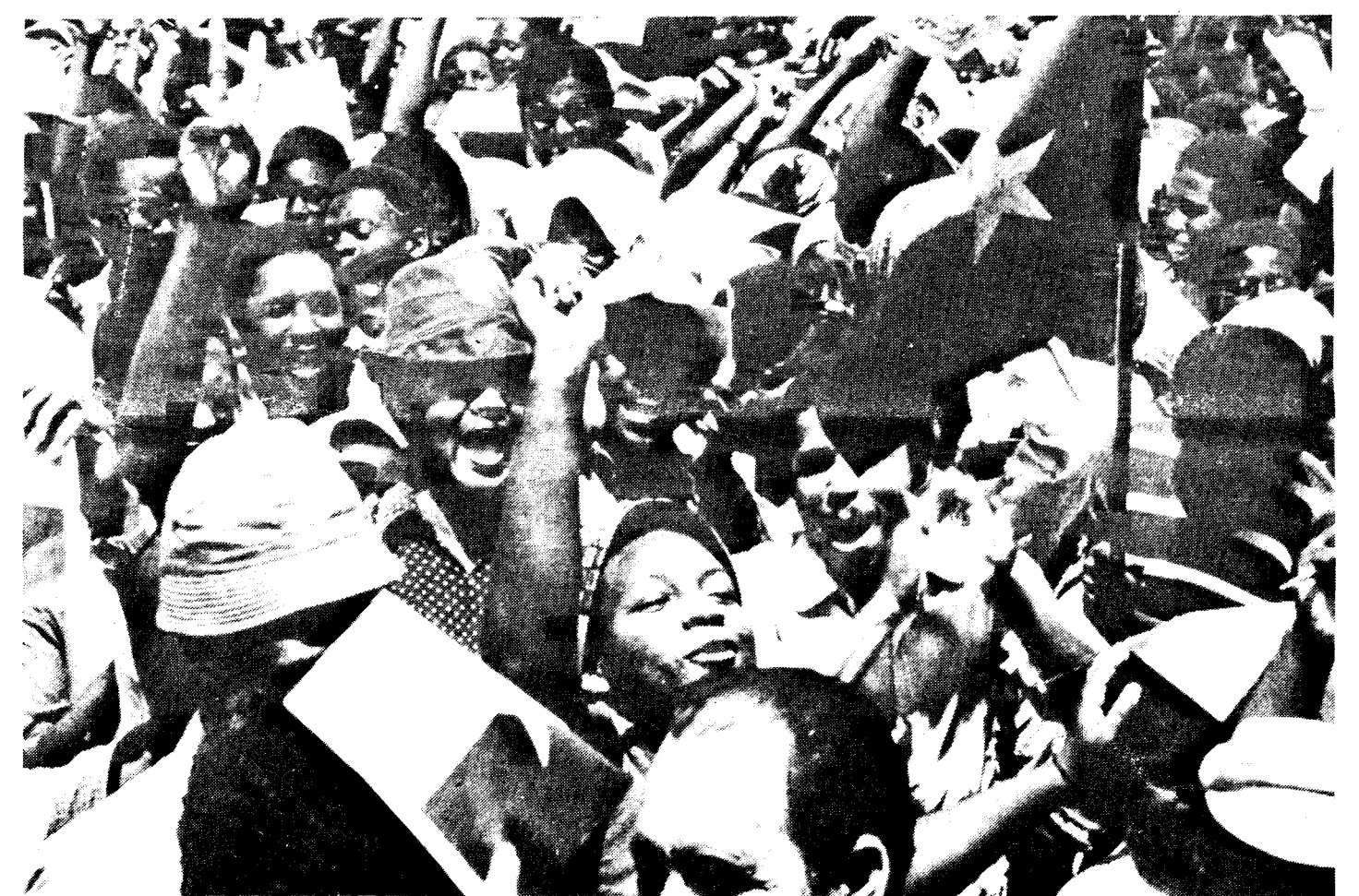
MPLA supporters demonstrate in the streets of Luanda.

The "precise class content" of the MPLA's occasional demagogic talk of "end[ing] exploitation of man by man" was graphically illustrated by its suppression of workers' strikes. Following the overthrow of the Caetano dictatorship in April 1974 and again as the