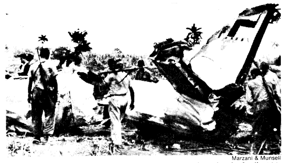
A CIA B-26 bomber shot down during Bay of Pigs invasion in April 1961. State Department claimed that Cuban air force pilots had rebelled. Kennedy called off second air strike after CIA cover story was blown.

The CIA was developed as the secret agency of an executive with ever more free-wheeling power to conduct secret wars. The construction of a political infrastructure loyal to the president alone was the basis for a tendency for structural bonapartism. Hence the desire for a sacred aura around the