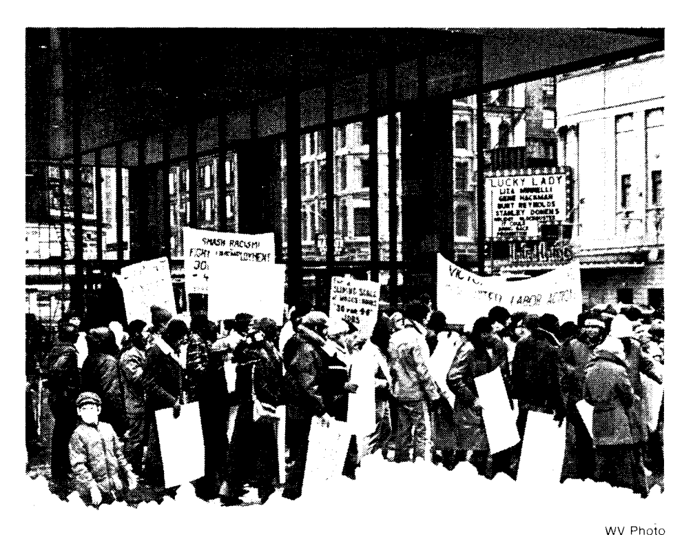
Rally at Chicago civic center January 10 in support of the Capitol Packaging strike.

refusal to meet what had become the pivotal and hardest-fought demand, a full six-months retroactive pay increase. Union members now face new reprisals, as the company has announced its intention to lay off the entire second shift for at least a month.