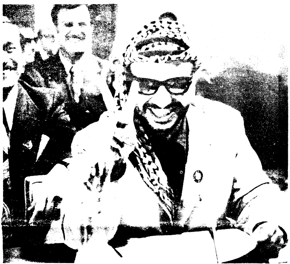
Yasir Arafat, chairman of Palestine Liberation Organization, at Rabat.

NOVEMBER 17—While the debate on Palestine was going on at the United Nations last week, preparations were proceeding for a new Near East war. Israel mobilized one third of its forces, denouncing heavy deliveries of Russian arms to Svria. At the same time, Rabin boasts of Israeli military superiority and hints at a first strike. Arafat of the Palestine Liberation Organization predicts war within six