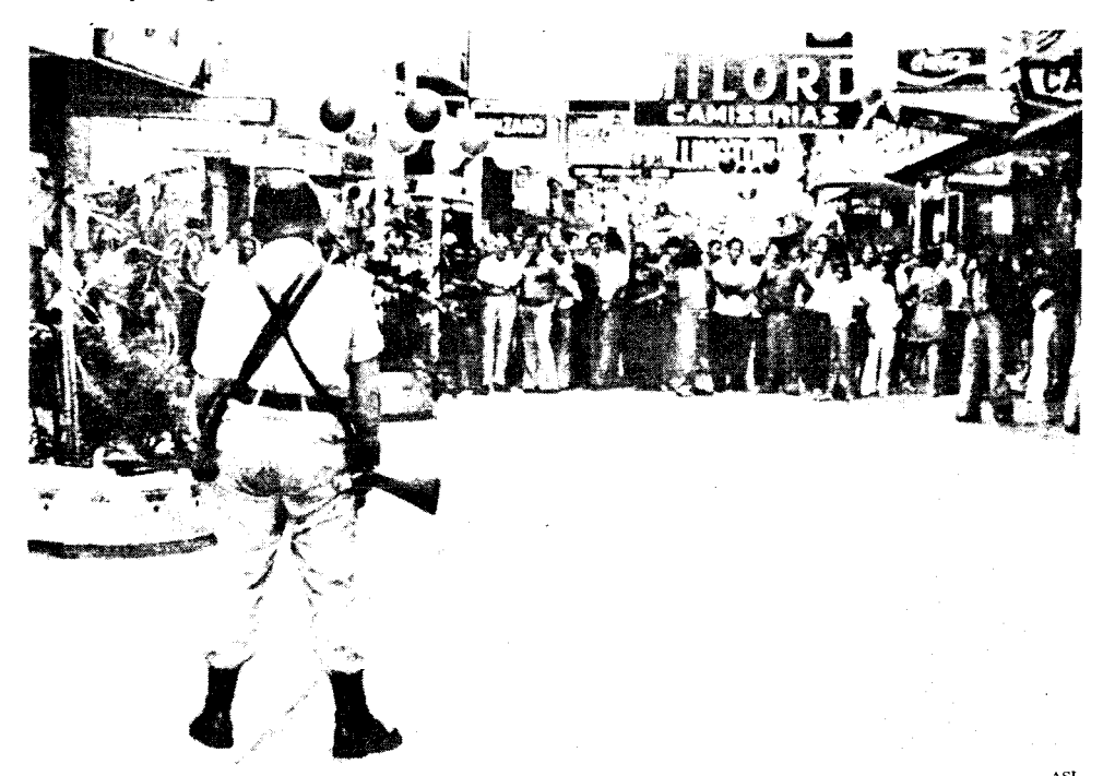
Córdoba during "police coup" in February.

The masses' will to fight the rightists was never in doubt. Despite numerous threats, beatings, machine-gun attacks and government refusals to recognize their choice, Córdoba auto workers refused to bow to the ganster-ridden UOM. In August a victorious strike brought them a large pay increase But the supposed "class-struggle" leaders refused to fight for any but strictly trade-union issues.