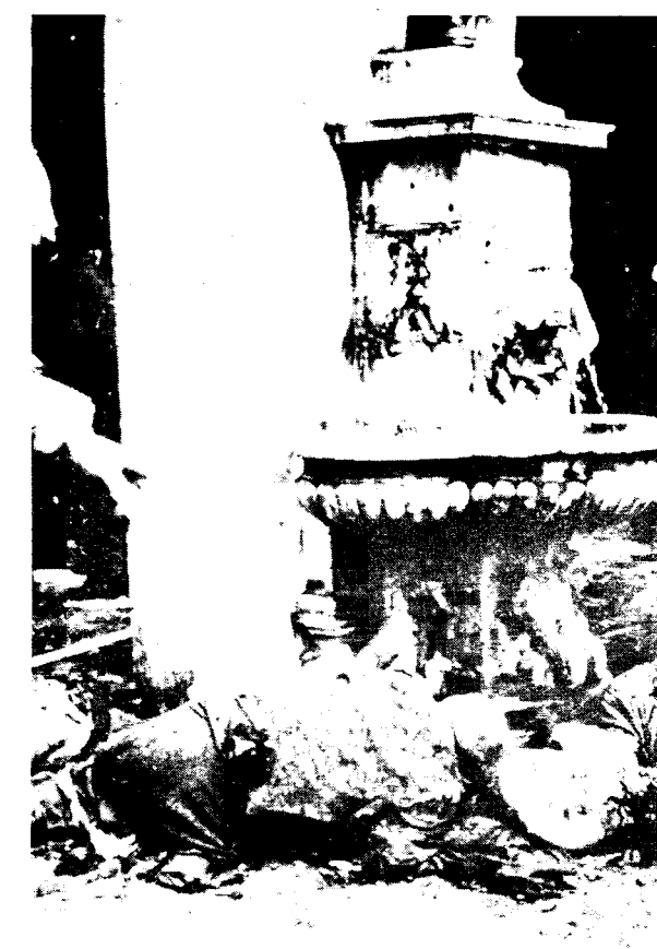
Brescia: Fascist bombs kill 8 in May.

In the past few years the Christian Democracy has become increasingly