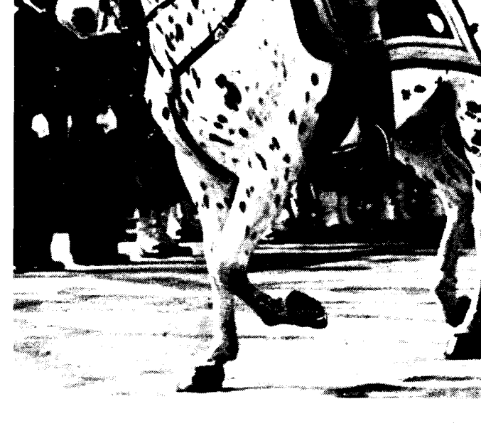
General Juan Domingo Perón

Under Isabelita the cabinet soon polarized into a moderate and hardline rightist wing, the former led by economics minister José Gelbard (a businessman and author of the wage freeze) and the latter by the sinister Rasputin-like José López Rega. Although nominally minister of social welfare, López Rega actually controlled the secret police. It is he who is undoubtedly responsible for the terror