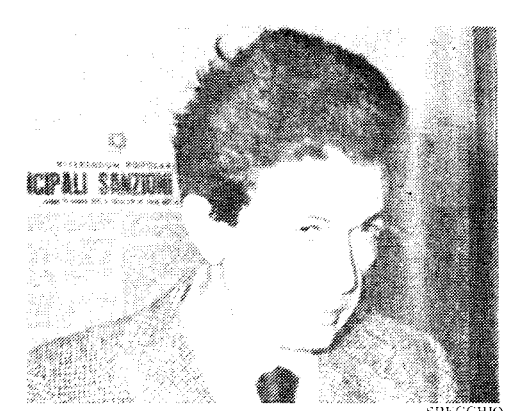
Italian CP head Enrico Berlinguer.

In the main the Italian working class still looks toward a parliamentary solution to its problems and felt needs. It is essential to destroy workers' illusions in the CP in the context of a concrete struggle against class collaborationism. Revolutionaries must constantly agitate against CP entry into the CD-led coalition and for the CP to take power together with the other