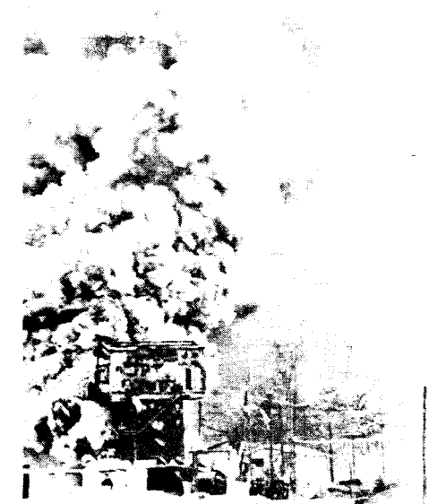
78 dead at 1968 mine explosion.

The fringes negotiated in most cases merely bring mine workers benefits