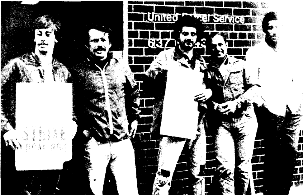
Teamsters Local 804 strikers have been abandoned by Fitzsimmons.

-For a class-struggle leadership of the IBT:■