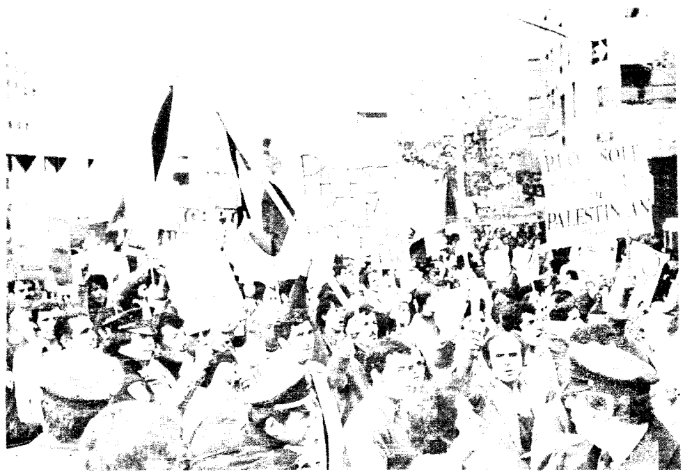
Pro-PLO demonstration in New York.

Only within the framework of a binational Palestinian workers republic, created by a united proletarian revolution of Hebrew and Arab workers against the clerical Zionist state and the bloody Hashemite throne, can an equitable solution of the counterposed national claims be reached.