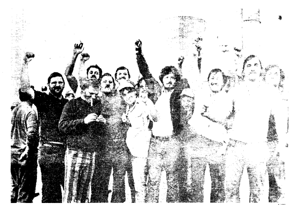
Pennsylvania UMW strikers block entrance to power plant.

which are standard in unionized industry. For the first time they would get paid sick days, although only five per year. The pension will rise to $250 a month by 1977 (it is $150 at present), a figure which is still sub-poverty lev-