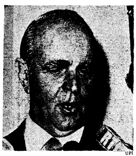
Greek Premier Constantine Caramanlis

The whole house of cards, which in any case was operative only on the condition that both Greece and Turkey ac-