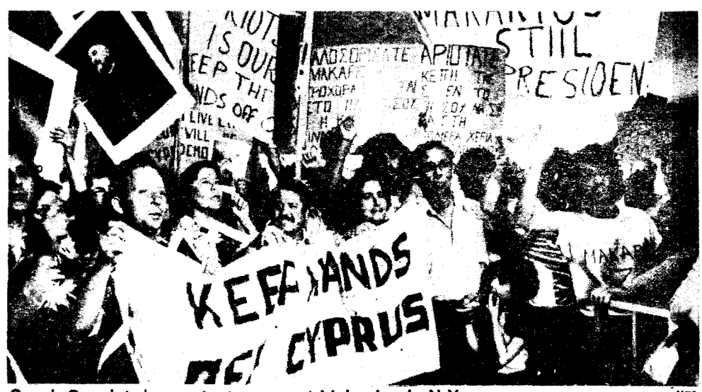
Greek Cypriot demonstrators greet Makarios in N.Y.