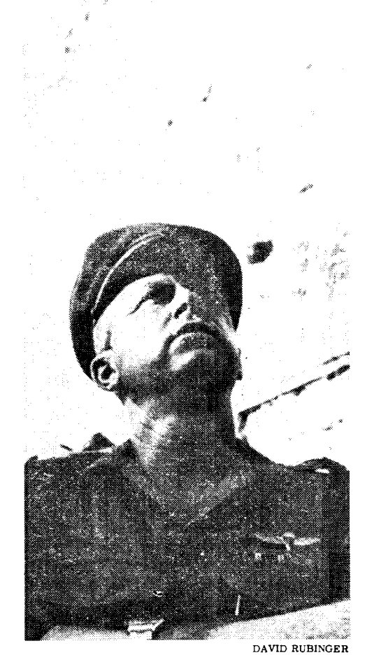
Israeli Premier Yitzhak Rabin

Defense League leader Meir] Kahane's slate received only 0.8 percent in the elections to be convinced that there is no fascist danger in Israel. What is more, if there were a fascist danger, no wing of Zionism could stop it, only the independent mobilization of the working class, only the workers militias could play this role.