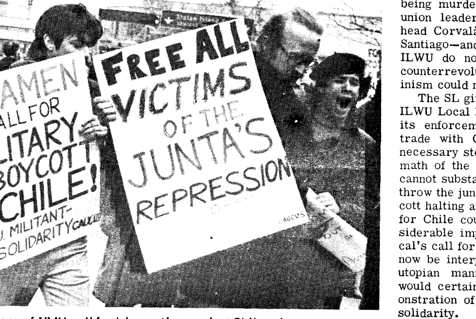
CWA's Militant Action Caucus and Militant-Solidarity Caucus of NMU call for labor action against Chilean junta.

The SL gives critical support to the ILWU Local 10 resolution and calls for its enforcement. A total embargo of trade with Chile was a correct and necessary step in the immediate aftermath of the coup. Today, however, it cannot substantially aid efforts to overthrow the junta. A more selective boycott halting all military supplies bound for Chile could be imposed with considerable impact. But even if the Local's call for a total trade boycott could now be interpreted in a moralistic or utopian manner, its implementation would certainly be an important demonstration of international proletarian