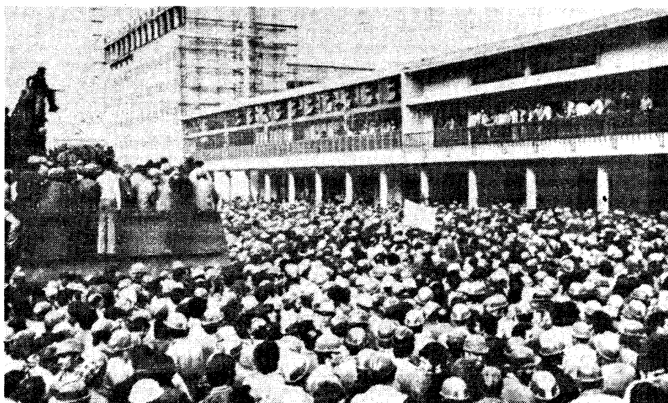
Top: Workers of Gonçalves auto factory demonstrate outside labor ministry. Sign in center reads: "Attention! Careful! Bosses Like Ours Foment Fascism." Bottom: Workers at Lisnave shipyard near Lisbon during plant occupation in May.

The Maoist MRPP, as well as most other groups to the left of the CP/SP, support these movements unconditionally. The supposed Trotskyists of the International Communist League (LCI a pro-Mandel sympathizing organization of the "United" Secretariat) claim to criticize them because "they have no real program" and "make only vague references to socialism." Yet this is certainly not evident at their public demonstrations where the LCI marches under the slogan, "Viva PAIGC, MPLA, FRELIMO." The only road to liberation for the colonial masses is through the building of a vanguard workers party which, leading the peasantry and in close coordination with the workers movement in South Africa and Portugal, carries out a socialist revolution. Communists must place no confidence in the petty-bourgeois nationalists who, what-