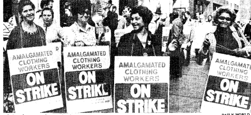
Picketing workers in N.Y. during recent ACWA nationwide strike.

The clothing workers have never had a cost-of-living escalator in their contracts. During the 1950's and early 1960's, small wage increases kept slightly ahead of inflation while leaving clothing workers at the bottom of the industrial working class. However, when the Vietnam war inflation began in 1967 real wages began to plummet. The 1971 contract, which continued this pattern, produced the first major crisis