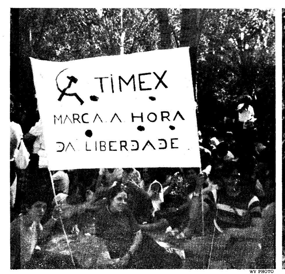
Sign says, "Timex Strikes the Hour of Freedom."

On June 1 the Intersindical-Communist controlled labor federationorganized a mass demonstration in Lisbon to repudiate strikes. The demonstration drew about 10,000 and, needless to say, PCP banners proclaiming "não a greve pela greve" ("No to Striking for the Sake of Striking") and "For