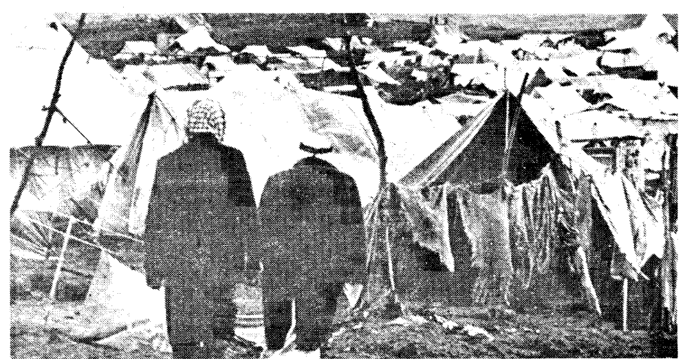
Palestinian refugee camp