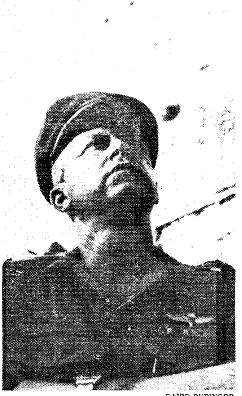
Israeli Premier Yitzhak Rabin

Defense League leader Meir] Kahane's slate received only 0.8 percent in the elections to be convinced that there is no fascist danger in Israel. What is more, if there were a fascist danger, no wing of Zionism could stop it, only the independent mobilization of the working class, only the workers militias could play this role.