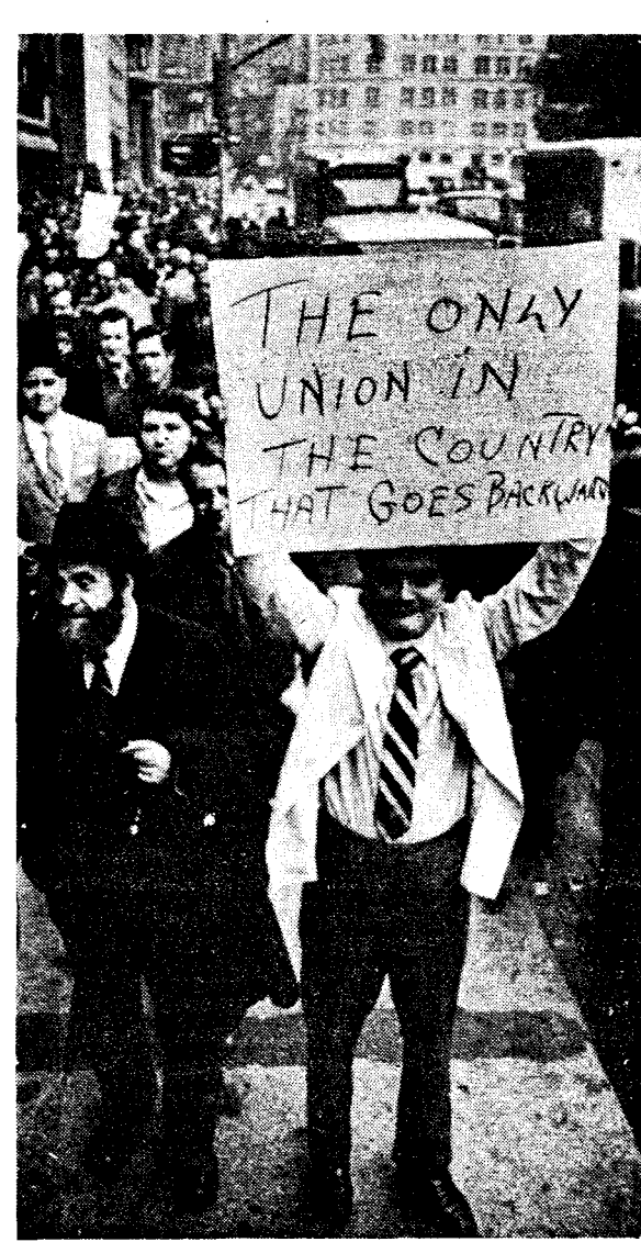
New York clothing workers picket Amalgamated headquarters in Union Square in 1971 to protest sellout contract.