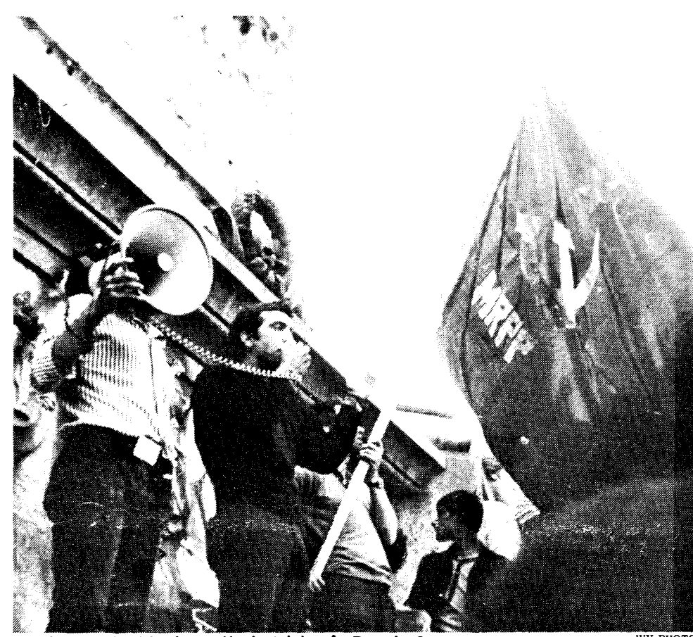
Speaker at the Maoist rally in Lisbon's Rossio Square.