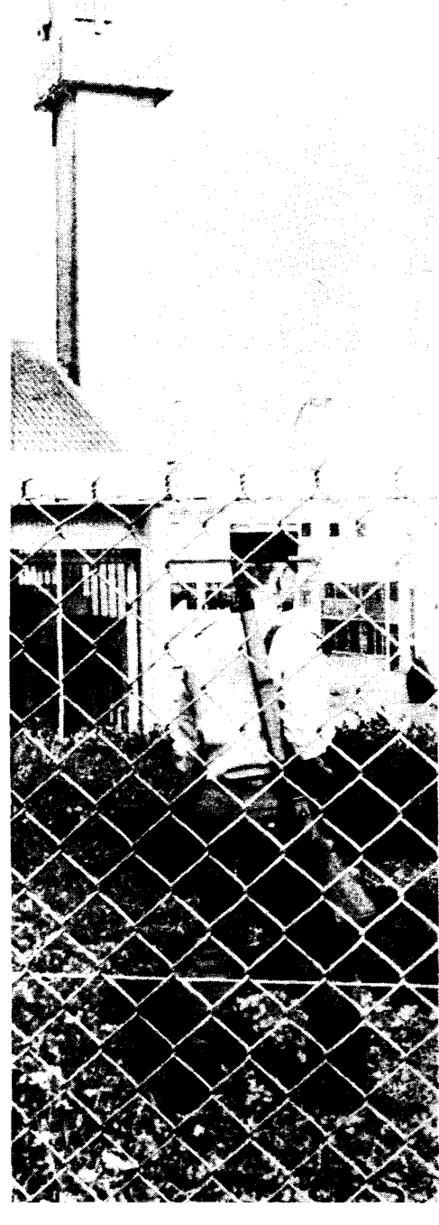
CRS riot police patrol Lip factory.

The loss of the factory was a real blow to the Lip workers. They lost their first line of defense and from this moment on they remained vulnerable before the avenging capitalists and union misleaders. This major defeat could