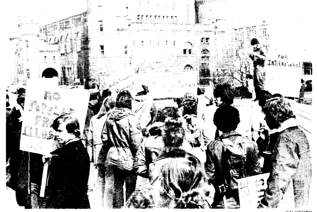
Madison rally to defend Chilean militants.

While speakers of the other groups confined themselves to tales of horror and calls for a "broad-based" campaign involving "all progressive people" in Australia to protest the junta's repression, the SLANZ speaker at the rally explained the importance of a class defense of the Chilean militants and the absolute necessity of assimilating the lessons of the failure of the UP coalition government.