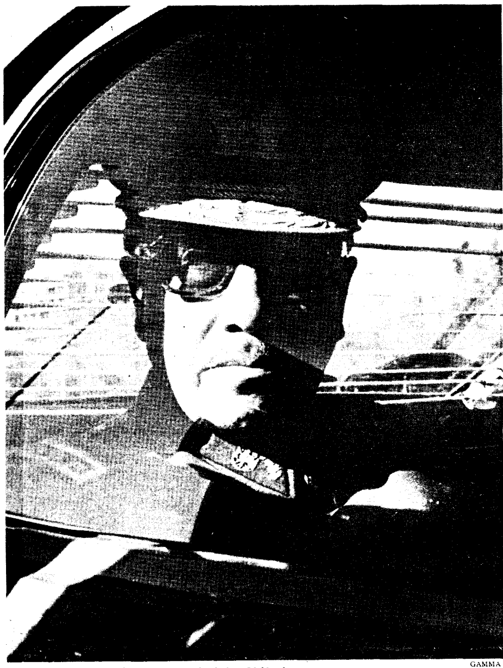
General Augusto Pinochet, head of the Chile junta.

The inflation in particular has brutally reduced the consumption of the working masses. The more than 300 percent annual rate of price increase during Allende's last months was a principal cause for petty-bourgeois discontent with the UP government. Now, however, the masses are faced with a rate which is double to triple