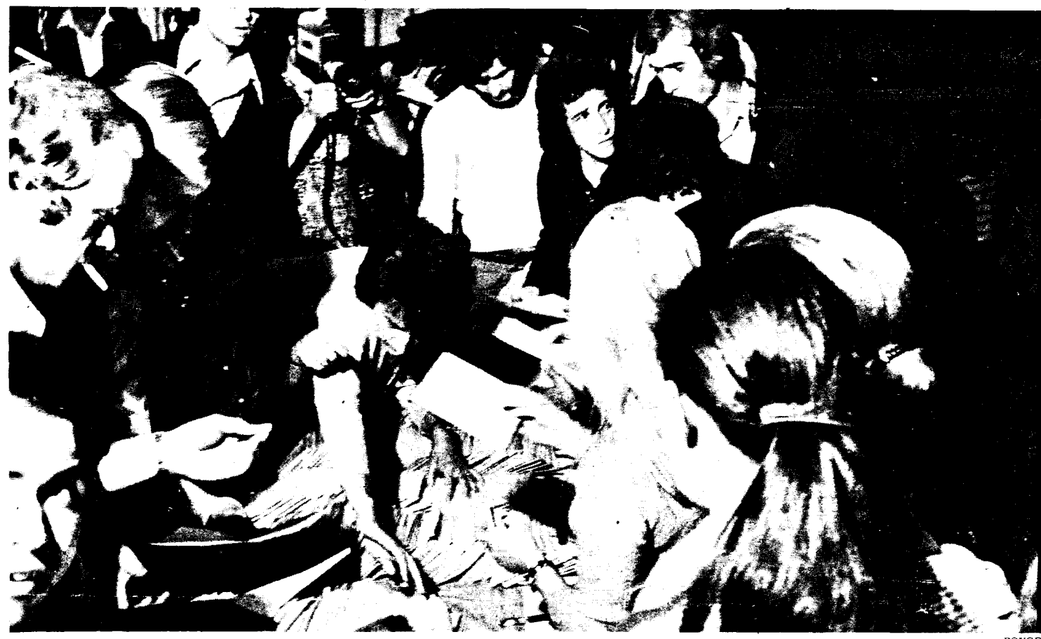
Pay distribution at Lip during factory occupation.

This limitation was demonstrated by the Lip workers' three demands: (1) no layoffs, (2) no subdivision and (3) no loss of benefits previously won. Reinforced by the reformist bureaucratic CFDT/CGT misleadership, these economic demands were never raised to the level of political struggle. This fact serves as an indictment less of the bureaucrats, from whom one must expect a narrowly reformist approach, than of the ostensibly revolutionary movement which failed to intervene with a revolutionary program.