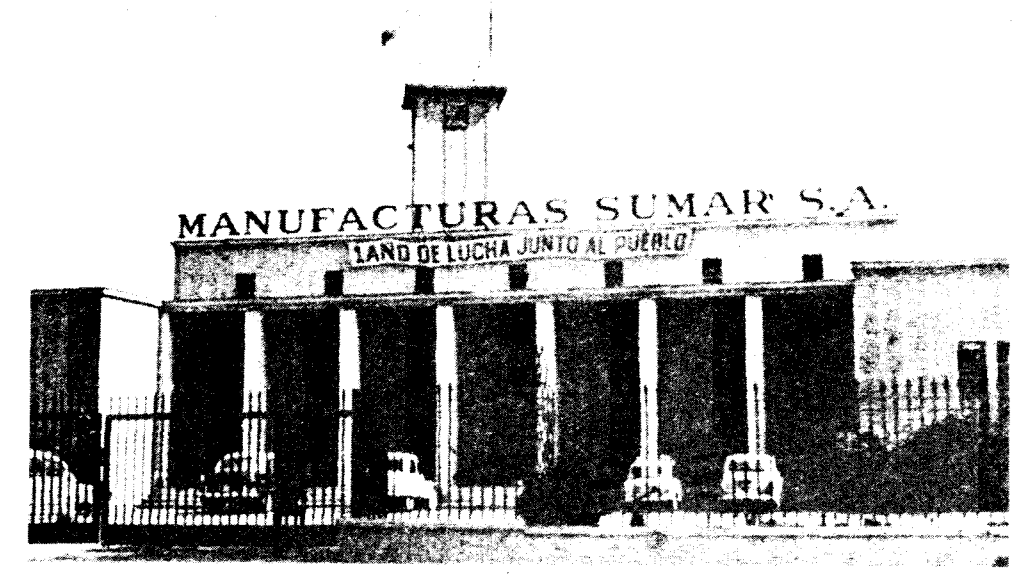
Sumar textile factory in Santiago, scene of sharp fighting during the coup.

tematic "pacification" operation, murdering all peasant union leaders and often their families as well. The military succeeded in capturing and executing the top MIR leader in the region, "Comandante Pepe" (José Gregorio Liendo) soon after the coup but has been unable to completely crush the peasants' movement. One union leader recently reported that a clandestine congress representing 300,000 organized agricultural workers had been held in the Mapuche region (Daily World, 2 April). On the other hand, a top MIR leader (Bautista Van Schouwen) was captured by the government in mid-December which, like the loss of Liendo, is certainly a serious blow.