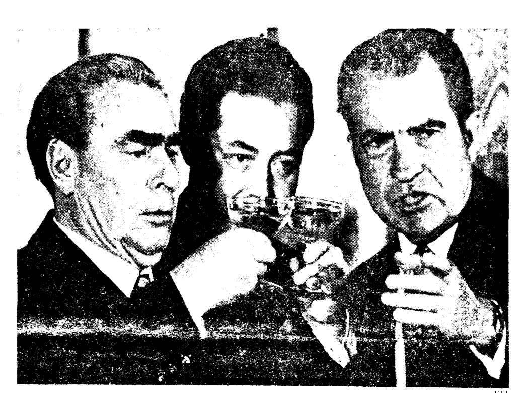
Brezhnev and Nixon in Washington, June 1973.

In effect, Nixon's latest proposals amount to tearing up another scrap of paper that was supposed to be a historic monument to détente and peaceful coexistence, the 1972 Strategic Arms Limitation Treaty (SALT I). SALT I was an agreement between the U.S. and the USSR to set a fiveyear limit on the number of offensive missiles each side could have. The U.S. was to have a ceiling of 1,054 land-based intercontinental ballistic missiles (ICBMs) and 44 missilelaunching submarines with 710 submarine-launched ballistic missiles (SLBMs). The USSR was to have 1,618