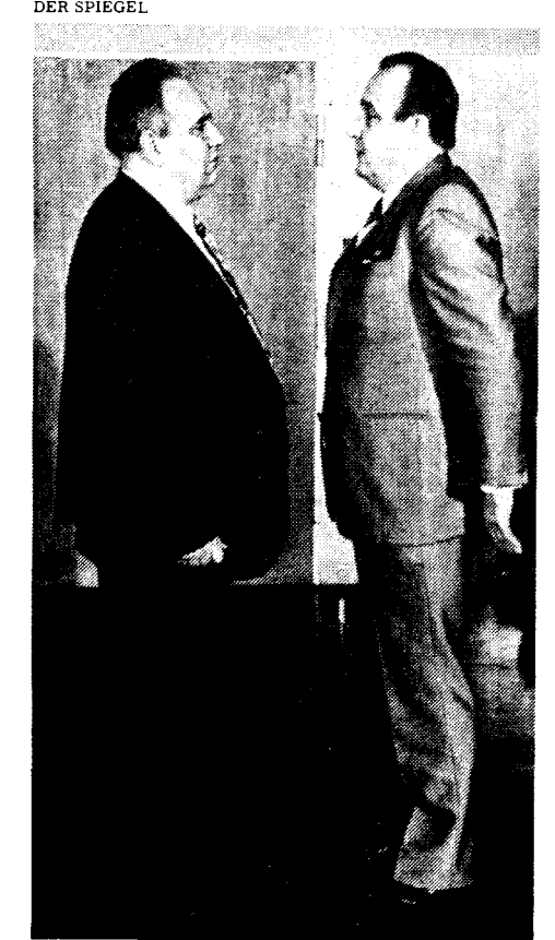
ÖTV's Kluncker (left) and SPD Interior Minister Genscher,

strike. The strike stopped garbage collection from the first day, crippled the postal service on the second and led to shutdowns of power in some areas. However the leadership limited the walkout to only 250,000 workers (one seventh of the total) at the high point and refused to call out workers in so-called "vital services"-hospitals, power stations (in most areas), railroads, etc. Then on the third day the union tops agreed to a "realistic" 11 percent wage increase (with 170 DM minimum) and fringe benefits raising the total package to around 13 percent. To ensure the absence of effective opposition, the contract vote was postponed to more than a week after everyone had gone back to work.