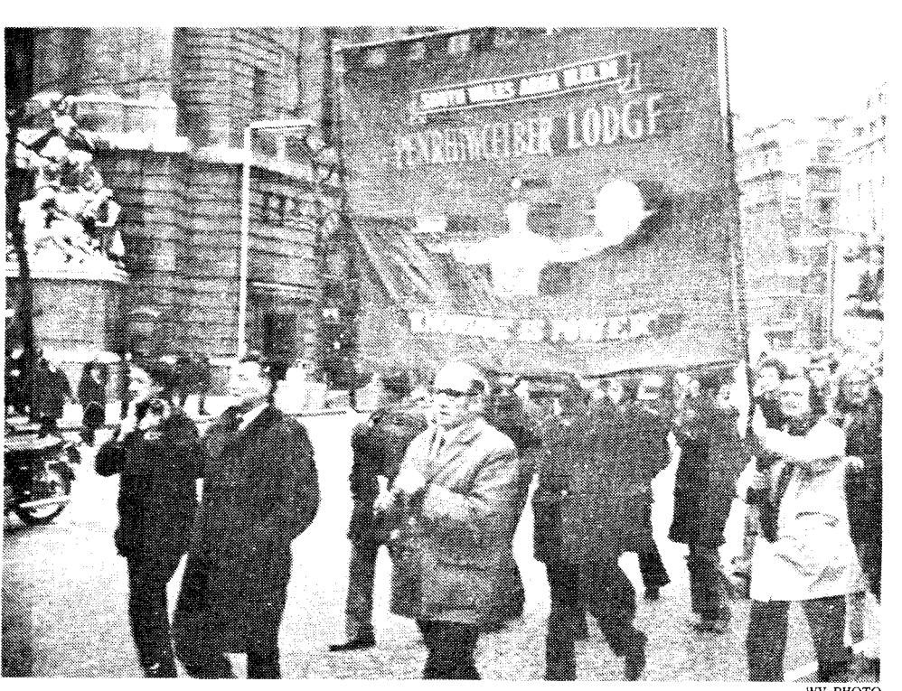
Welsh miners march in Cardiff.

One significant aspect of the elections was the backing off from Heath's hard-line policies toward the miners by significant sections of the British ruling class. The first important breakthrough came on February 21 with the Pay Board's "sudden discovery" that the figures used to weigh the relative wages of the miners were inaccurate and that they were in fact