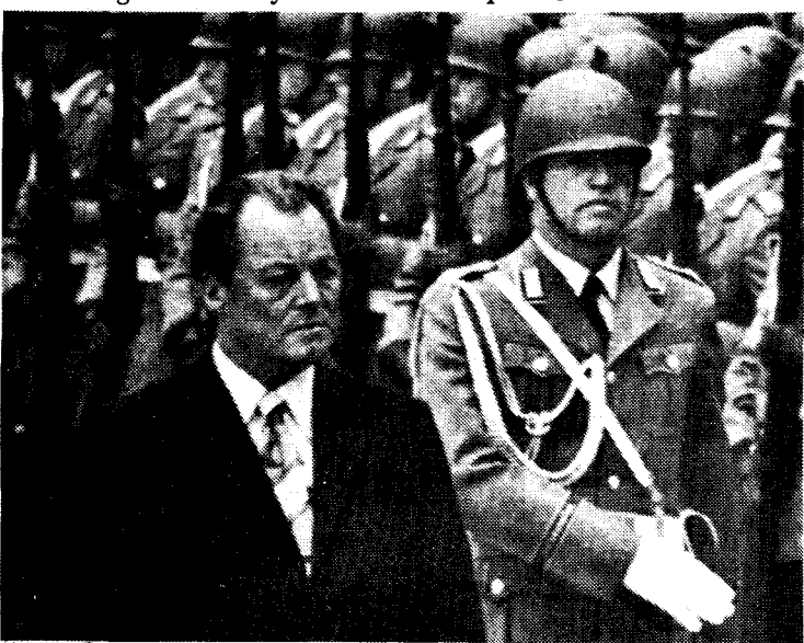
West German Chancellor Willy Brandt

The Brandt government was careful to aid the Social Democratic union bureaucracy by appearing to give way only gradually, one-half percentaday, thereby enabling Kluncker to reject several offers so the ranks could blow off steam in a carefully controlled