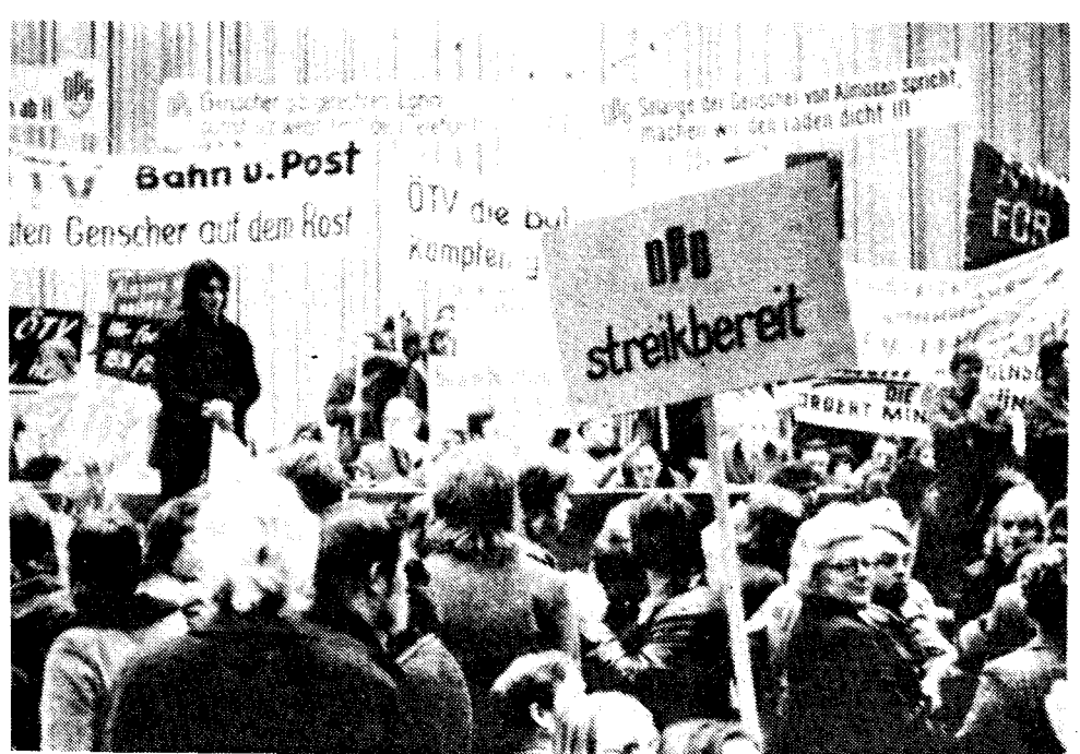
Government workers' demonstration in Dortmund.

Like any major strike in this period, this one clearly raised the need for a transitional program which goes beyond the limits of what capitalism can "afford." In the context of rising unemployment and Brandt's threat that "two-figure settlements would increase the danger of a corresponding development of prices" (Berliner Tagesspiegel, 13 February), the task