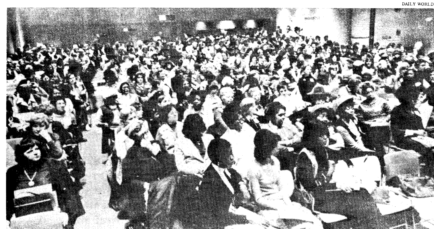
January 19 New York Trade Union Women's Conference.