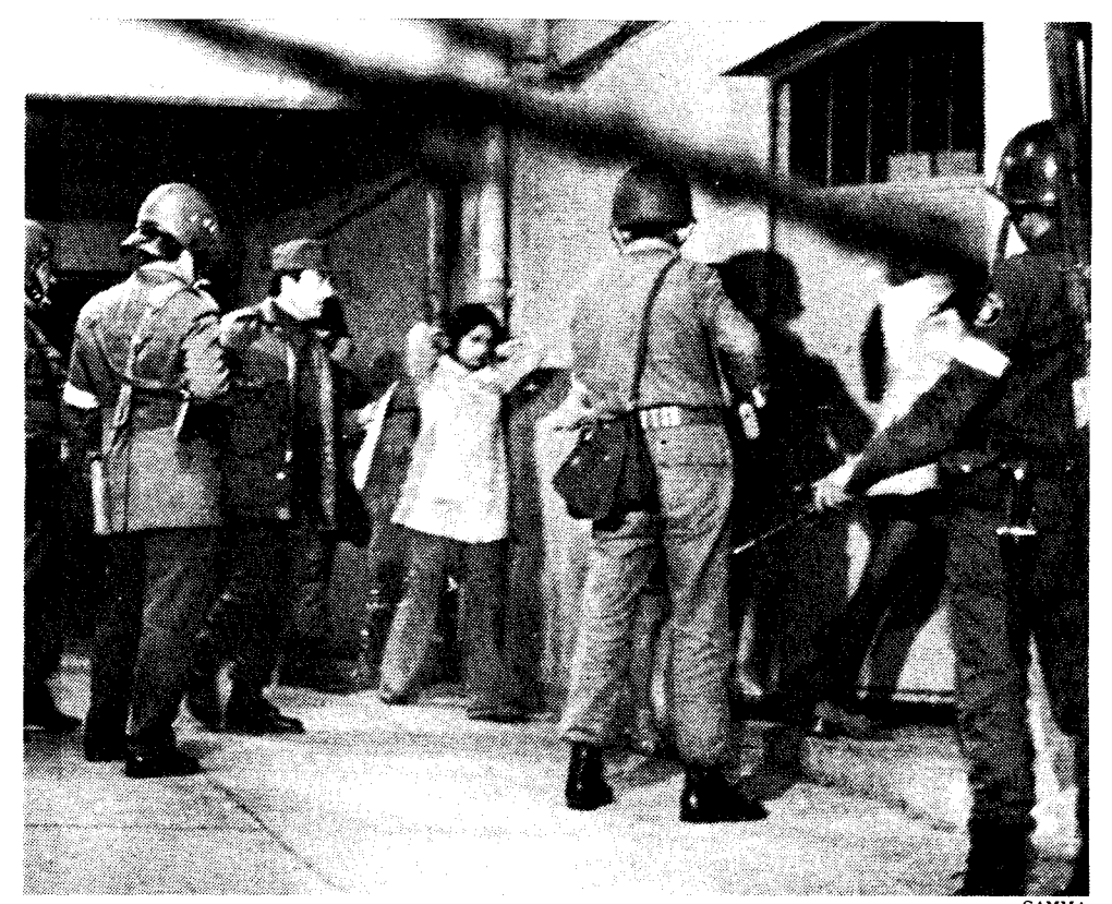
Inside the National Stadium following military coup last September.

At the same time there are now rumors of a deal being worked out to free a few prominent supporters of the Allende government through the intermediary of the United Nations. A New York Times dispatch (2 March) reports that the UN Commission on Human Rights had called on the junta to release five leading leftist prisoners, including Communist Party head Luis Corvalán. "A tacit understanding of the parties [Chile and the USSR] to the deal was that Chile would allow the imprisoned men to leave," the paper reported. We must vigorously demand the immediate release of all the political prisoners who are victims of the reactionary junta's repression, including Corvalán or even "constitutionalist" officers. However, such a special deal would put the lives of farleft militants such as Romero and Van Schouwen in immediate danger.