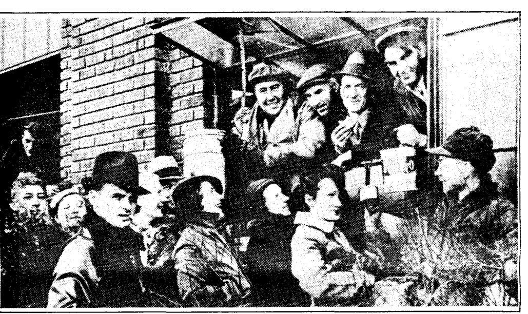
Wives of sit-down strikers talk with their husbands at Fisher Body No. 1, 1937: Reuther's job was to tame militancy which built UAW.