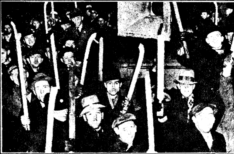
Supporters of sit-down strikers arrive from other auto and steel plants, 1937.

overturn the wishes of the working majority, as happened in a recent Local 600 election). Thus the UNC's more radical and class-conscious paper positions were revealed as empty rhetoric to be dropped at the first opportunity in favor of a power bloc around abstract "democracy" — the <u>real</u> program of the UNC.