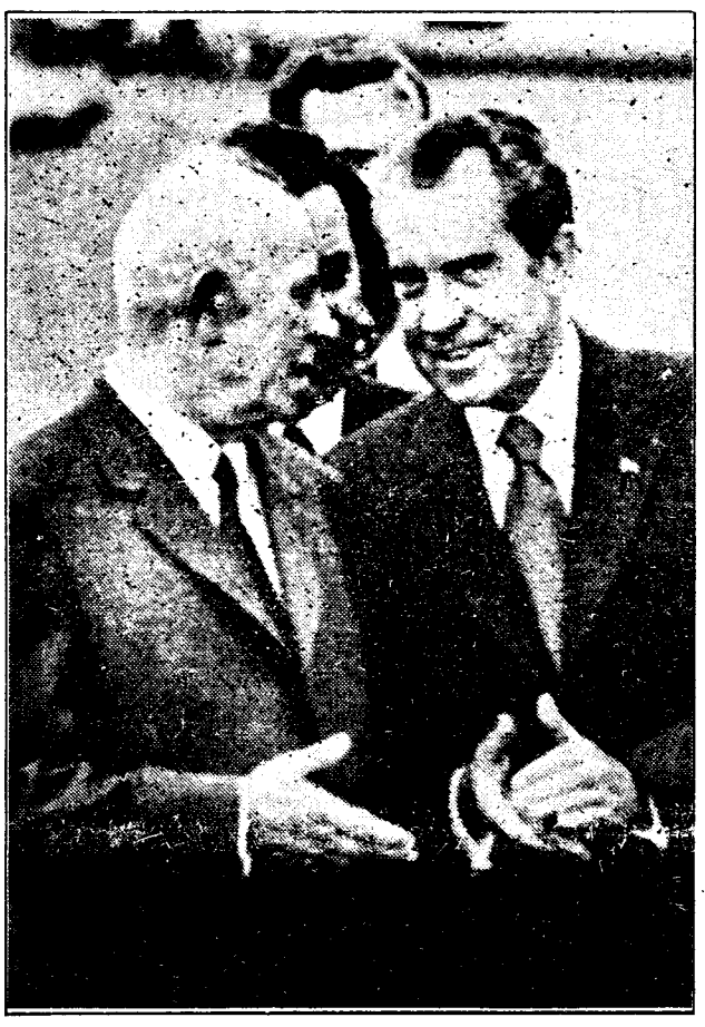
Podgorny and Nixon at Moscow Airport.

copies to: DRV and NLF delegations, Paris