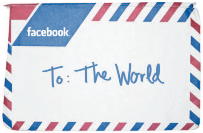
Does Facebook give the left a bigger platform, or undermine the political content of the message?

This is recognised not merely by the advocates of an "attention economics" who adapt mainstream economics by making attention a scarce resource, but also by left commentators such as Jodi Dean and Franco Beradi for whom the domination of the Internet by the interests of capital leads to a breakdown in communication as a result of "a massive, circulating flow of increasingly valueless contributions insofar as each