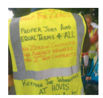
Hovis workers struck against zero-hours contracts

Zero-hours contracts guarantee workers no minimum hours or benefits, effectively placing them "on call" when their employer