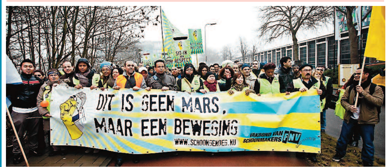
Cleaners' in the Netherlands struck in 2012. Cleaners' organisation is an international issue

University of London Union, Malet Street, London WC1E 7HY