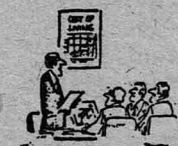
"The figure shows that to maintain a middle-level standard of living, a family needs an upper-level income."

HENRY DODGE TAXPAYERS UNITED FOR TAX LIMITATION