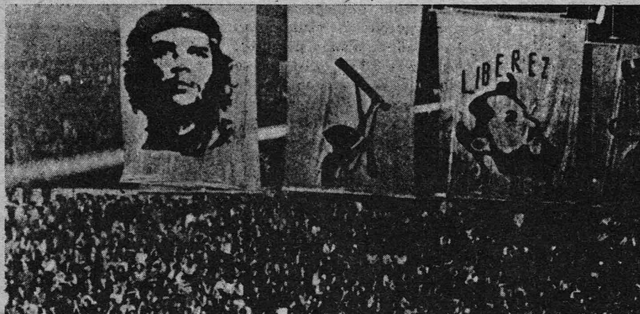
Congress of the French LCR in 1968-- a celebration of guerrillazism

the CP, "pressuring it" to take the lead of the mobilization against Pinochet. They still have not understood, nor will they ever, that the CP has embarked in its collaboration with the Christian Democracy and the "patriotic" sectors of the army to prevent the workers from leading the mobilization against Pinochet. The treacherous illusions that they sow among the masses, on the part of both the Chilean Liga