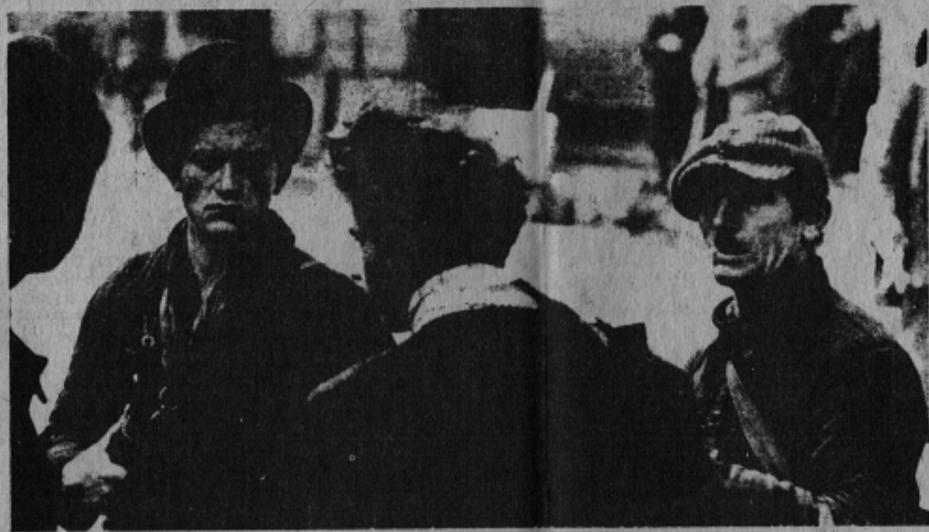
MILITANTS OF 1956 HUNGARIAN WORKERS UPRISING