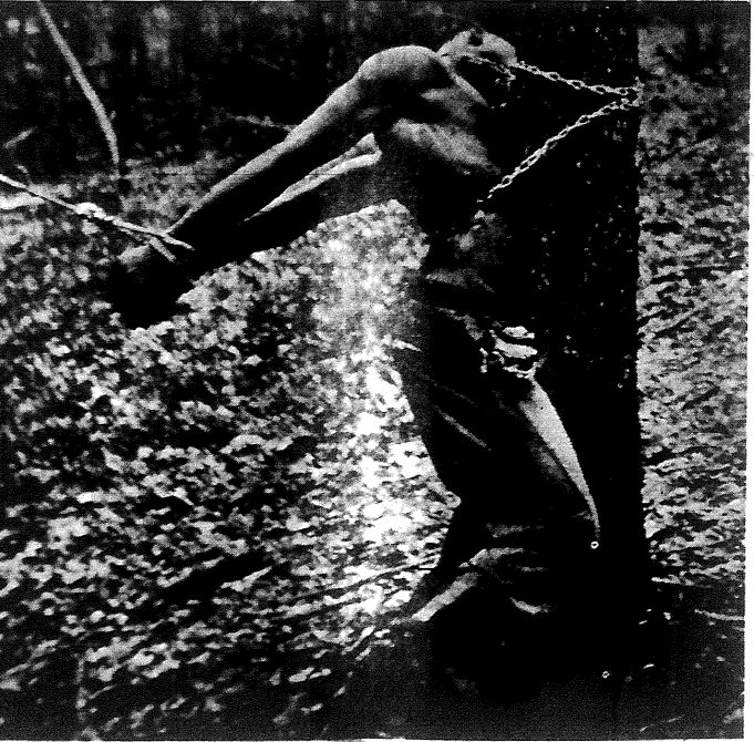
assippi, 1937: accused of killing a white, Blass man was tortured with a blowtorch and lynched.