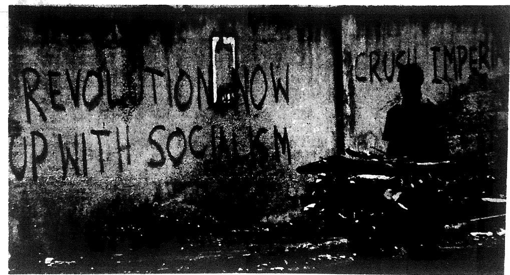
Street scene in Kingston, Jamaica, 1976.

were Came was was party crush befor Unnot the conference of the Aggress true I org