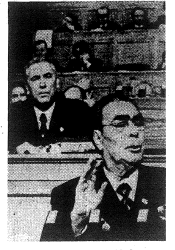
Brezhnev, Gierek at Polish CP Congress.

The events in Poland contain a central lesson. The so-called workers' states like Poland, Russia and China are nothing of the kind. The Polish workers do not run Poland. The main