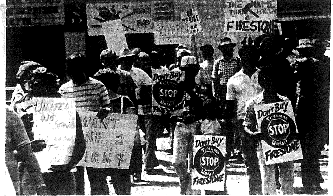
Part of demonstration by 2,000 militant rubber

Treurnicht might as well have gone on to state that it is his government's "right" to determine everything, since this is the real viewpoint of the racist white minority government. Under the system of apartheid, South Africa's ruling white racists deny nearly 20 million Blacks all political rights. While Blacks suffer daily the countless brutalities and indignities of the apartheid system, the white rulers are now slaughtering them in the streets to enforce a decree which states that Black Africans must use the language of the oppressor in their segregated schools! The racist arrogance of the Vorster regime was well-answered