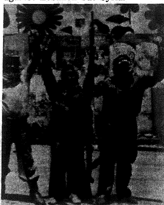
Palestinian troops celebrate a victory.

Last month we reported that Syria had abruptly switched sides in the civil war. A long-time supporter of the Moslem-Leftist Alliance, the Syrian ruling class suddenly threw its support to the Christian rulers when the leftists were close to winning. In the words of the New York Times, "Syria's interest lies in its fear that the leftists and Palestinians might crush the opposition and establish a radical state, independent of Syrian control, from which the confrontation against Israel would be intensified. That could lead to reprisals from Israel not only against Lebanon but Syria."