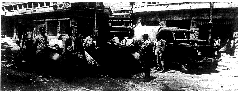
ebanese civilians examine wreckage of Syrian tank destroyed as Lebanese-Palestinian forces defeated Syrians at Sidon.

Just when it appeared that the Syrian army was headed for a major defeat, the capitalist rulers of the other Arab states intervened. Their organization, the Arab League, pushed through an agreement between Syria and the Lebanese-Palestinian leftists.