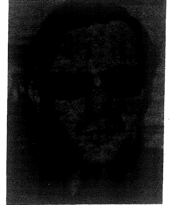
Portuguese President-elect Eanes.

But most importantly, there is still a huge sentiment for socialist revolution among Portuguese workers. This is shown by the sizable vote for the