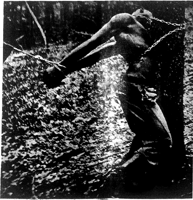
Mississippi, 1937: accused of killing a white, Black man was tortured with a blowtorch and I

The Livernois Five case is a uation of the same racist p. The entire case was nothing attempted legal lynching. Black workers protest the rac