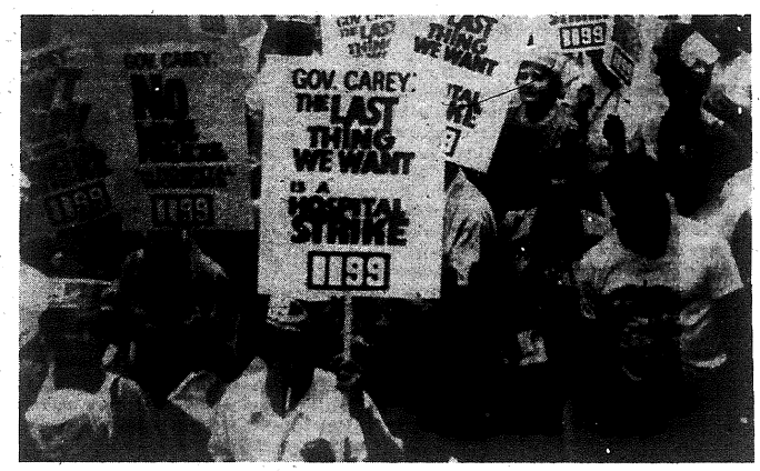
Hospital workers demonstrate. Union leaders' pleas to Governor weaken strike's power.

The hospital bosses are out for blood—our blood. The League of Voluntary Hospitals has refused to bargain with our union. Their offer: no wage increase, no COLA (cost of living allowance), and a "productivity board" which will mean large-scale layoffs and the gradual eating away of benefits for those who still have jobs. The League is trying to break the