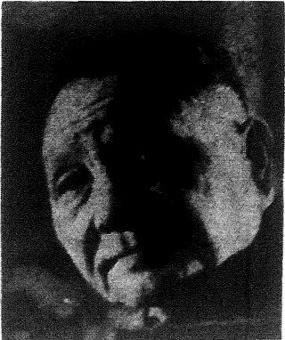
Teng Hsiao-ping, ousted "moderate.

Teng's opponents in the party leadership were headed by Mao's wife, Chiang Ching. Factional strife along these lines is nothing new. The Chinese bureaucracy has long been divided between two overall political approaches, two different answers to the question of how best to maintain