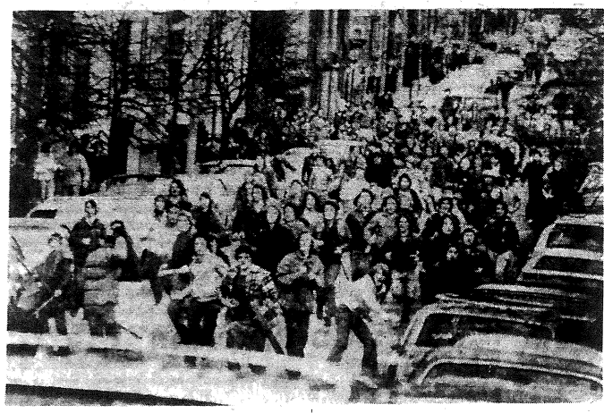
Racists on the march: shouting hate for blacks, they march by day, strike by night.