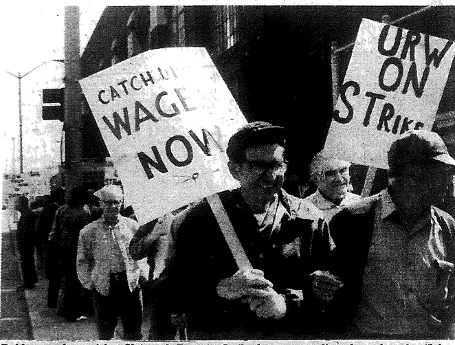
Rubber workers picket Uniroyal, Detroit. Strike has upset ruling class plans for "labor peace." Rubber barons seek to divide workers; key to victory is support by other unions.

Over 67,000 members of the United Rubber Workers (URW) have broken the bourgeoisie's hopes for "labor peace in 1976." The nationwide strike of the "Big Four" rubber companies — Goodyear, Goodrich, Uniroyal and Firestone—shows no signs of a quick settlement as it enters its fourth week. Unlike the IBT strike, designed by the ruling class and the union bureaucracy to end quickly while letting militants blow off steam, the rubber strike is a serious test of strength between the union and the companies.