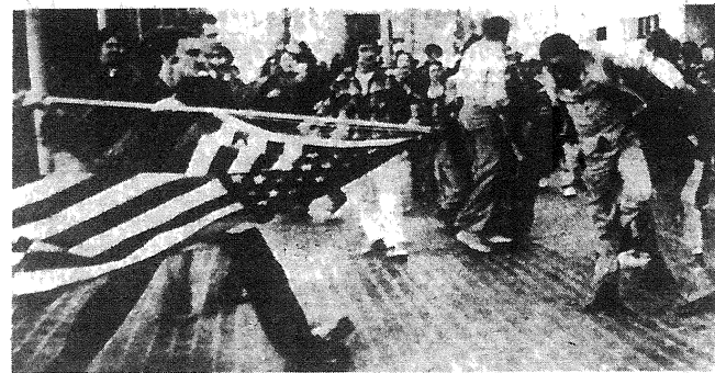
Racists jab "Old Glory" at black attorney in Boston. Attack climaxed weeks of white violence, but liberals hypocritically preached "non-violence" when blacks fought back.

BOSTON—Blacks in this city are being subjected to a widespread and increasing terrorist campaign by wellorganized white racist forces. Vigilante groups going under names such as the "Charlestown Marshals Association" and the "South Boston Marshals Association" have capped a month of night-riding forays into black neighborhoods with public threats against leaders of black and left-wing organizations and a march in which they sported Ku Klux Klan and North American White Peoples Party buttons. Boston's liberal establishment has chosen this time to join the open racists in blaming blacks for the violence, seizing upon one or two