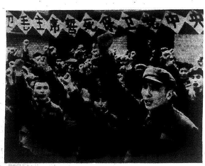
Workers and soldiers in Politburo-organized rally against Teng. Two factions in Chinese ruling class seek mass support but fear real intervention of masses in party struggles.