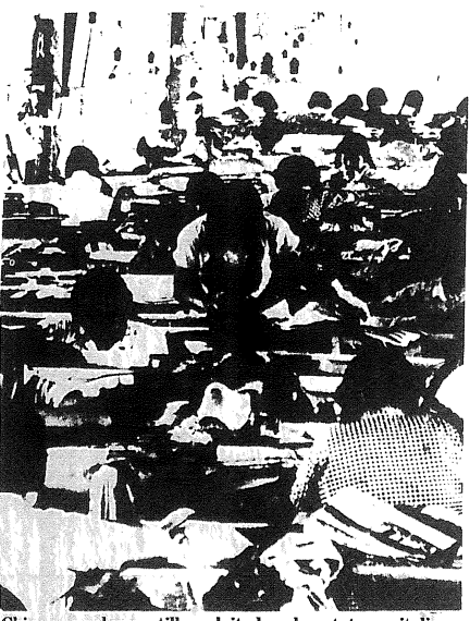
Chinese workers: still exploited under state capitalism. Fake-Marxist ideology helps keep them on the job.

There were no workers' insurrections. No workers' councils or factory committees were set up. Capitalist production relations were maintained.