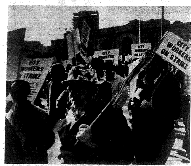
Pickets at San Francisco city hall. For 39 days, solidarity of other city workers prevented defeat of craftsmen. Obstacle to victory: union leaders' refusal to call a general strike.

The San Francisco city workers strike has ended in defeat. After 39 days, the Board of Supervisors and the trade union officials hammered out a "compromise" that means big losses for San Francisco workers. This setback in one of the strongest union towns in the United States will affect public workers throughout the country. The ruling class, buoyed by its victory in San Francisco, will feel more confident to step up its attacks on workers in the public sector else-