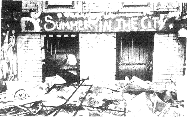
Underlying rot of capitalism isn't changed by shallow upturn. Bosses lack capital for real expansion of production: "growth" now comes through speedup, neglect of social needs

than an upturn mainly limited to consumer spending and inventory building (increasing warehouse stock-piles to take into account increased consumer buying). Half the 7.5 percent increase in GNP in the first quarter came from a $10 billion increase in the value of inventories There has not been as much pick-up