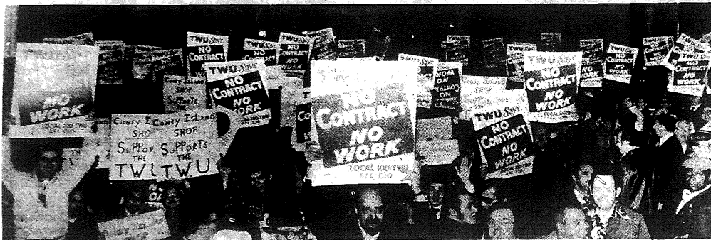
New York transit workers rally for militant action. An immediate strike is necessary to defend the TWU and all New York union