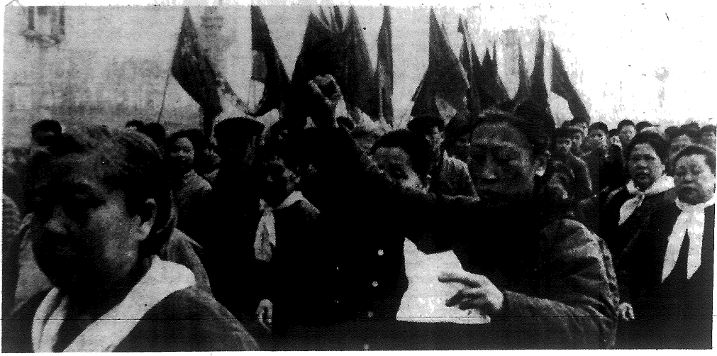
Anti-Teng rally. The basic problem facing China's rulers is how to decide between two capitalist roads without a mass upheaval.