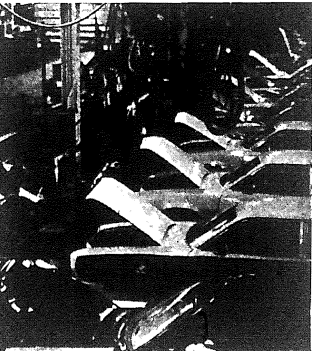
Idle Ford plant. New layoffs are planned.

If Ford refuses to back down, the UAW will enter national contract talks with workers on the picket lines in defense of their jobs. A real defense at Rouge will tell every Ford worker that the auto workers are ready to fight for their jobs. \square