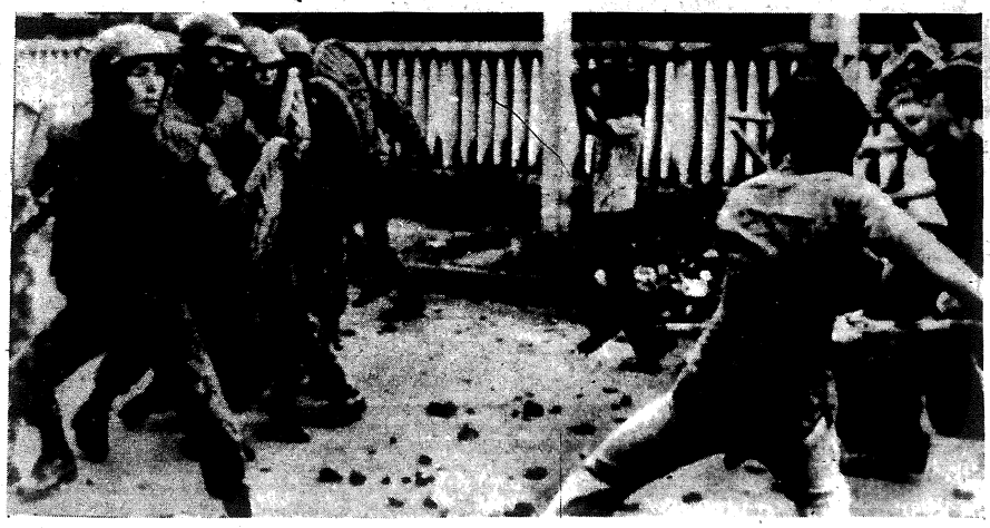
battle troops of U.S. puppet Thieu, 1974. Defeat of U.S. imperialism in Vietnam was a victory for the working class, but brought to power a state-capitalist regime. The struggle for working-class rule must be continued.

Lenin organized the Bolshevik Party in opposition to Menshevism, and the Third International in opposition to the pro-capitalist Second International. But following Lenin's illness and death, Stalin succeeded in destroying the Bolshevik Party, the Third International and finally the