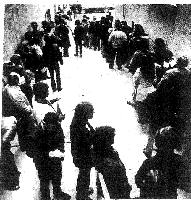
recession hasn't ended mployed workers line up for public service jobs. For them,