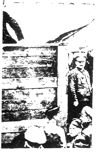
stressed that the og class must be or d independently.

overall interests of the Indonesian ould lead them, sooner or later, to verful workers' movement, and when be the most powerful sectors of the i the army would be on the side of the ition. ao change his policy following this