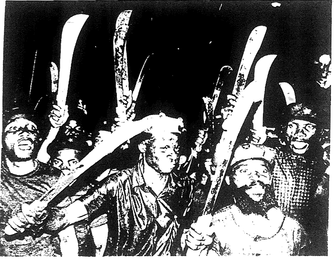
MPLA troops celebrate victory over puppets of U.S. imperialism. Defeat of U.S. imperialism will be a gain for the proletariat of Angola and all of southern Africa.

Since mid-January the forces of the MPLA (Popular Movement for the Liberation of Angola) have scored a series of gains against the U.S. puppet and South African forces. Victory is near.