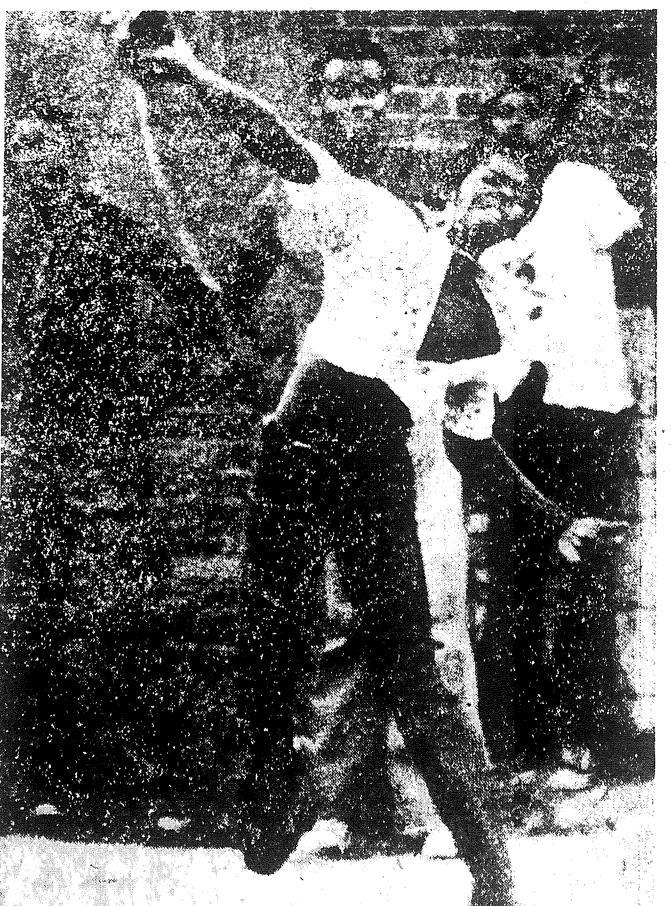
Black youths took to the streets last July to protest racist attacks by Detroit cops. Spartacists denounce "lumpen rage" and call for swift punishment of the oppressed.

(The Defense Committee is urgently in need of funds to continue its work. Please send funds and requests for further information to: Livernois Five Defense Committee, P.O. Box 503, Detroit, Michigan 48221.)