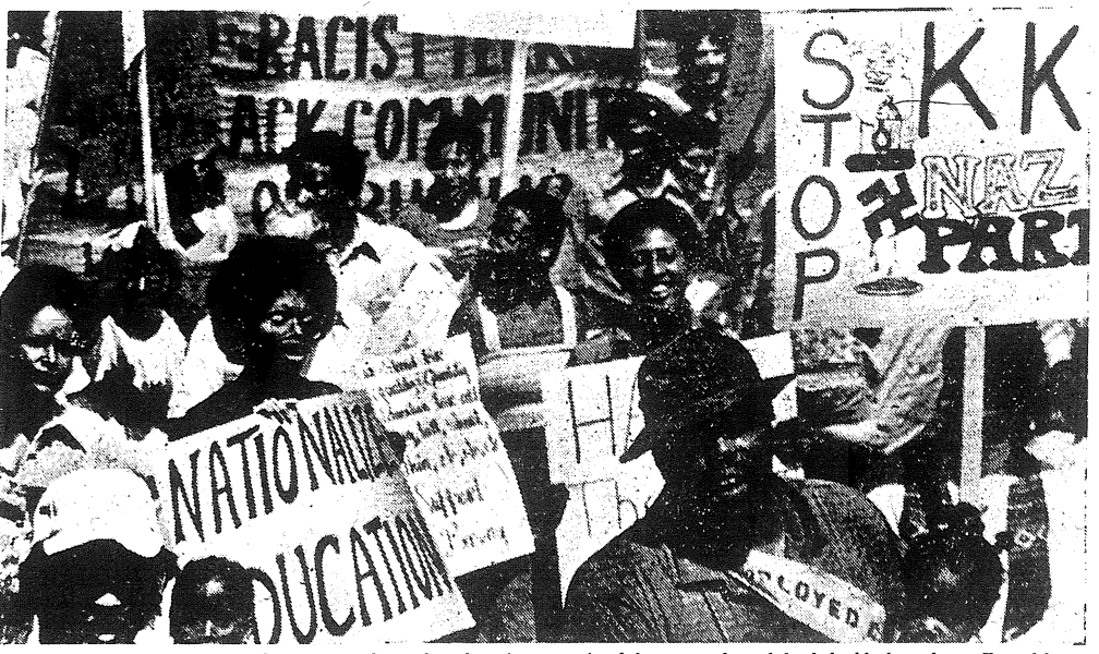
March against racist attacks. Militants must demand trade unions organize defense guards to defend the black students. Forced busing must be exposed as a ruling class scheme to prevent a united working class response to capitalism's destruction of the schools.