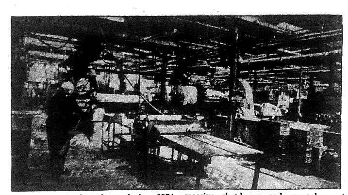
British factory shut down during 1974 three-day week imposed by bourgeois government. Full-scale depression, with

Yet the postwar boom was rooted in the decay of capitalism and therefore carried with it the seeds of its own destruction. The boom depended on the crushing of the working masses of Europe and Asia under fascism, the Depression, the slaughter of World War II and in the defeat of the working class upsurge right after the war. It was made possible by the worldwide domination of American imperialism, squeezing superprofits out of the workers and peasants of the war-torn and colonial countries and concentrating ever larger amounts of capital into ever fewer hands. The boom required the piling up of mountains of debt and fictitious capital to finance first wartime destruction and then postwar construction beyond the levels of actual production of commodities.