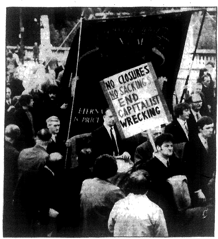
Welsh miners' demonstration in 1972 demands an end to capitalist attacks on the