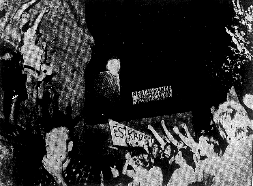
disaffected peasants, sections of the working class into

Without a revolutionary party, the working class will remain at the mercy of "socialists" of various stripes who have amply shown that they can only lead the workers to defeat. With it, the Portuguese working class will defeat counter-revolution and establish pro-