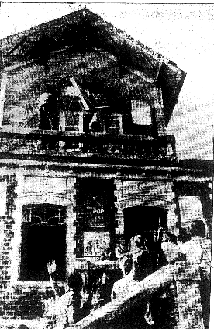
CP HEADQUARTERS RANSACKED IN FAMALICAO. Gerald Ford thinks it "tragic" that CIA cannot play more active

The urban middle classes and the petty-bourgeois small shopkeepers were completely disaffected by the regime's inability to provide for them by stabilizing the economy; their petty-bourgeois views of democracy clashed with the CP-MFA rhetoric and policy. The bourgeoisie was up in arms over the state's inability to blunt the workers' struggle and were fearful of further nationalizations. There was