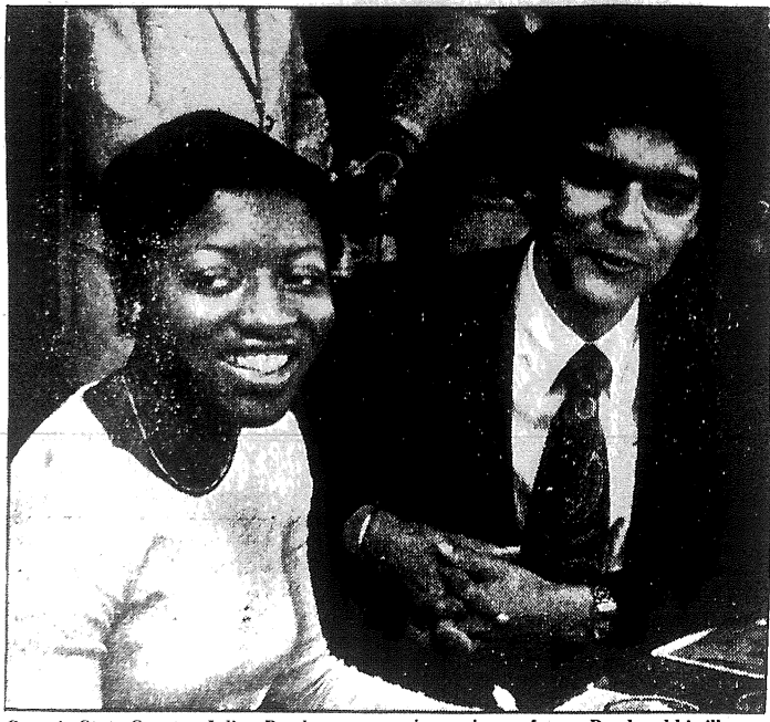
Georgia State Senator Julian Bond represents liberal attempt to channel mass outrage into move for "fair trial" and

Little's freedom. Capitalism will find new victims for its brutality as long as it is permitted to exist. The struggle to free Joanne Little must be part of the revolutionary strategy which uses each partial victory to strengthen the organization of the oppressed and exploited against the capitalist system.