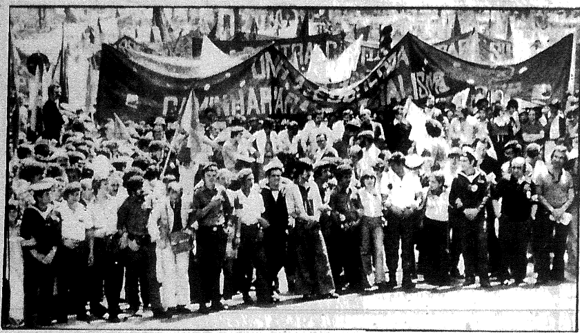
SOCIALIST PARTY RALLY. Portuguese SP prepares ground for right