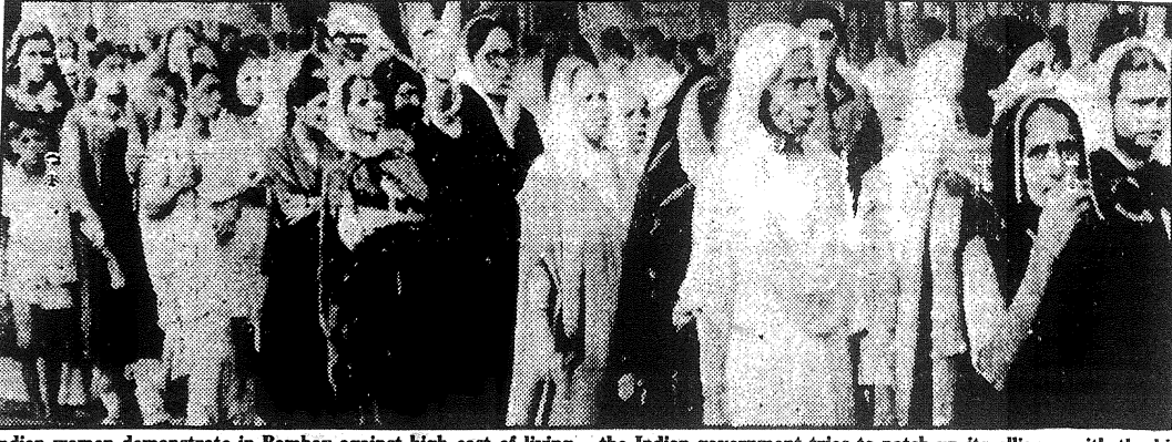
the Indian government tries to patch up its alliance with the big Indian women demonstrate in Bombay against high cost of living and impending economic collapse. The masses face starvation while bourgeoisie and the Soviet Unio

business, semi-fascist and Hindu communalist elements. The same is true of Fernandes' Socialist Party, the Indian affiliate of the so-called Socialist (Second) International, As head of the railwaymen's federation, Fernandes headed the giant May, 1974 strike, and his recent call for underground resistance indicates he is still putting on a militant face.