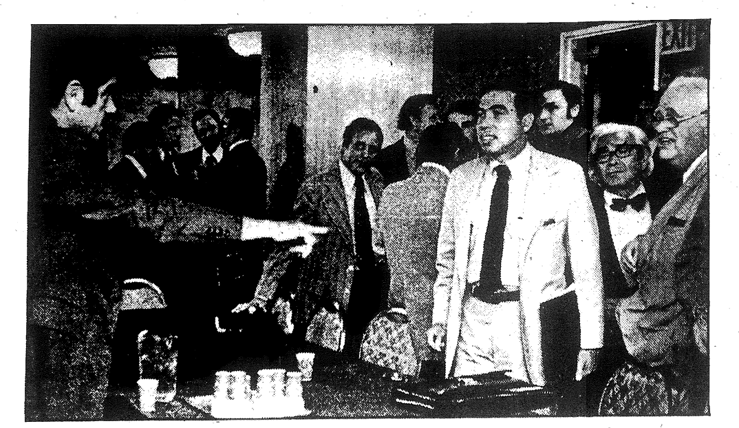
AFSCME District 37 head Victor Gotbaum's militant gesture wins smiles of New York City officials and MAC representatives, whose