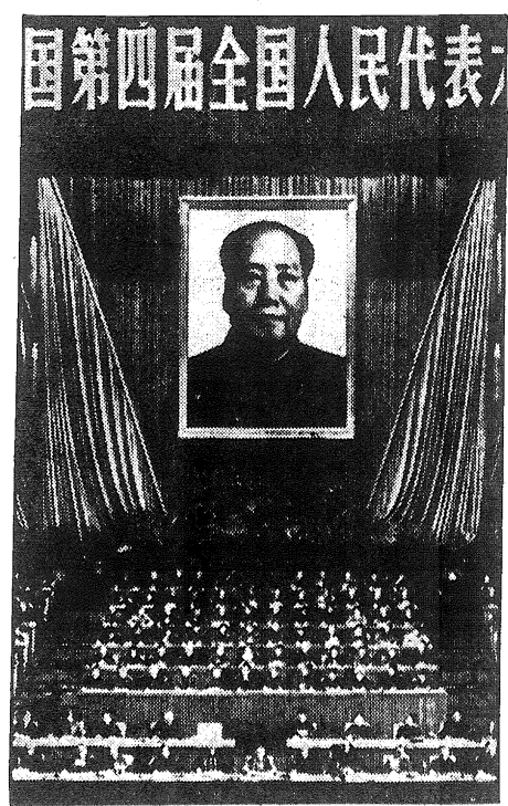
Mao Tse-Tung followers constitute largest centrist current in U.S. today. Fundamental acceptance of Stalinism bars Maoist organizations from revolutionary role, despite their militant image

In the long run a counter-pressure will intervene. An upsurge in the class struggle will inevitably