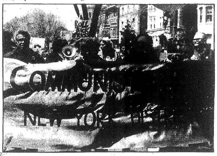
Communist Party contingent at April 26 Washington demonstration. CP plays blatant class collaborationist role, attempting to coopt mass struggle through Popular Front strategy.

force the CP to adopt a more radical and independent-looking stance. As a result, the CP will thrust forward its Third Party-Popular Front approach in its efforts to coopt the mass struggle. It is highly unlikely that the CP will achieve