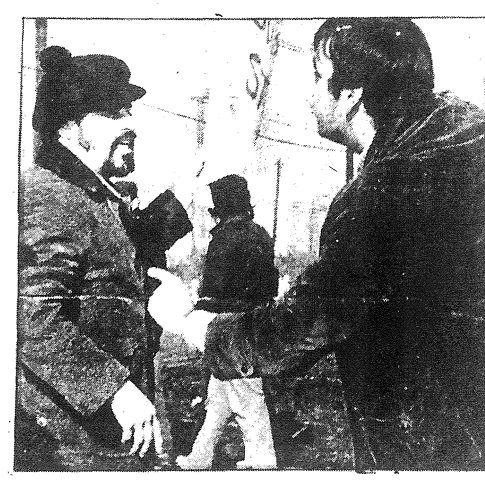
Picket aruges with postal inspector at Jersey Bulk Center wildcat. RU told blacks struggle against on-the-job racism "turn off" white workers

views. It didn't base itself on what was currently popular. PAC could expose Outlaw's hypocritical lies, its fake militancy and restraint of militant struggle.