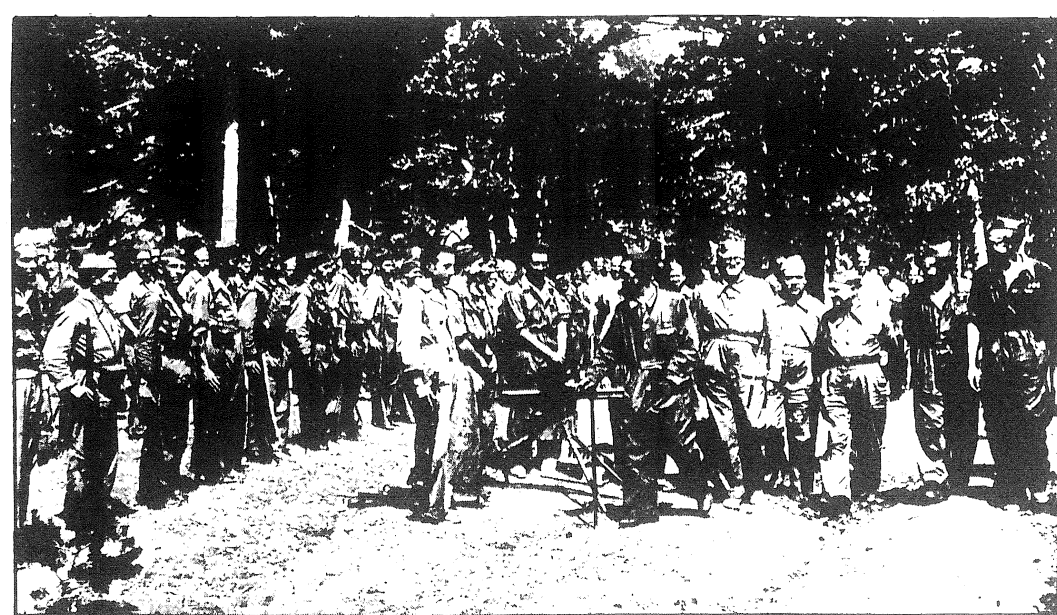
Republican troops reviewed by Socialist politicians during Civil War. Revolutionary proletariat showed tremendous strength and heroism but leadership betrayals via Popular Front opened door to Franco victory.

The monarchy, one of the most insidious feudal relics, must be through their entry into the Popular completely eliminated. In its place the