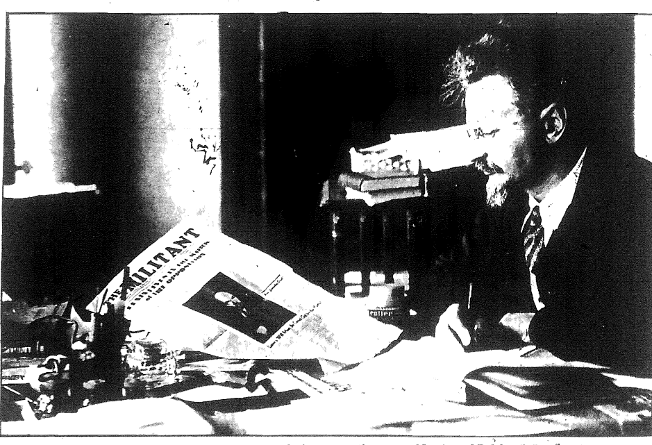
Leon Trotsky and Fourth International were the revolutionary continuators of Lenin and Bolshevik Party. RSL represents this tradition; pseudo-Trotskyists capitulate to political opportunism.

The SWP justifies its capitulations on all fronts by means of the Pabloite theory that consistent reformism leads to revolution. The theory arose from the discovery of "workers states" in Eastern Europe, China and Cuba that were created by consistent anti-imperialism, and was extended to include consistent feminism, black nationalism and