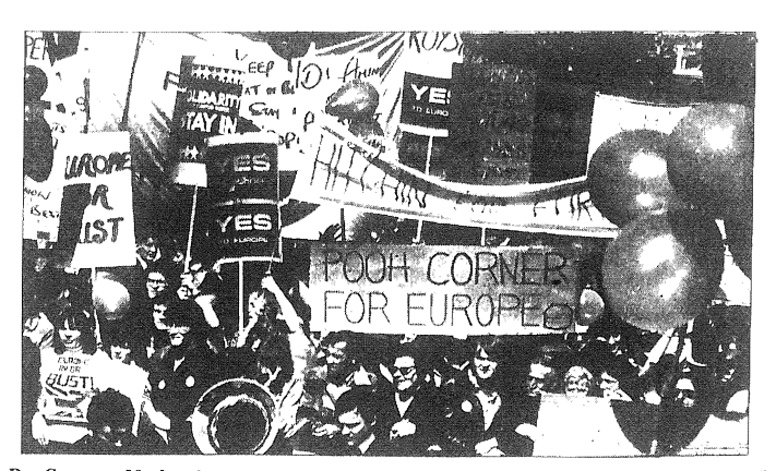
Pro-Common Market forces demonstrate in 1975. "Mao-Tse Tung Says Yes to Europe slogan supports Mao's right wing "unity" with Western imperialism.

For the workers of Britain and every EEC country, opposition to the EEC must be based on the principles of socialism and opposition to imperialism. An internationalist economy, making use of a worldwide division of labor for industry, agriculture and the extraction of raw materials, can never be built by capitalism. Capitalist states, representing the competing