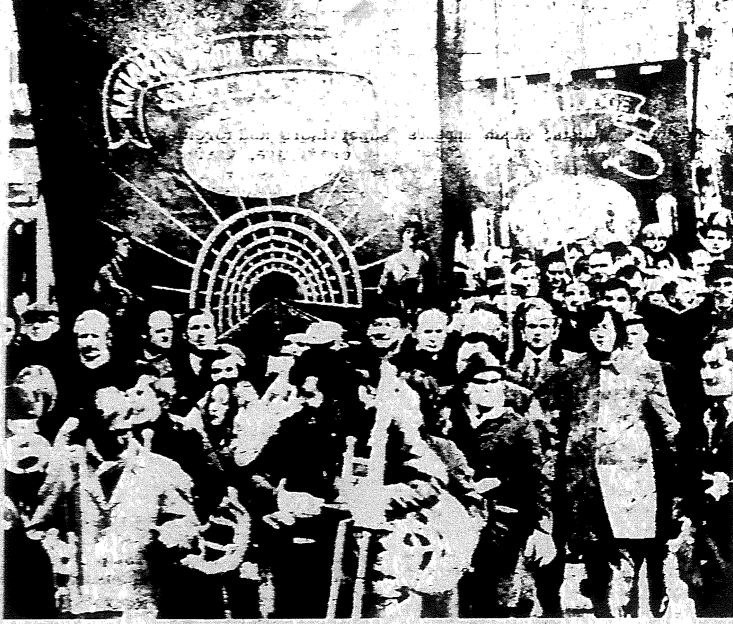
Welsh miners march against capitalist attack.