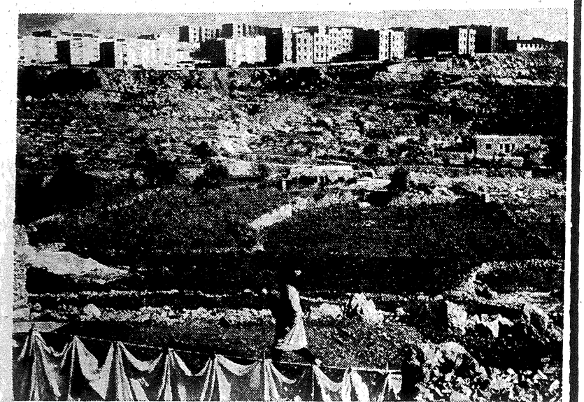
Occupied Jordan: modern housing for Israelis overlook slums for Arabs.

Statement of the Central Committee of the Revolutionary Socialist League