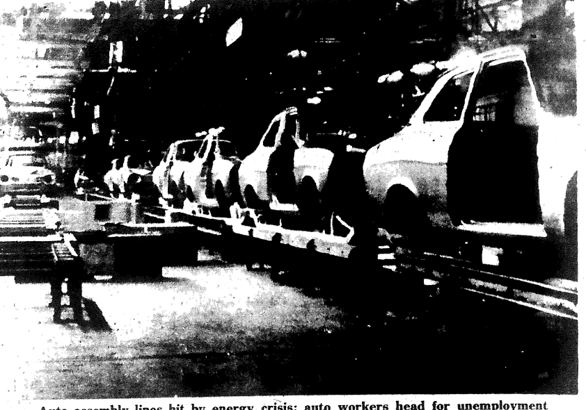
Auto assembly lines hit by energy crisis; auto workers head for unemployment

The heralded Supplemental Unemployment Benefits (SUB) will do little to protect auto workers from