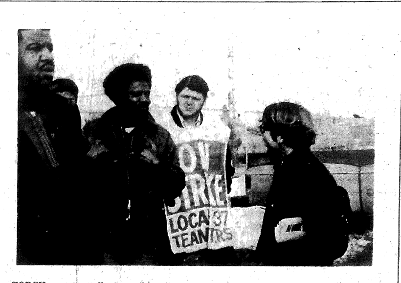
TORCH reporter talks to striking Teamsters in Detroit. Local 337 struck for two weeks to defend union rights.

There is only one solution for the proletariat: the abolition of the capitalist system and its profit hunger and the establishment of the rule of the working class-socialism.