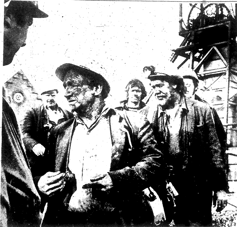
The British ruling class is blaming miners for the crisis of decrepit British capitalism.

If the TUC retreats, calls a general strike only in order to betray it, British revolutionaries would re-emphasize to their comrades the need to maintain and strengthen the Councils of Action—warning against the TUC's inevitable treachery, demanding that the Councils take over