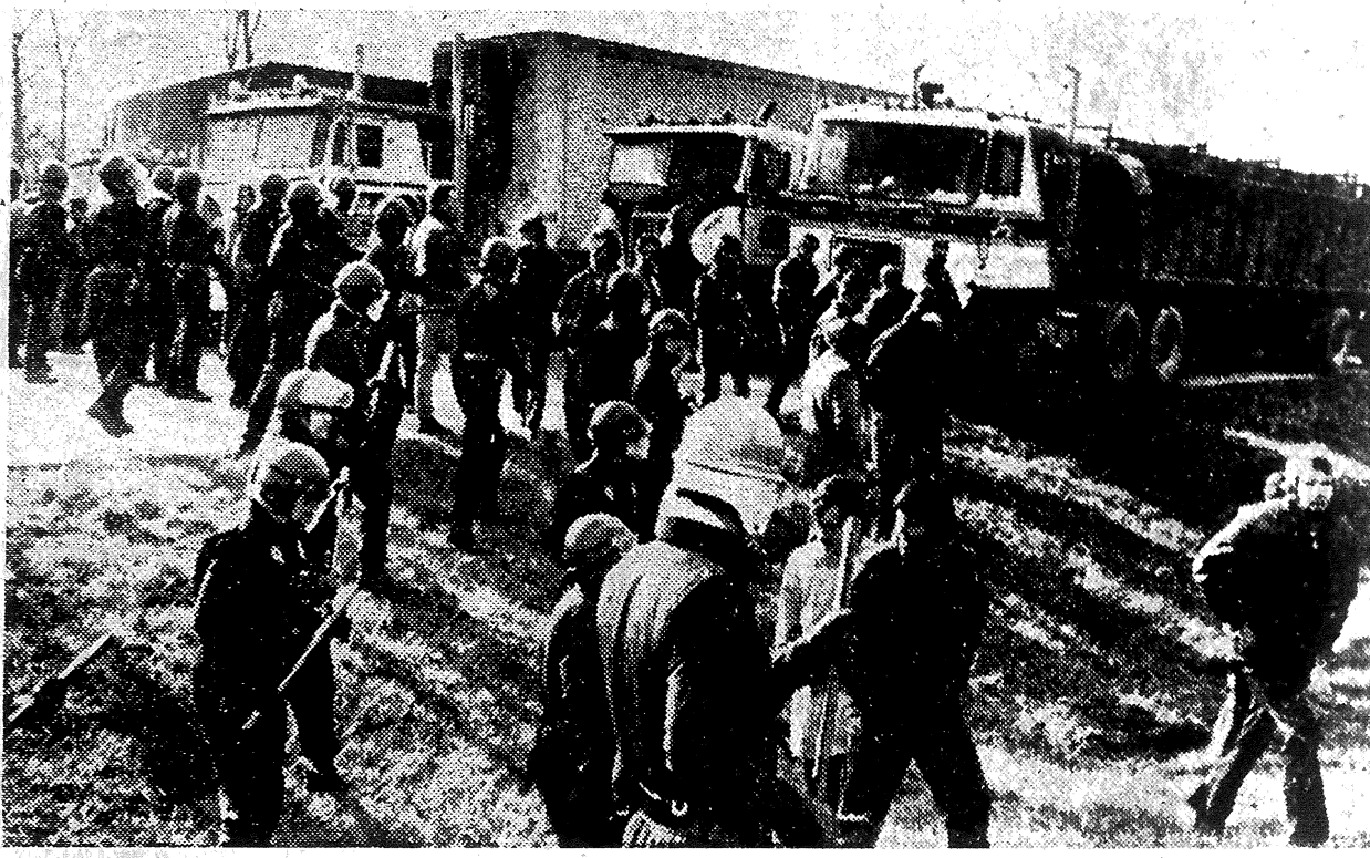
Independent truckers are hard hit by energy crisis. Troopers above break up stall-in in Amherst, Ohio [See