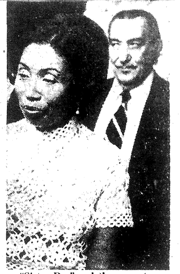
Sister Doc" and thug grunt over "unique" resort.

A New York socialite, decked out in a glowing bib of imitation diamonds, chimed in with, "It's tropical poverty as wall to watch the rich enter. opposed to cold poverty, which is much worse." Which doesn't keep her kind from building ski resorts in the included government officials midst of French-Canadian