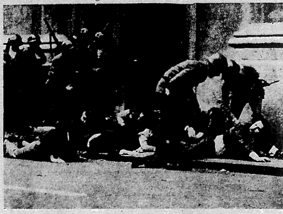
Army rounds up suspected militants in working-class district.