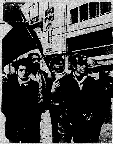
Striking Chilean miners earlier this year.

Unfortunately, the MIR could not dictate the capitalists' strategy. The capitalist offensive struck the working class on all fronts, and the MIR's plans relegated the industrial workers of Santiago, the vanguard of the Chilean proletariat, to the bottom of their list of priorities. Nor did the MIR emphasize the critical need to form mass