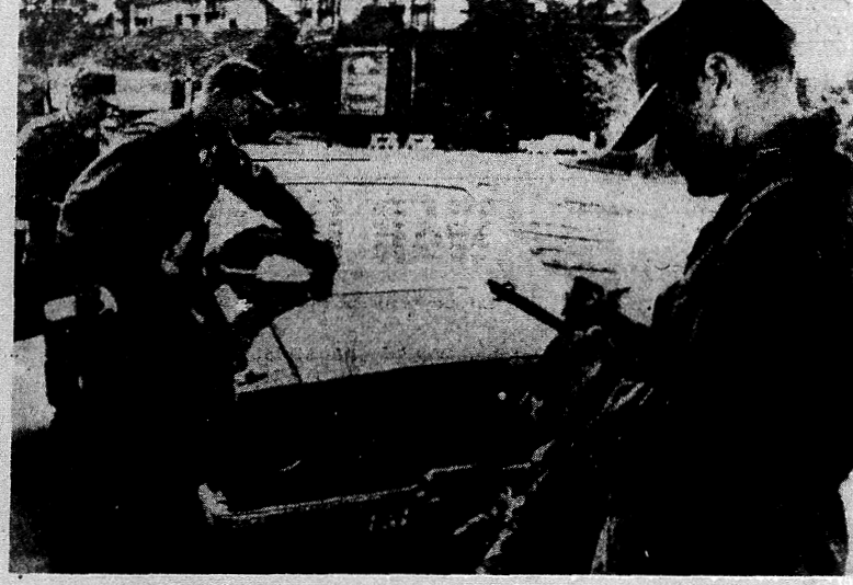
National Guardsmen had to be called out recently to pump gas for big shots attending Western Governors' Conference in Gleneden, Oregon. Stations closed in protest of federal price controls. The governors gathered to discuss "the energy crisis."

Only the working class can qualitatively expand total social production, by unchaining the most potentially creative, revolutionary source of productive innovation-the working class itself in power!