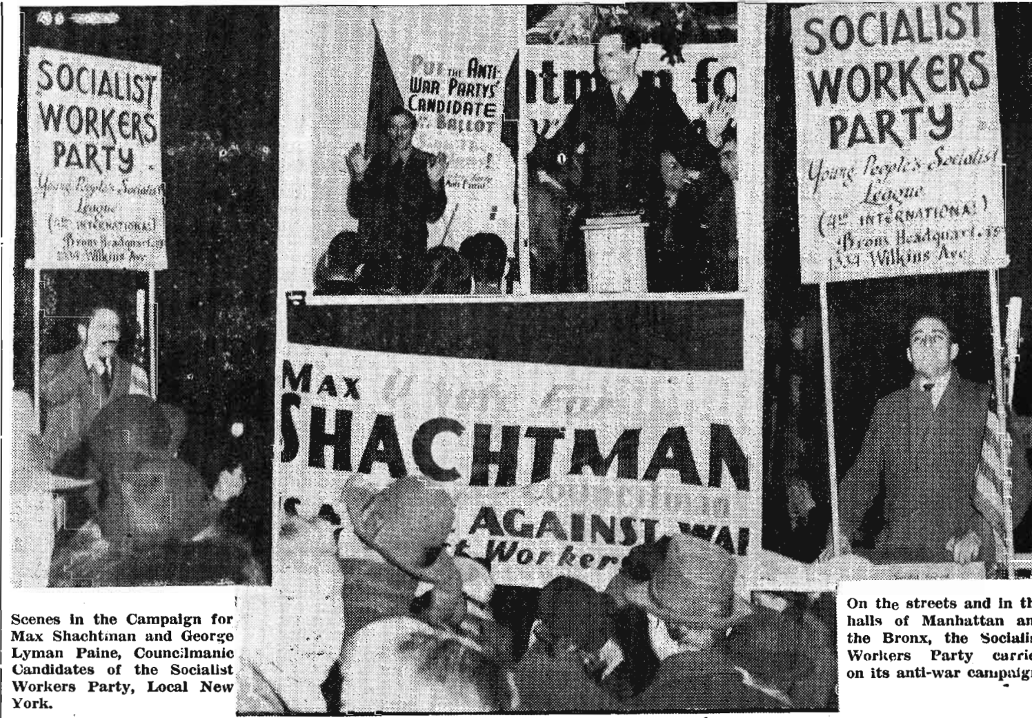
Scenes in the Campaign for Max Shachtman and George Lyman Paine, Councilmanic Candidates of the Socialist Workers Party, Local New York.

That is the road to future peace and plenty. All other ways lead to blind alleys of death and destruction and perpetuated poverty.