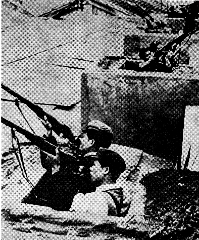
DEFENSE. A self-defense unit of a factory located in Haiphong.

governors who responded to a recent New York Times survey on their assessment of public opinion on the war, 80 discerned a "strong sentiment for negotiation or withdrawal" and 64 reported "broad general opposition." Sixty-nine said there was no weakening of support for the war, and only 30 reported sentiment for a victory through more military action. (Of those officeholders who responded, 145 identified themselves as "supporters" of the President. Thirty of them said they had switched to a "stronger peace posture" in recent months.)