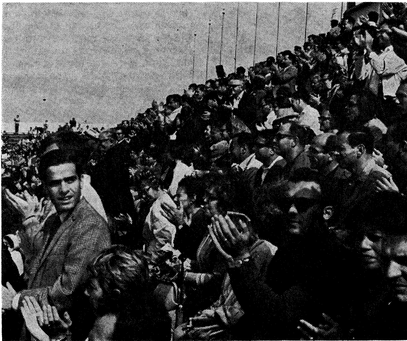
TEACHERS' RALLY. Ranks of teachers demonstrated solid support for contract action.

Although the membership of the union is ready to wage a strong fight against the attack, many