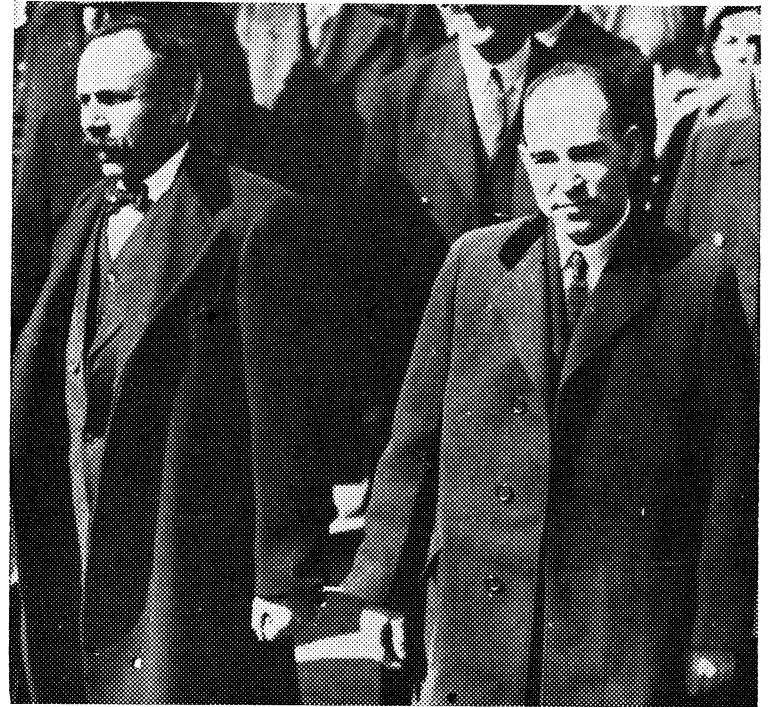
MARTYRS. Nicola Sacco, right, and Bartolomeo Vanzetti

In 1926 and 1927, the defense began to receive more domestic support. The strongest came from the International Labor Defense. The ILD was headed by James P. Cannon, now the national chairman of the Socialist Workers Party. Cannon writes in The First Ten Years of American Communism that the ILD "was formed in 1925 under the direct inspiration