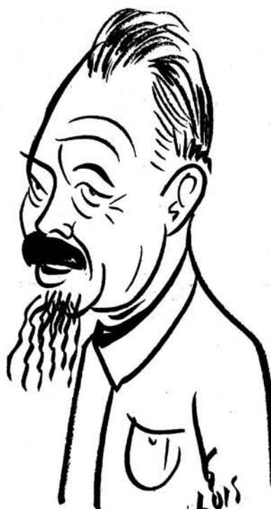
Ho Chi Minh

Finally, there remain isolated individuals, perpetual collaborators with French imperialism during the 1945-54 revolution, and the army — sole organized force,