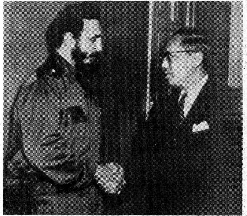
PRESENTED DEMANDS. Fidel Castro and UN General Secretary U Thant during Havana meeting last October when Castro rejected proposal for UN inspection of Cuba and presented Cuba's five points for settlement of crisis. Chinese leaders charge Soviet Union has given only lip service to the five points and has done nothing to help wrest them from U.S.

Red Flag errs in placing Stalin along with Mao at the head of the Marxist-Leninists, and in lumping the Trotskyist Left Opposition with the right-wing Bukharin faction, in the struggles of the post-Lenin period. The reverse was the case. But it is correct in pointing out the linkage between