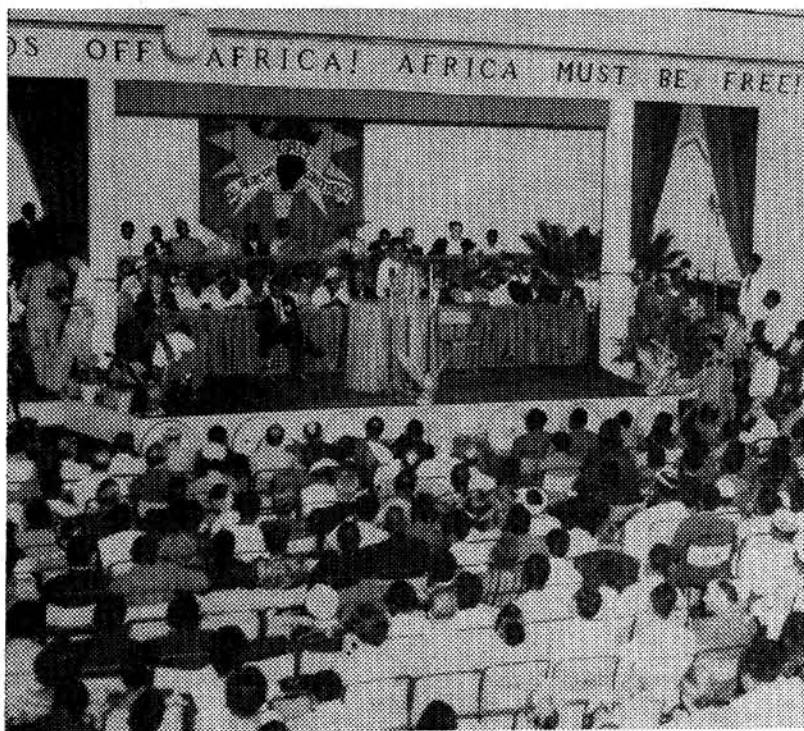
FOUNDING CONFERENCE. The strong spirit of Pan-Africanism which pervades continent received first major organized expression at this All-African People's Conference in Accra, Ghana, December 1958. Since then African students abroad have formed Pan-African unions in many countries. Formation of one in Bulgaria recently brought wrath of government.

Bulgarian officials must already be regretting their high handed methods. Little more than a week after the demonstration was broken up, Premier Zhivkov was reported making a special trip to Moscow. Whether his trip concerns the crisis with the African students or some other matter — such as his recent dispute with a pro-