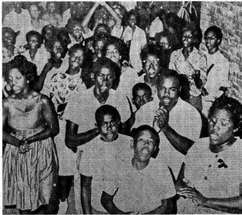
Negroes arrested in Albany, Ga., last summer for demonstrating against segregation sing freedom songs as they wait outside jail for their turn to be booked. Over 1,200 arrests have been made for desegregation demonstrations in Albany since Oct. 1961.

Of significance in the Mexicali action is that the CCI forces proved far more powerful than