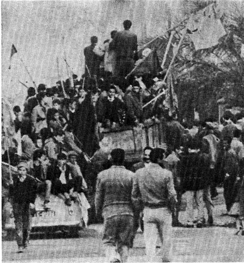
ON THE OFFENSIVE. During civil war against French colons, Algerian independence fighters suddenly descended on French sectors in demonstration of strength and determination to continue battle. Scene here is Algiers at end of 1960.

The combining of all these various enterprises which formerly belonged to individual proprietors, enables the co-operative to operate to a great extent on its own resources. The clay pit provides materials for the brickyard; it in turn supplies the construction business; the farms provide prod-