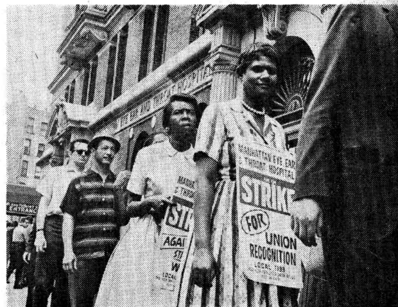
Striking workers at Manhattan Eye, Ear and Throat Hospital say they will keep picketing until they win union recognition.

The significance of the new developments goes far beyond those strikers directly involved. Most voluntary hospitals are unorganized. This should mark the opening of a serious and effective campaign, backed by the whole labor movement, to organize them. Such a successful drive by Local 1199 could spark organizing drives in other industries and inspire New York's low-paid Negro and Puerto Rican workers, who number over