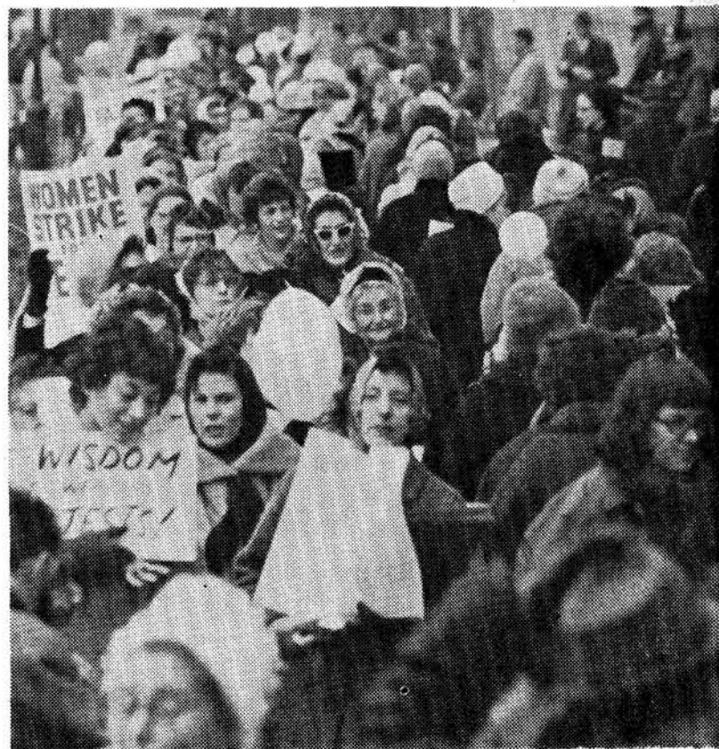
AGAINST THE BOMB. While 2,000 women marched in front of the White House Jan. 15 in a "Strike for Peace," these women backed them with a picket line at the UN. More than 500 jammed behind the police barricades to demonstrate their opposition to war.