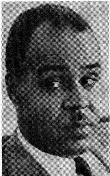
ROY WILKINS , executive secretary of the NAACP, was "sorely disappointed" at Kennedy's failure to take a firm civil-rights stand.

But there were many people who took his campaign oratory seriously, waited patiently through