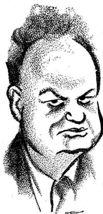
French Communist leader Maurice Thorez was angered when Italian Communist youth proposed an objective study of Trotsky's views.

"We officially ask the Communist Party and the Socialist Party to undertake the initiative of