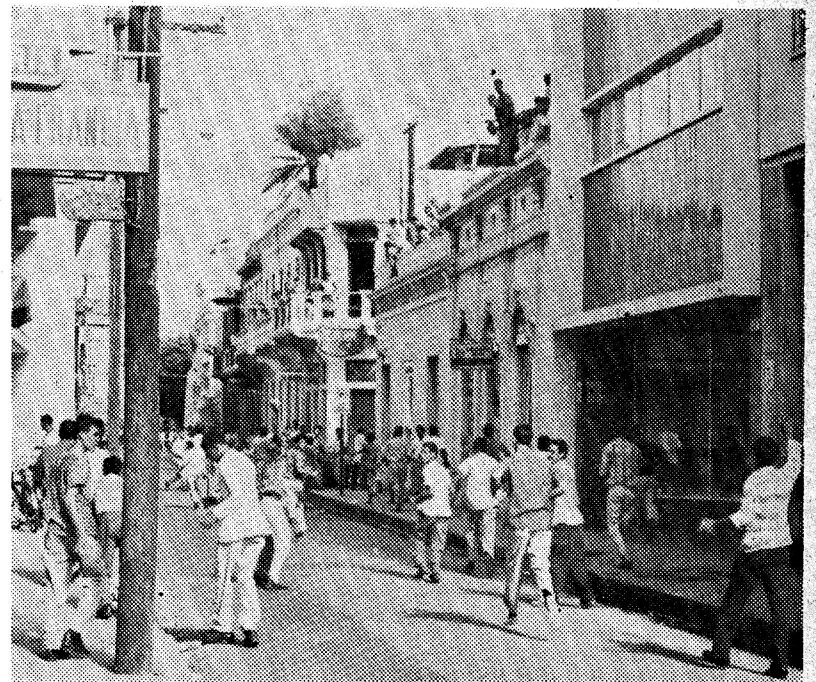
Rock-hurling Dominican students pursue secret police down the street in Ciudad Trujillo after cops used guns and clubs to smash anti-Trujillo demonstrations.

"The citing by the court of the fact that the ballots are printed in English as good reason for the voting ban simply shows the most callous disregard for the Bill of Rights and democratic processes. Ballots could easily contain both languages, at an insignificant cost.