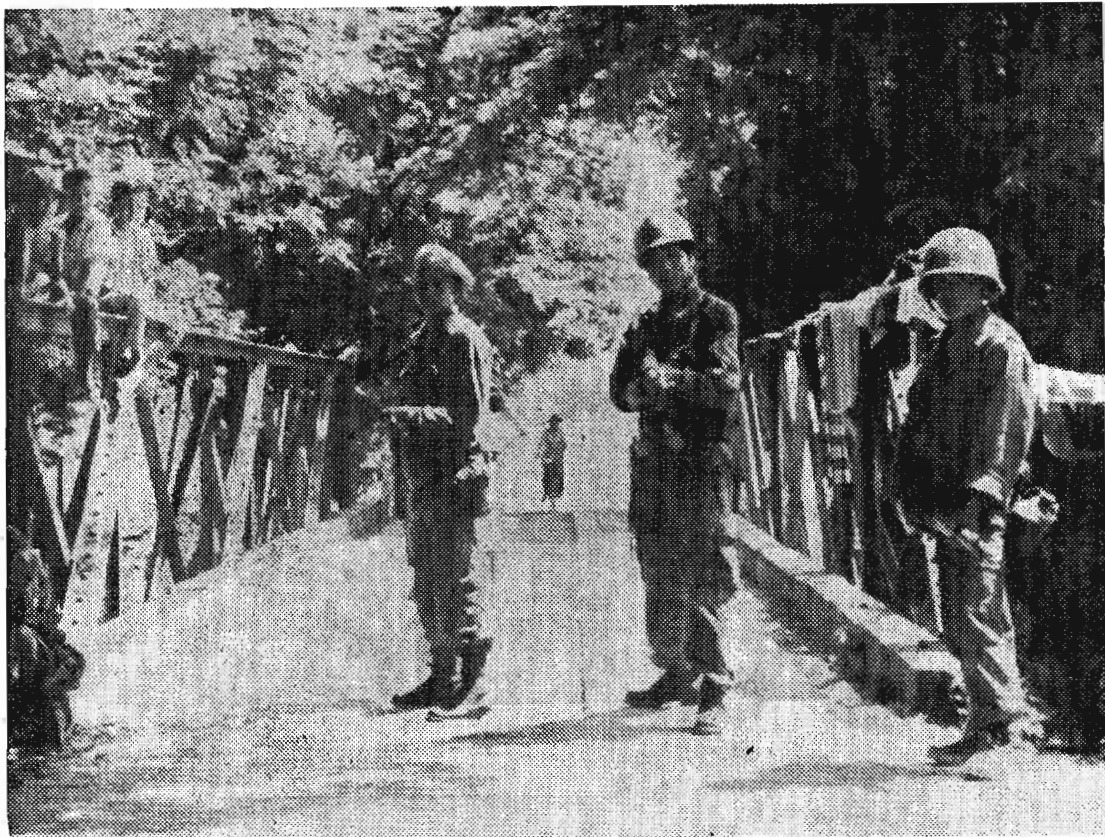
Followers of Captain Kong Le who sought to replace a U.S.-dominated government by one that would follow a policy of neutrality. A counterrevolution, in which the Central Intelligence Agency was deeply involved, pushed the neutral government out of the nation's capital. Since then civil war has raged.