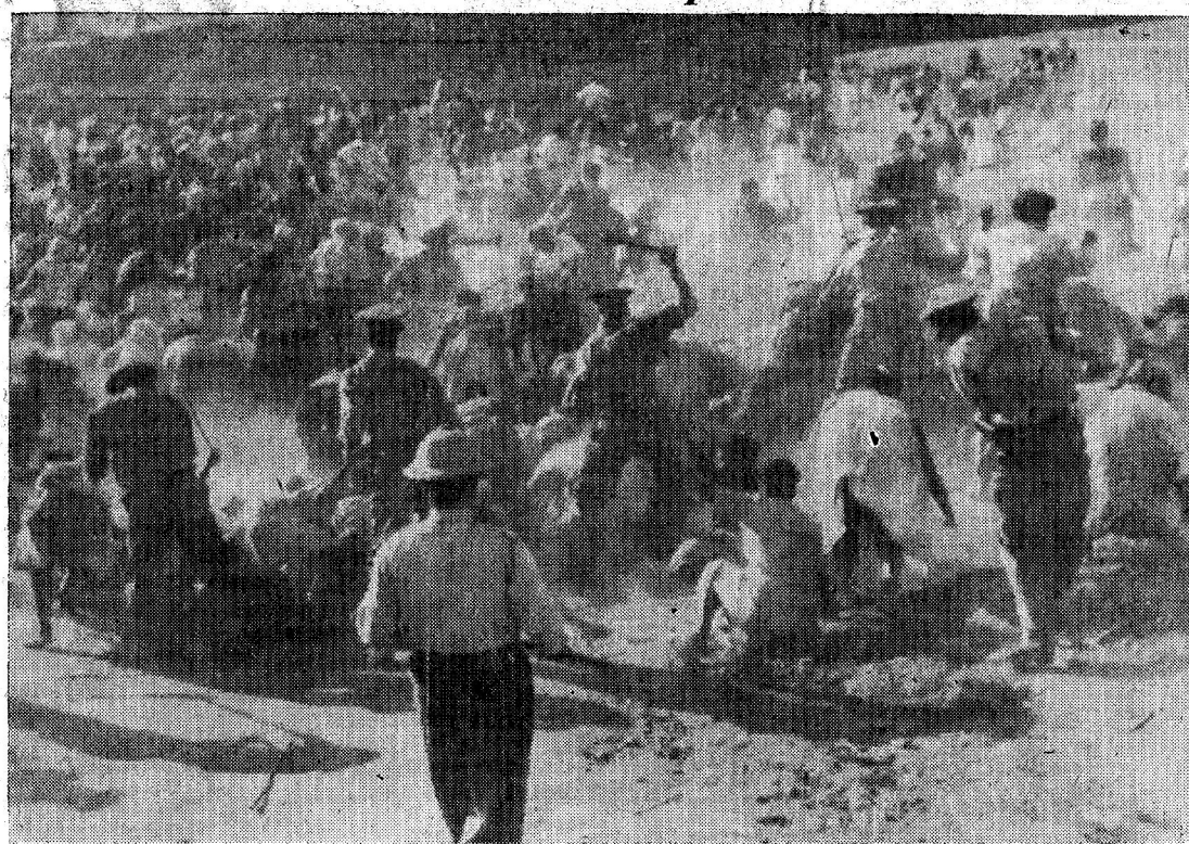
Last June, racist police in Durban, South Africa swung clubs as they sought to disperse demonstrations of African women. In past two weeks, the police have been seeking to preserve "apartheid" by shooting into crowds. Strikes and further demonstrations have been the Africans' reply. On March 27, the South African government granted a significant concession on the hated pass laws. At the same time it enacted further repressive measures.