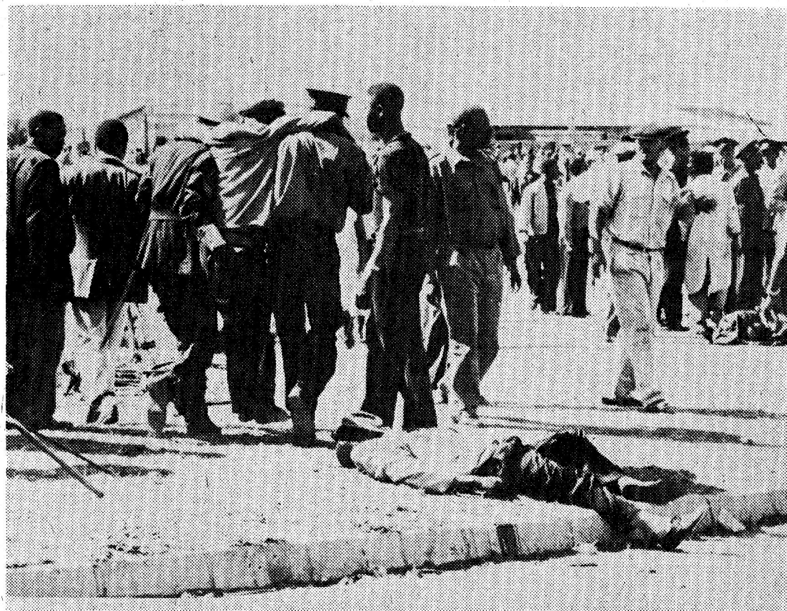
South African police admit to having killed 72 and wounded 184 people when, on two successive days, they opened machine-gun and rifle fire on unarmed crowds demonstrating against "apartheid" — South Africa's version of Jim Crow. Many reports placed casualty figures much higher. The Anglican bishop of Johannesburg charged the cops with using dum dum bullets. The above picture was taken after the shooting on March 21 at Sharpeville, south of Johannesburg.