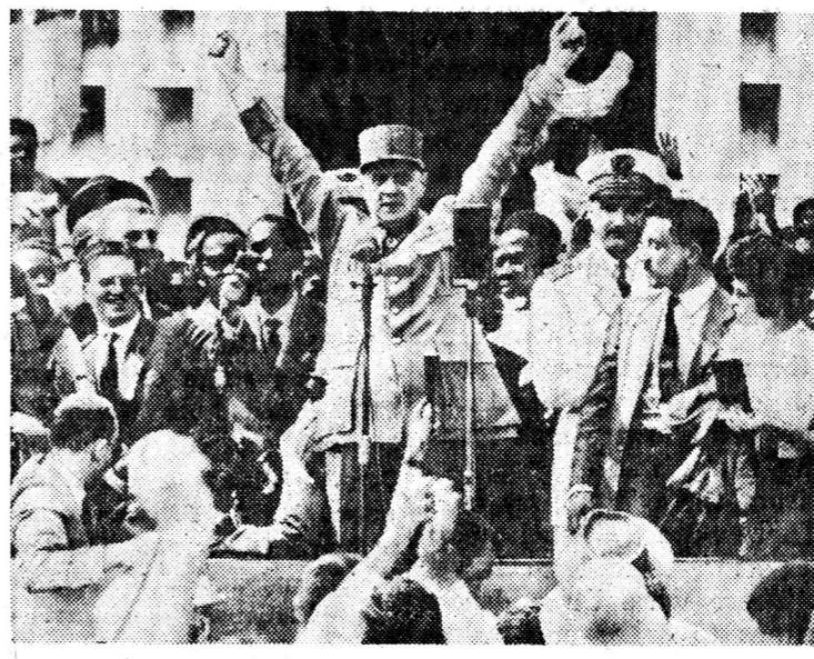
With a flapping reminiscent of the eagles that symbolized the regime of his historical model, Napoleon III, de Gaulle exhorts an audience in Africa to support him and restore "the grandeur of France." Though de Gaulle's bonapartist referendum got a huge "oui" vote in France, most Africans voted "non," or "oui" only under duress.