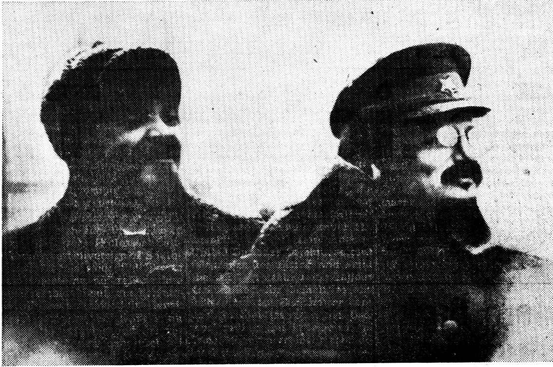
V. I. Lenin (l) and Leon Trotsky. They shared the leadership of the 1917 Russian Revolution that brought history's first workers' state into being just 41 years ago this week. For years prior to the revolution, the Bolshevik Party resisted strong pressures to enter into coalitions with the liberal wing of the Russian capitalist class. Lenin and Trotsky's consistent refusal to water down their socialist program paved the way for the ten days of 1917 that continue to shake the world.

The response to this important development was evident throughout the political vanguard. Members of the Communist Party saw that it was possible to oppose the policies of bureaucrats of the Foster type without becoming anti-Soviet. In fact many of them came to realize that united socialist electoral activity offers an important means for defending the socialist conquests in the Soviet Union as well as bringing dramatic attention to such issues as the struggle for