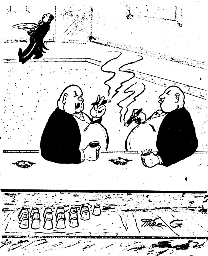
"I hired an efficiency expert, and the first useless job he tried to eliminate was mine."

Pioneer Publishers 116 University Place New York 3, N.Y.