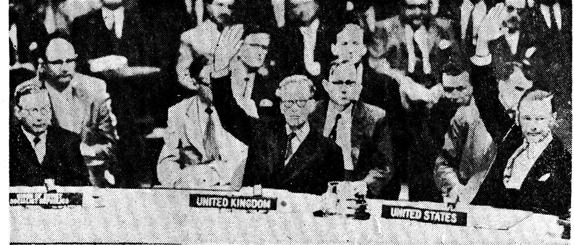
American and British delegates to the UN Security Council are voting against Russia's resolution calling for the withdrawal of foreign troops from Lebanon and Jordan. The resolution was defeated 8 to 1 with Sweden and Japan abstaining. Among those voting with the U.S. were such delegates as Chiang Kai-shek's personal emissary from Taiwan, and the representative of Iraq's monarchy overthrown by the July 14 revolution.