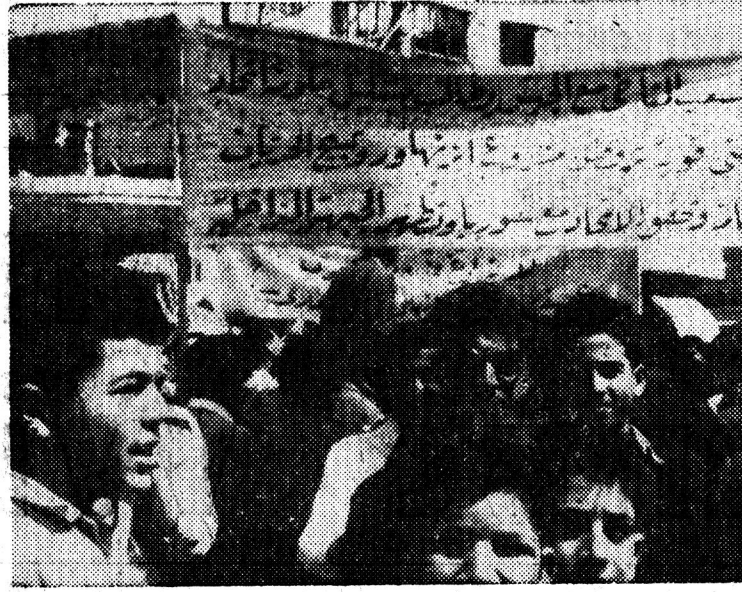
This demonstration took place in Jordan in April 1957, just before King Hussein with U.S. support under the Eisenhower Doctrine overthrew the democratically-elected Parliament. The banner reads, "The people in cooperation with the Army demand formation of a strong national government that would reject the Eisenhower Plan and achieve confederation with Syria."

dent), the U.S. landed its troops in Lebanon on July 15. Another motive may have been the invasion and overthrow of the Arab nationalist regimes in Iraq and Syria.