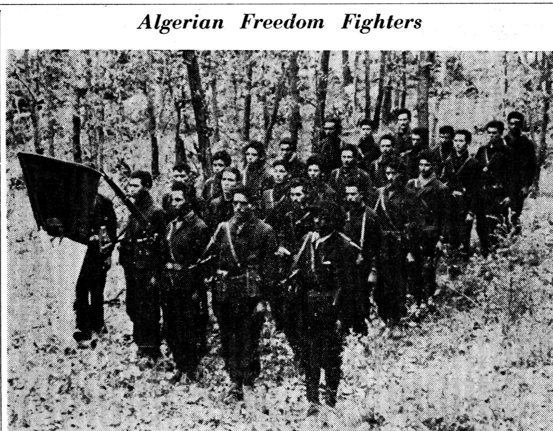
Recruits to the Algerian Liberation Army training in the woods. The Algerian war for national liberation began Nov. 1, 1954. French imperialism has used all the methods of Nazism in its attempt to hold on to the colony.